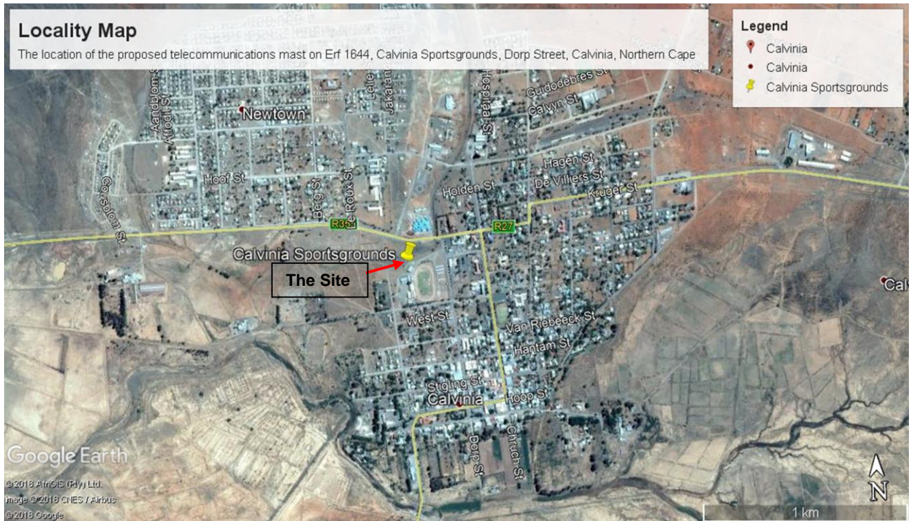
Figure 1: Google Earth view of the site location.

According to SANBI BGIS, the site would historically have contained Bokkeveld Sandstone Fynbos which is listed as “vulnerable” on the National Environmental Management: Biodiversity Act (Act No. 10 of 2004) Final Summary of Listed Ecosystems (GN 34809 – 09 December 2011).