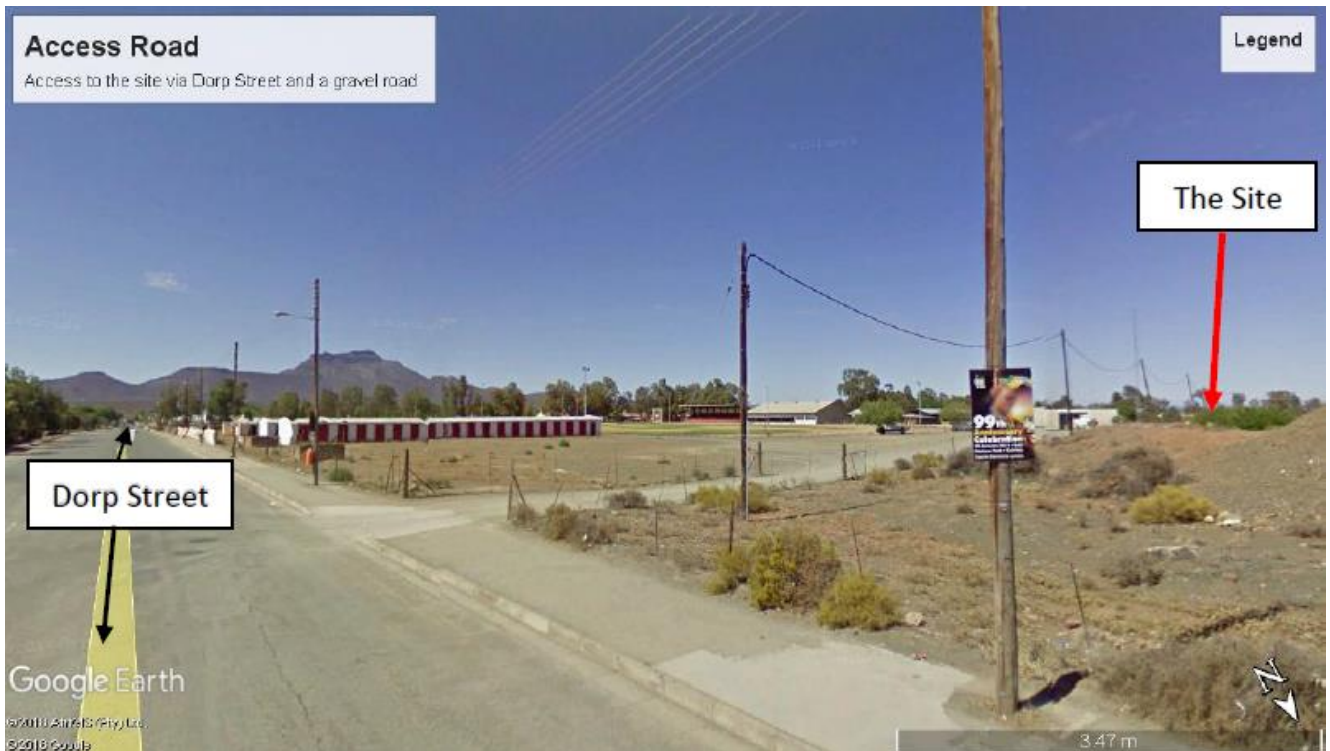
Figure 2: Google Earth street view of the accessed road for the proposed site (red arrow).