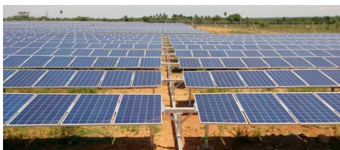
Figure 1: Single axis solar PV module tables raised 500mm above ground level

The project is the establishment of an array of crystalline solar photovoltaic (PV) modules grouped into tables or panels of 20 modules each, together with associated infrastructure for the generation of 5MW of electricity. The PV tables would form an array covering an area of 20ha, surrounded by a perimeter fire access road and fence. The PV tables will be raised approximately 500mm above ground level and have single axis tracking systems allowing maximisation of solar energy harvesting for conversion to electrical energy. A similar solar PV array is depicted in Figure 1 below.