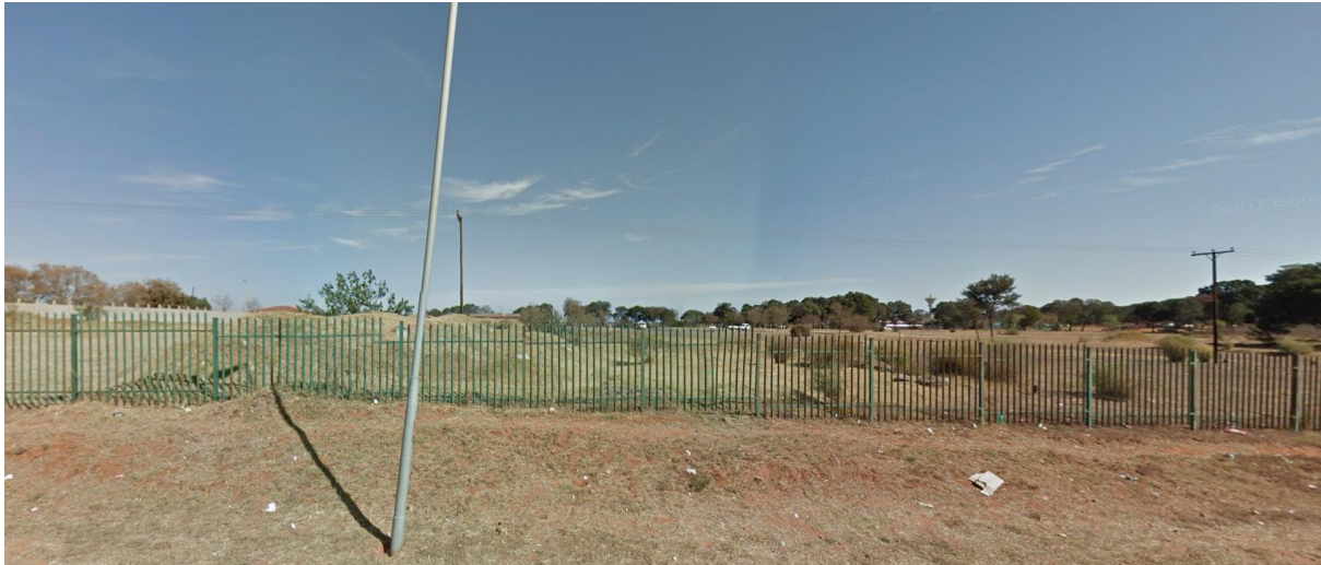
Photograph 2: Site characteristics (north)