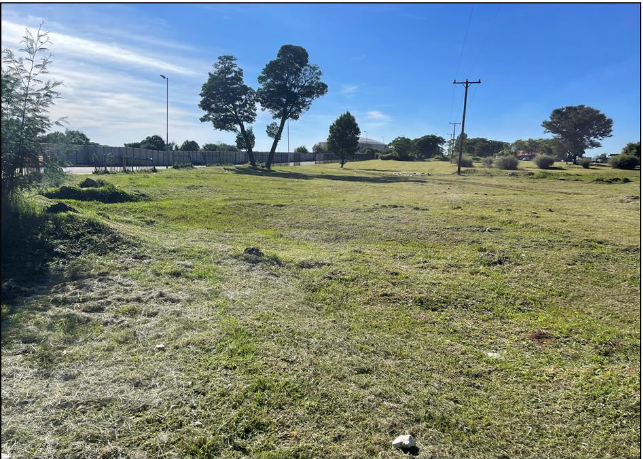
Photograph1 indicating the area earmarked for development