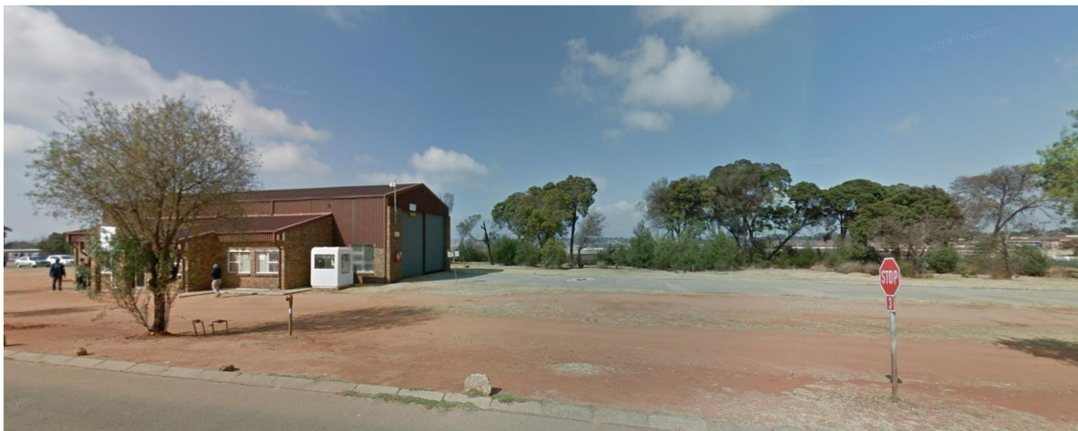
Photograph 3: Site characteristics (south)