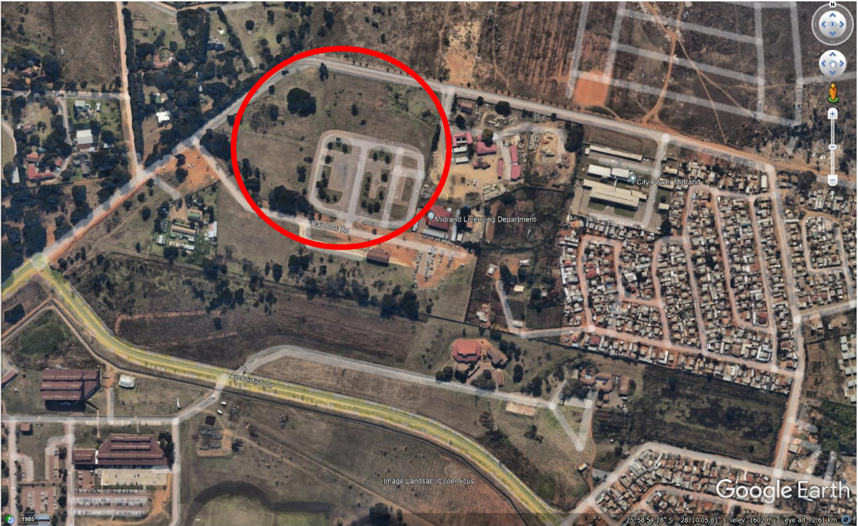
Figure 2: Close-up view of the study area (please note the completely disturbed landscape)