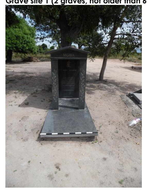
3.2.7 Does the site/s contain any marked graves and burial grounds?The site does contain marked graves or burial grounds.Grave site 1 (2 graves, not older than 60 years)