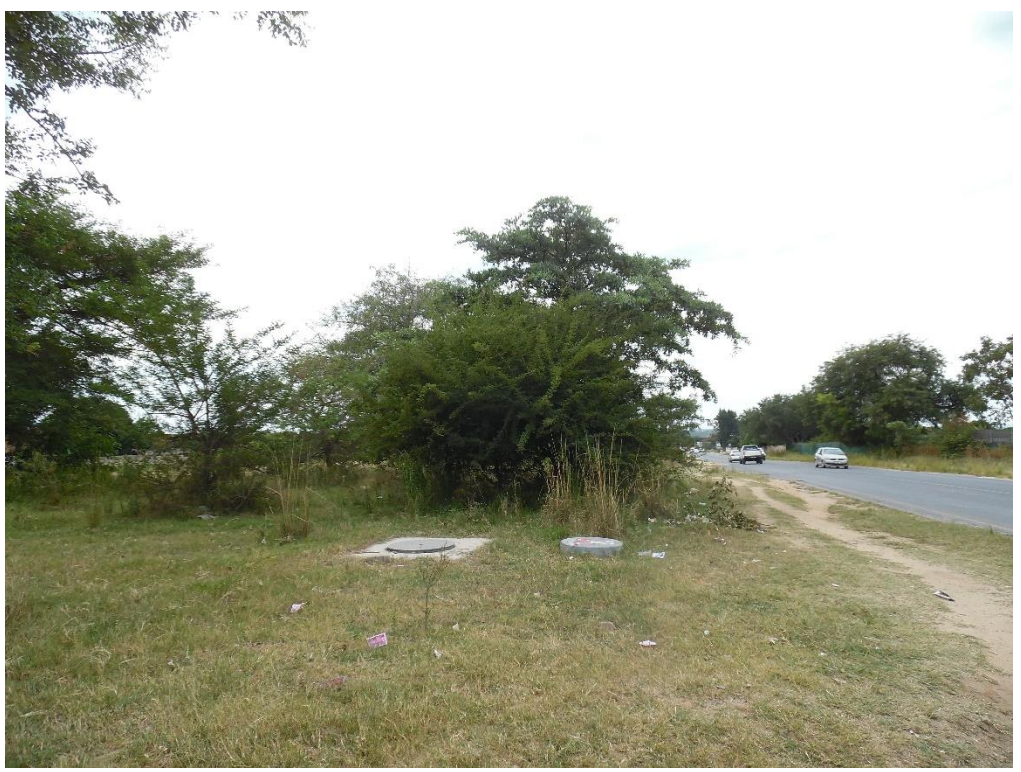
Photograph 10: Site characteristics