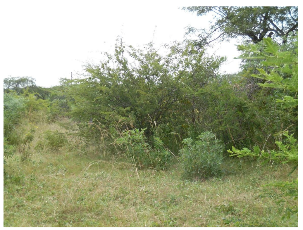
Photograph 7: Site characteristics