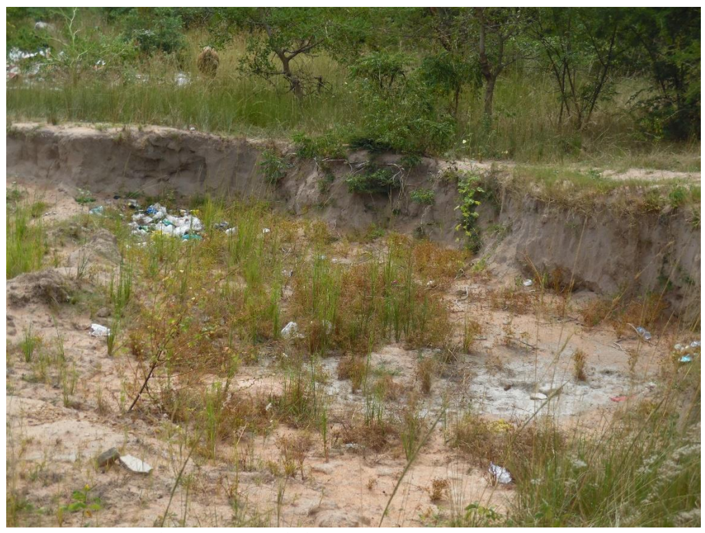
Photograph 8: Site characteristics