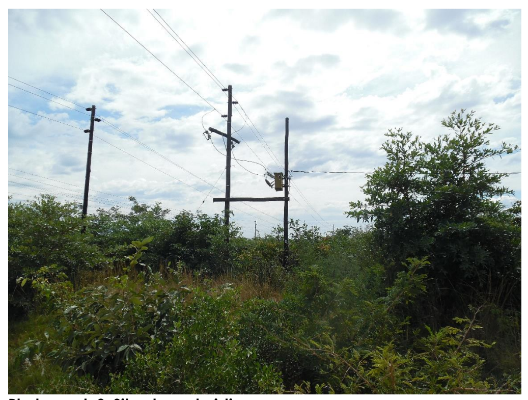
Photograph 9: Site characteristics