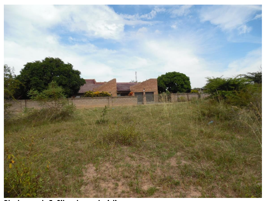
Photograph 5: Site characteristics