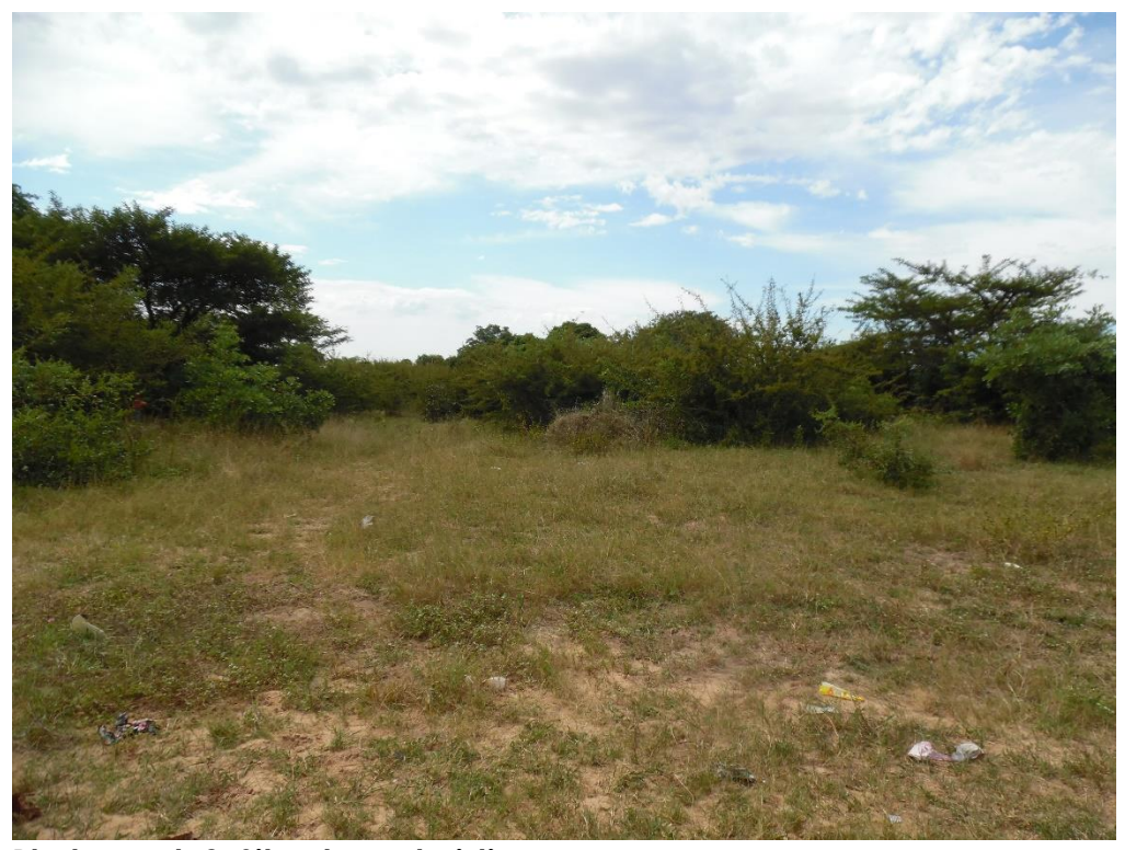
Photograph 2: Site characteristics