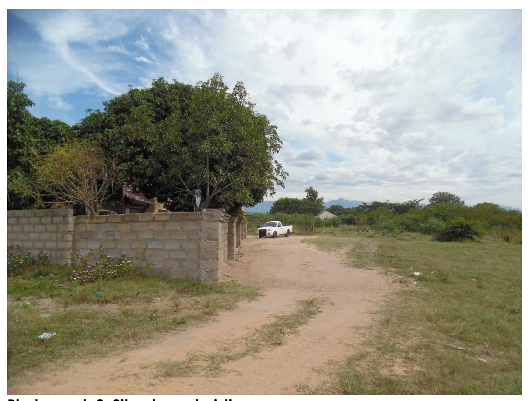
Photograph 3: Site characteristics