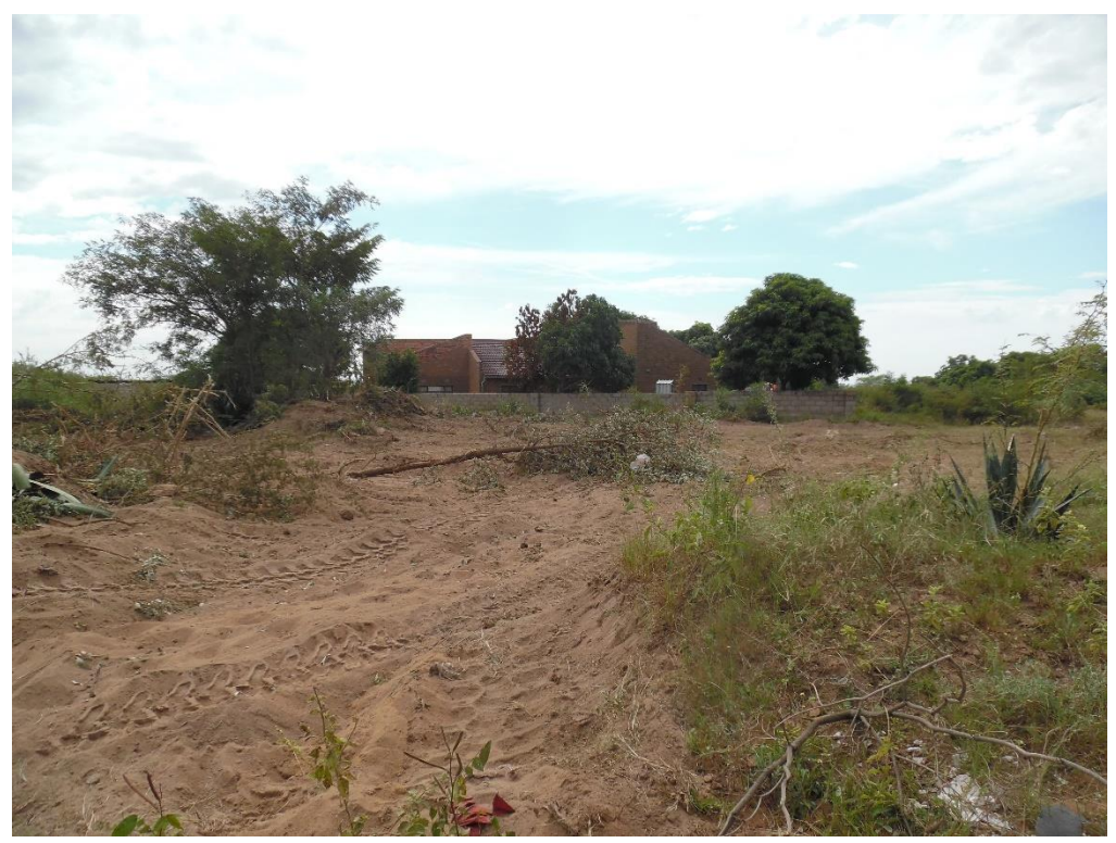
Photograph 6: Site characteristics