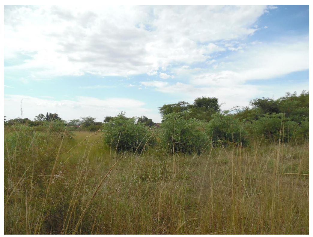
Photograph 4: Site characteristics