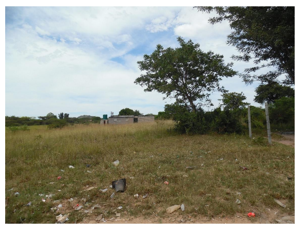
Photograph 1: Site characteristics