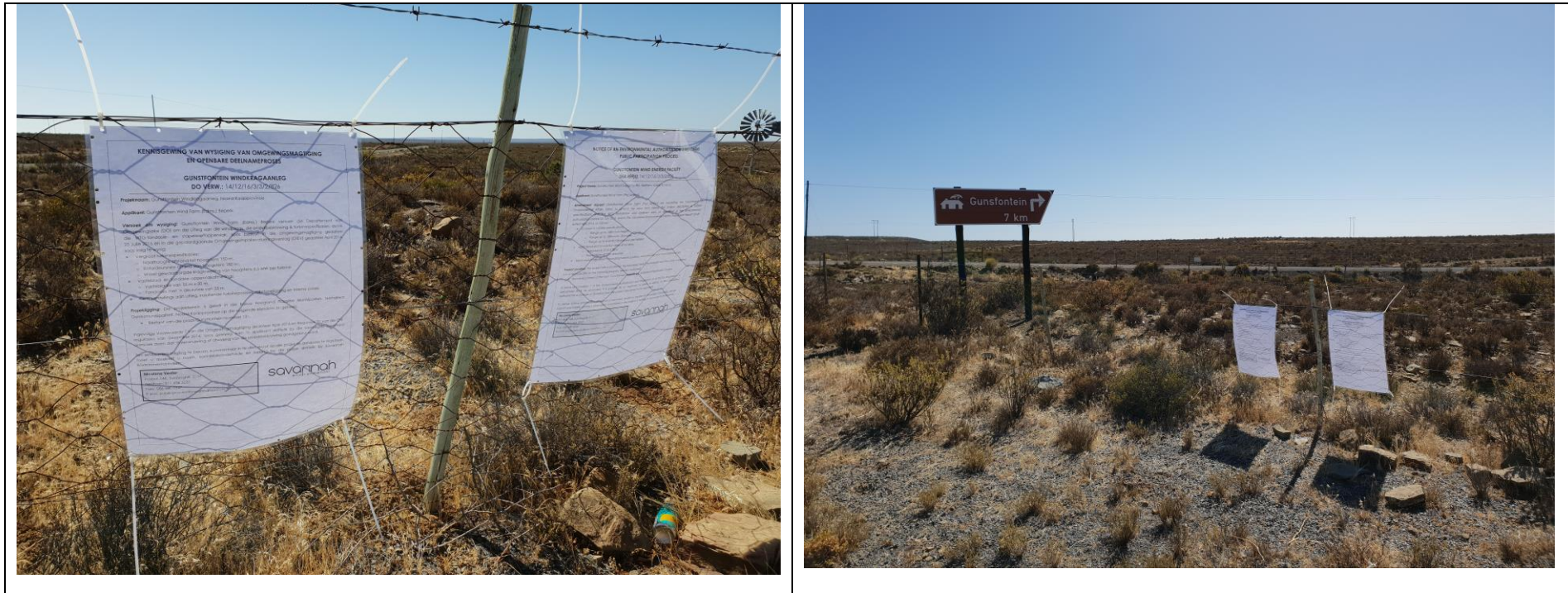
Figure 1: Site notices: Afrikaans and English – placed on boundary fence of access road to the Gunstfontein WEF, along the R354. Co-ordinates: 32°31'27.04"S; 20°38'11.13"E