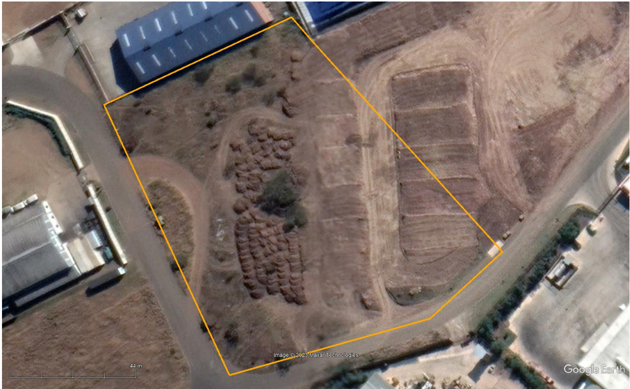
Figure 4: Project design.