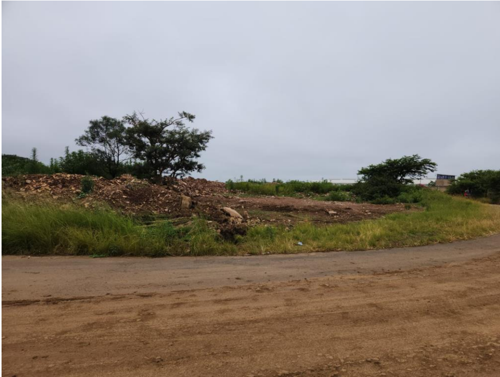
Figure 6: View of site showing disturbance and industrial buildings adjacent to the property.