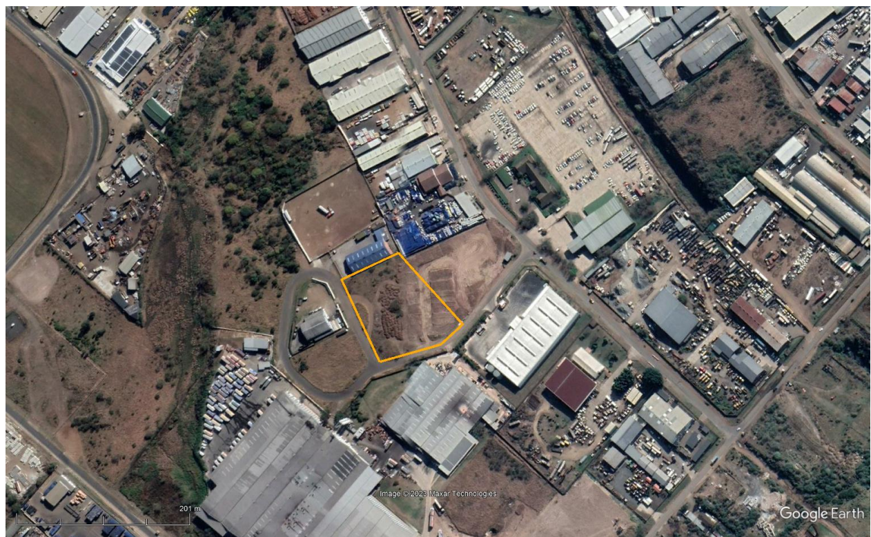
Figure 3: Location of the site in relation to surrounding environment.