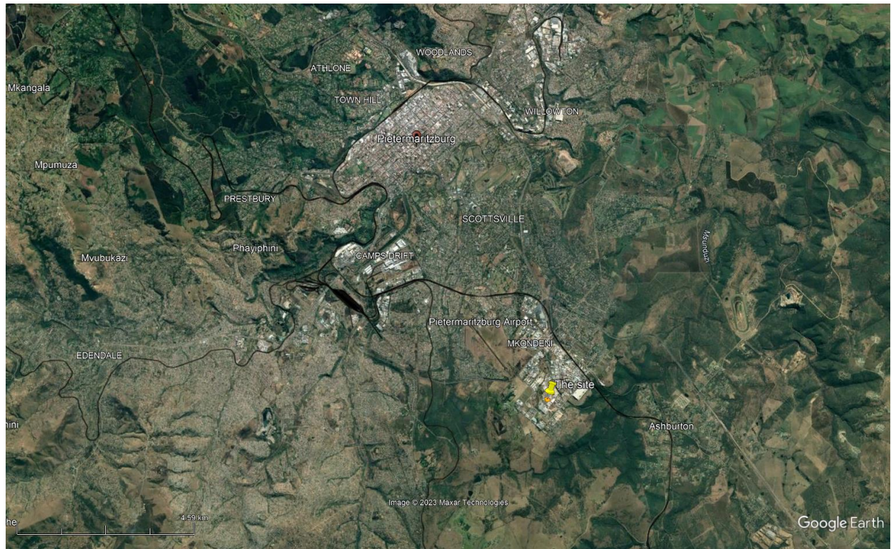
Figure 2: Location of the site in relation to Pietermaritzburg.