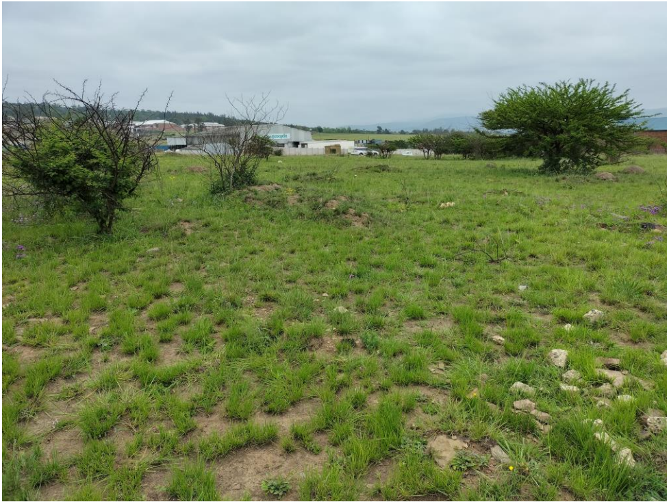
Figure 8: Site vegetation.