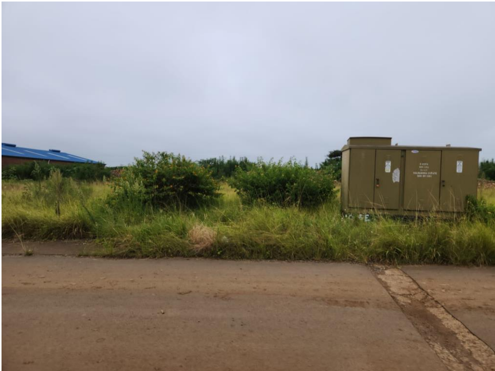
Figure 9: Pioneer vegetation in the study area.