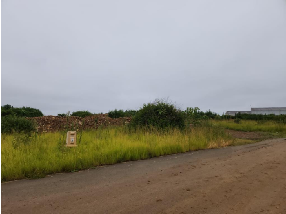
Figure 5: Note the disturbance on site.