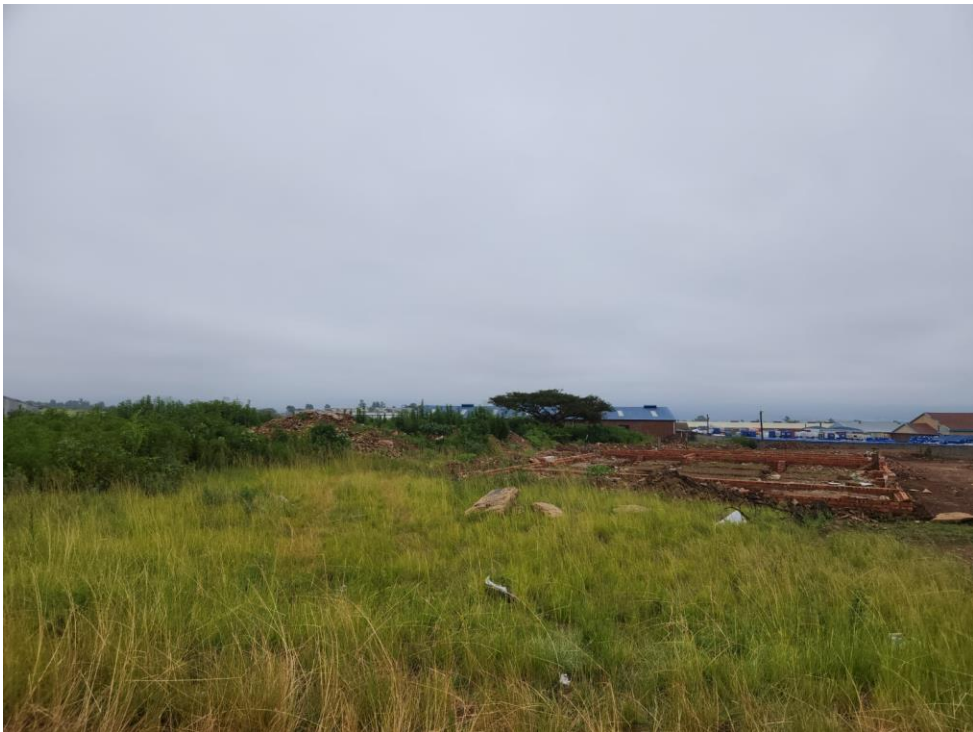
Figure 7: Site vegetationsn and inducstrial building on surrounding land.