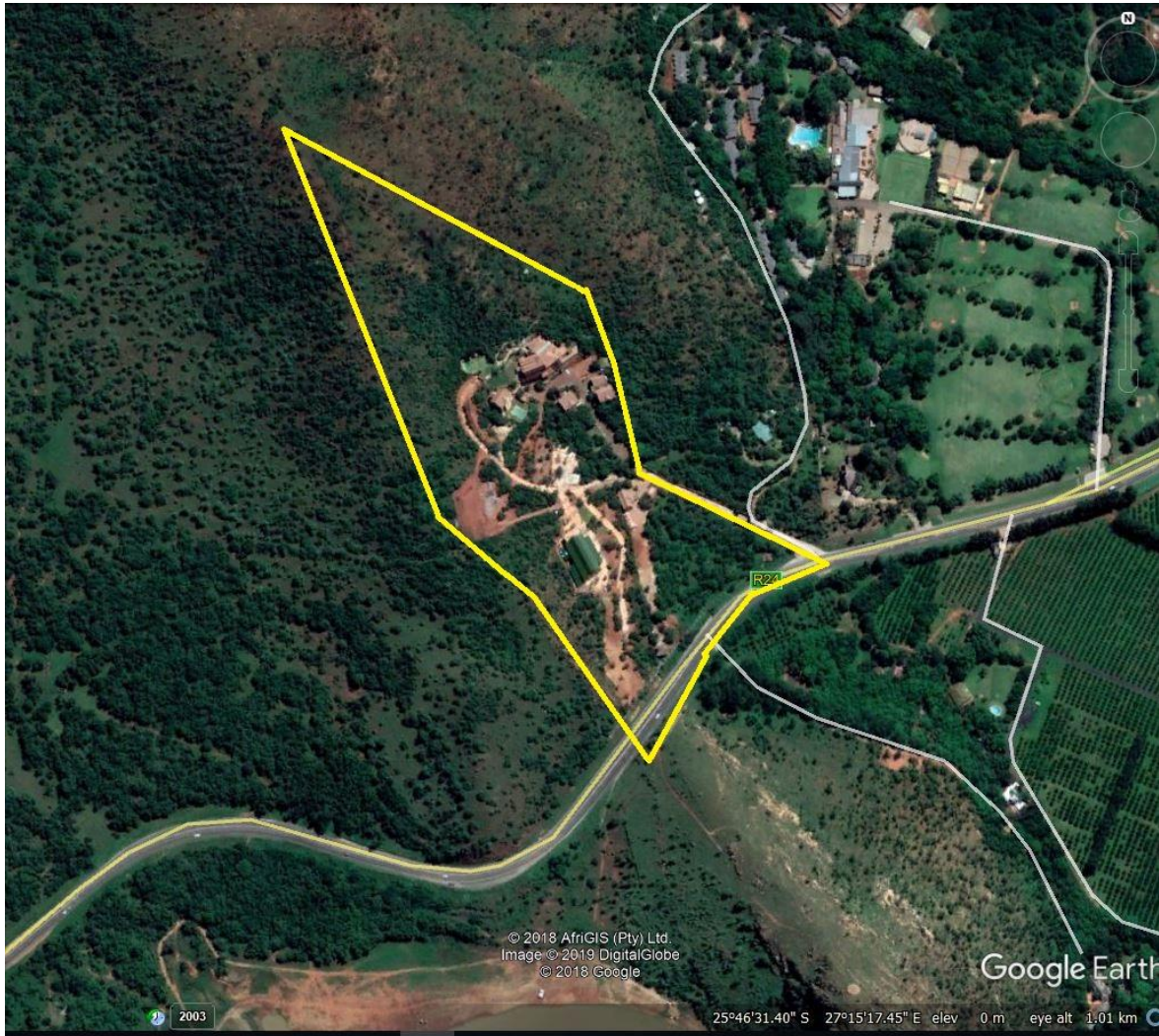
Figure 1: Google Earth photo indicating the study area (yellow polygon)

The study site covers parts of Portion 21 and 85 of the Farm Boschfontein 330JQ, Rustenburg, North West Province (Fig. 1). It is situated southwest of Rustenburg north-west of the N24 road.