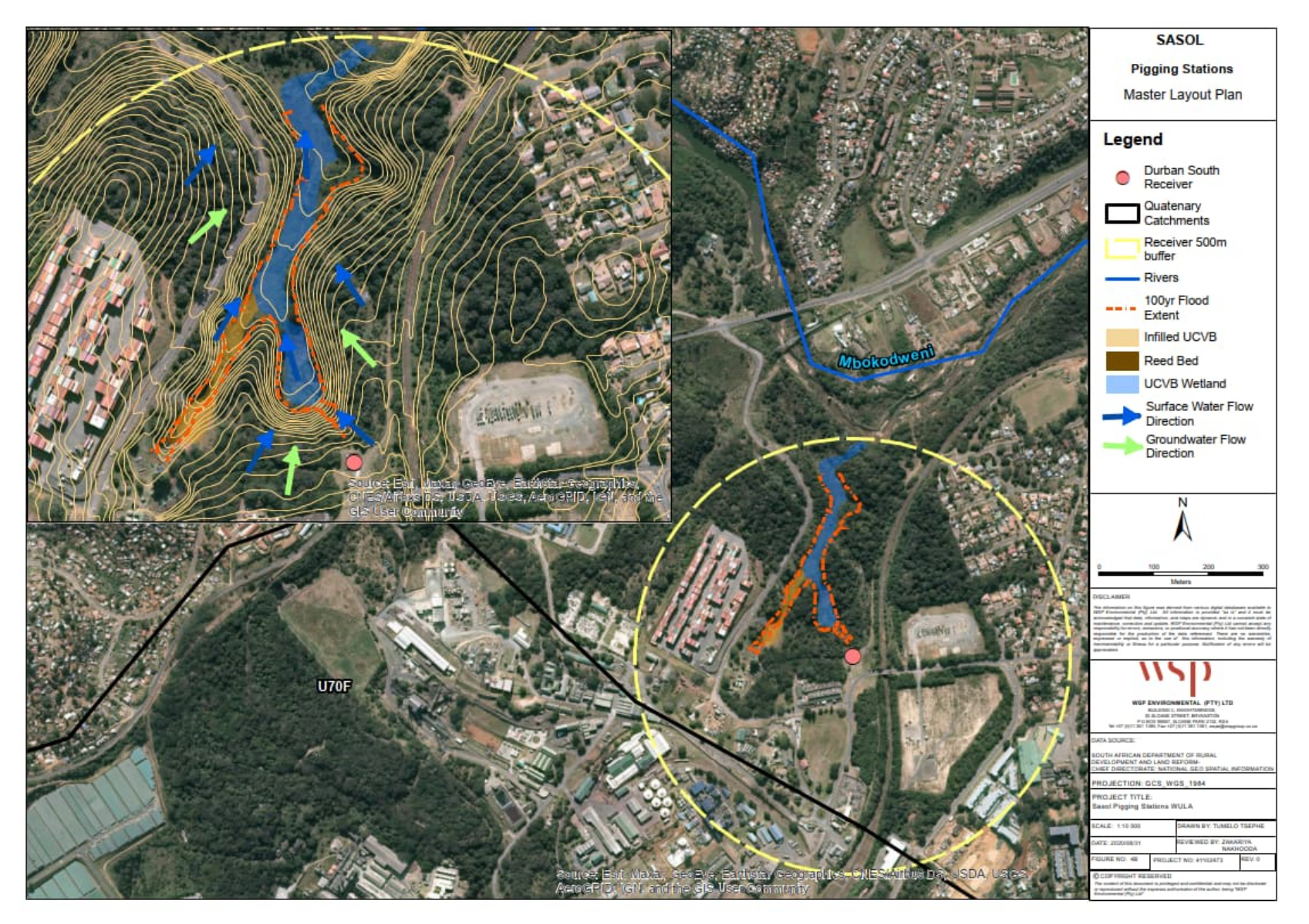
Locality Map of the Sasol Receiver Station