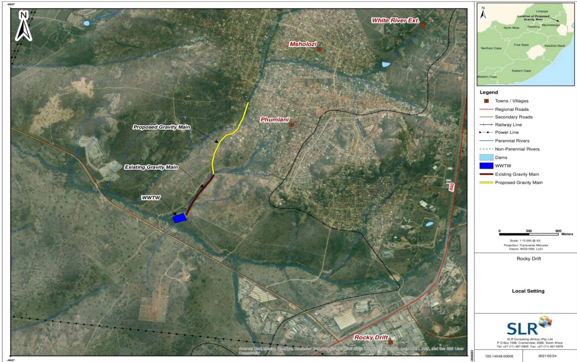
FIGURE 2-1 LOCAL SETTING OF THE PROJECT