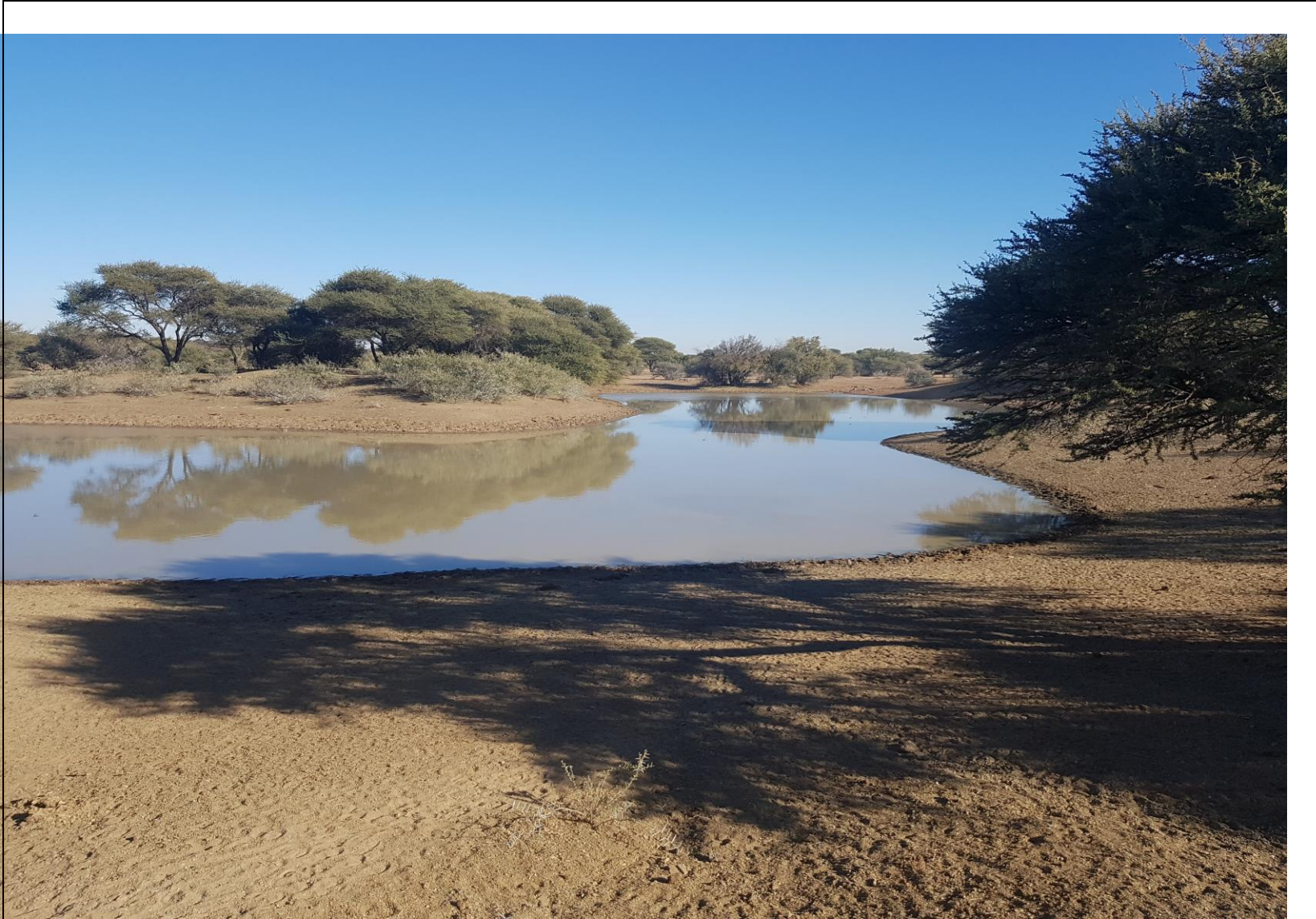
Figure 9: North Western Corner Watercourse (28°58'18.93"S; 24° 4'37.09"E)