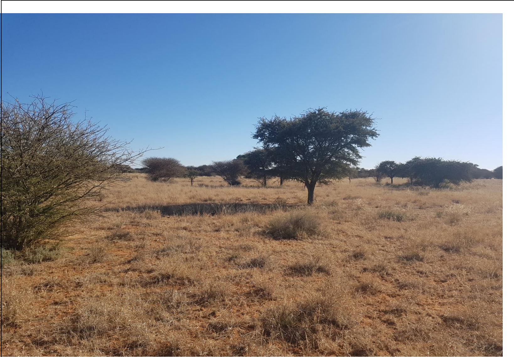
Figure 7: Western View (28°58'20.37"S; 24° 5'34.24"E)