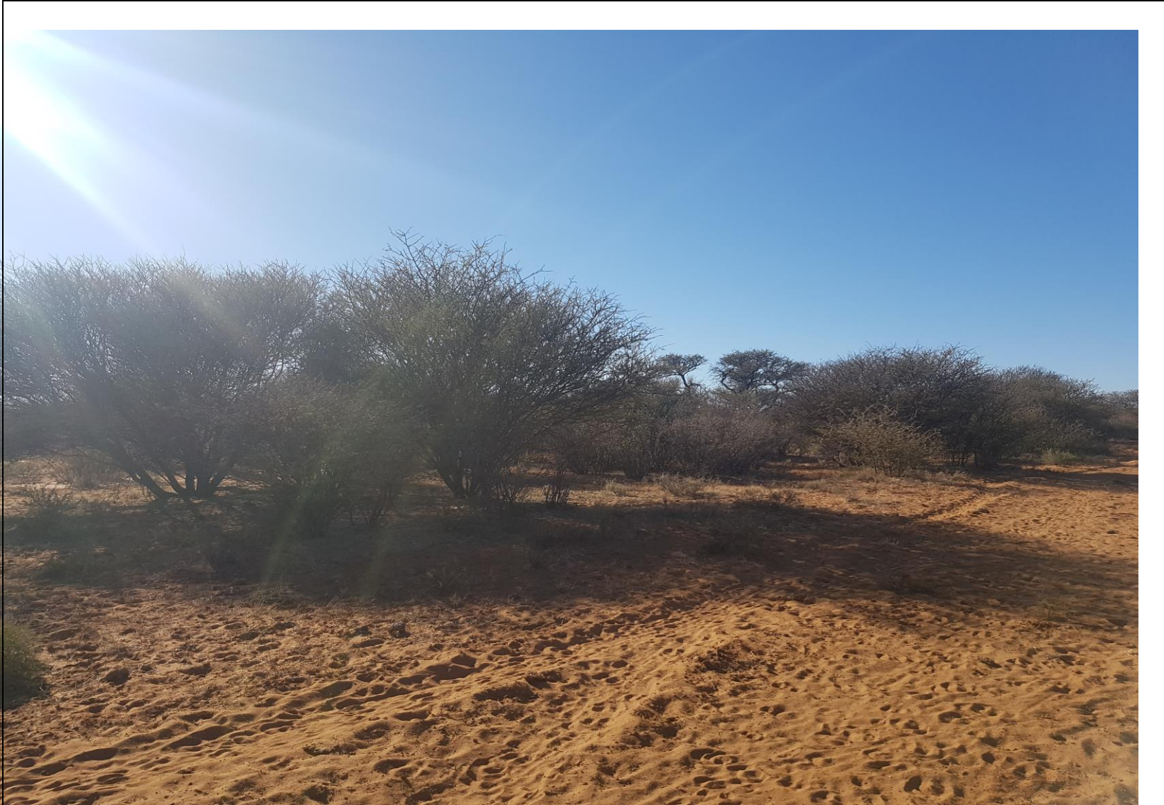
Figure 4: South Eastern View (28°58'20.37"S; 24° 5'34.24"E)