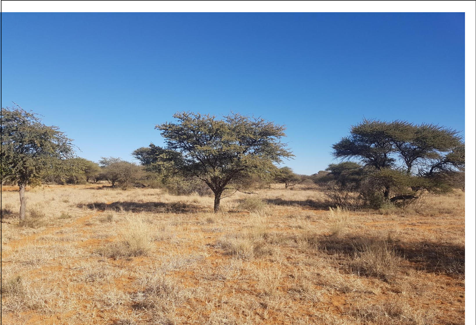
Figure 1: Northern View (28°58'20.37"S; 24° 5'34.24"E)