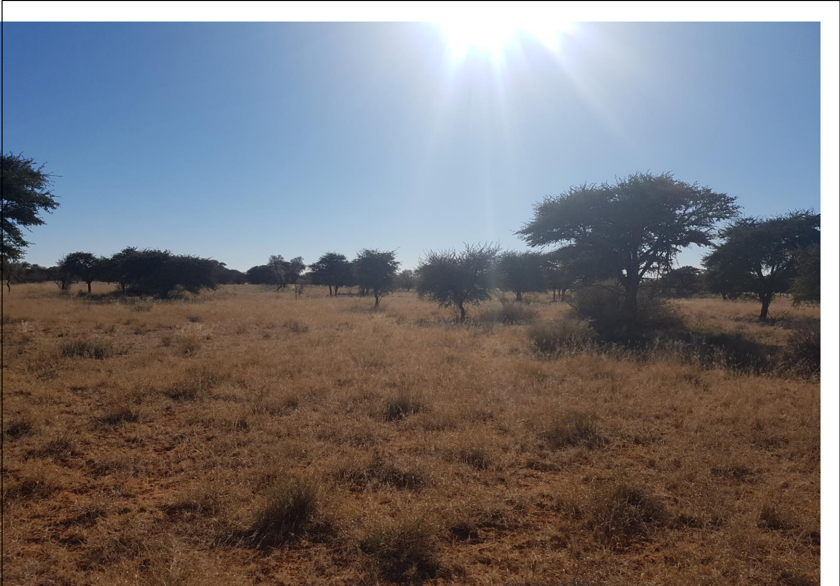
Figure 2: North Eastern View (28°58'20.37"S; 24° 5'34.24"E)