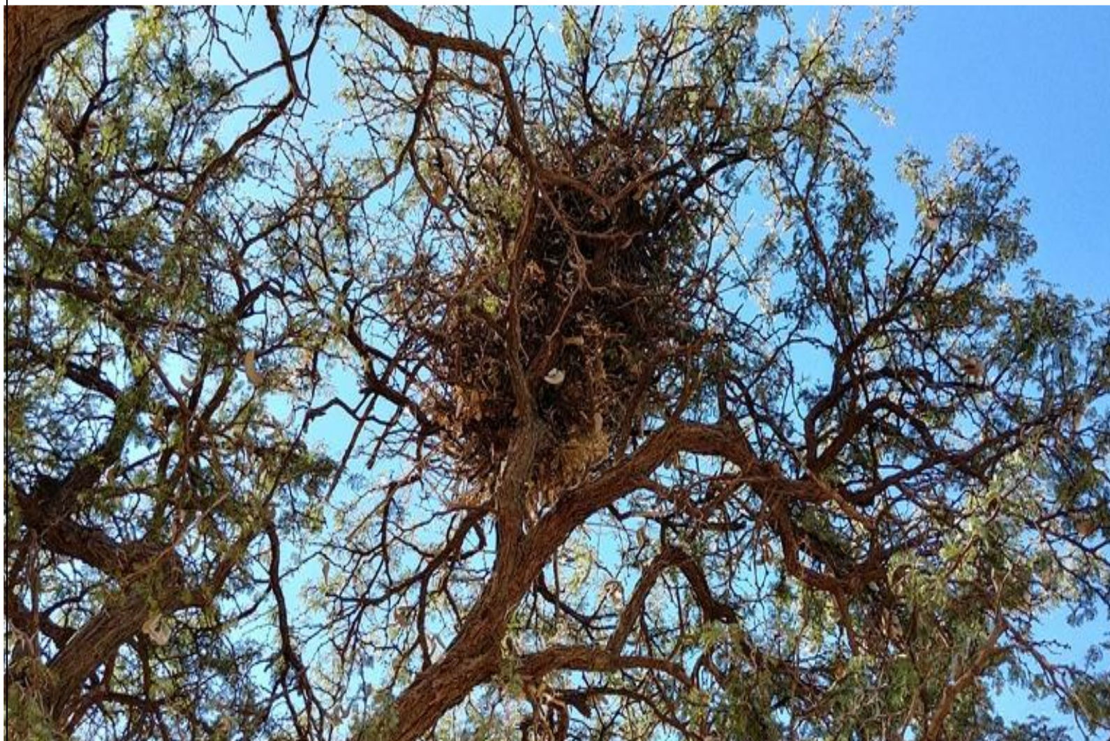
Figure 10: African white-backed vulture nest ( Gyps africanus )