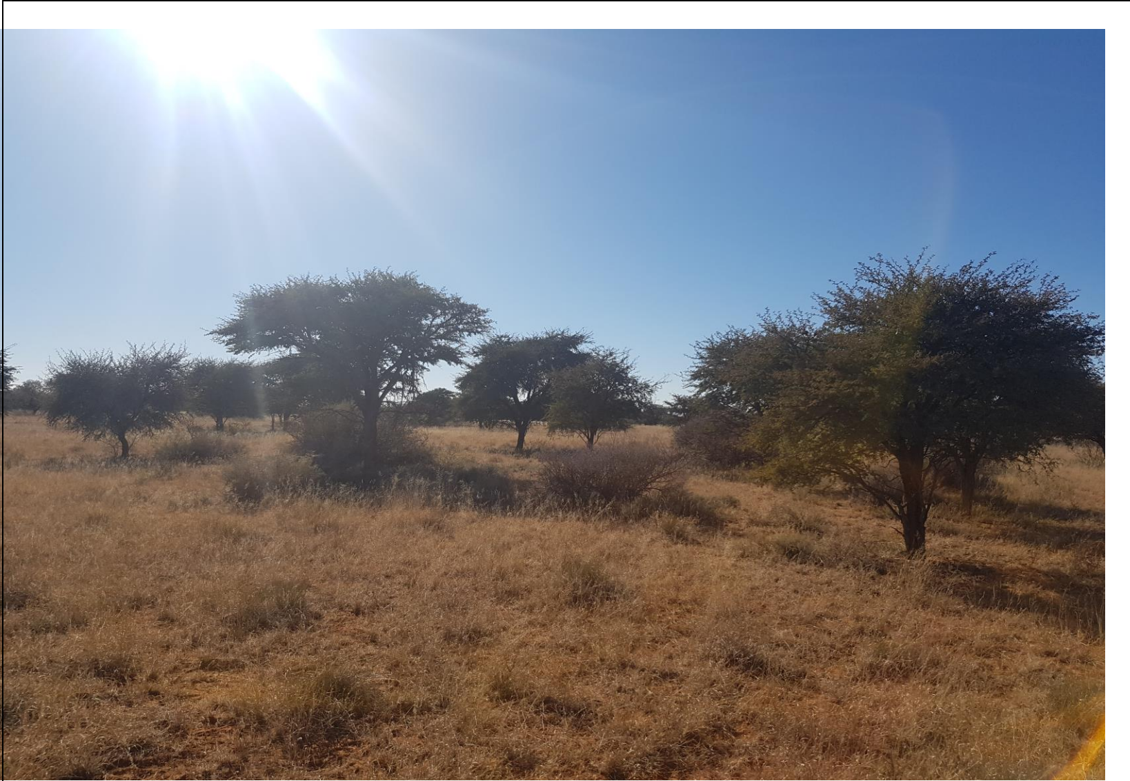
Figure 3: Eastern View (28°58'20.37"S; 24° 5'34.24"E)