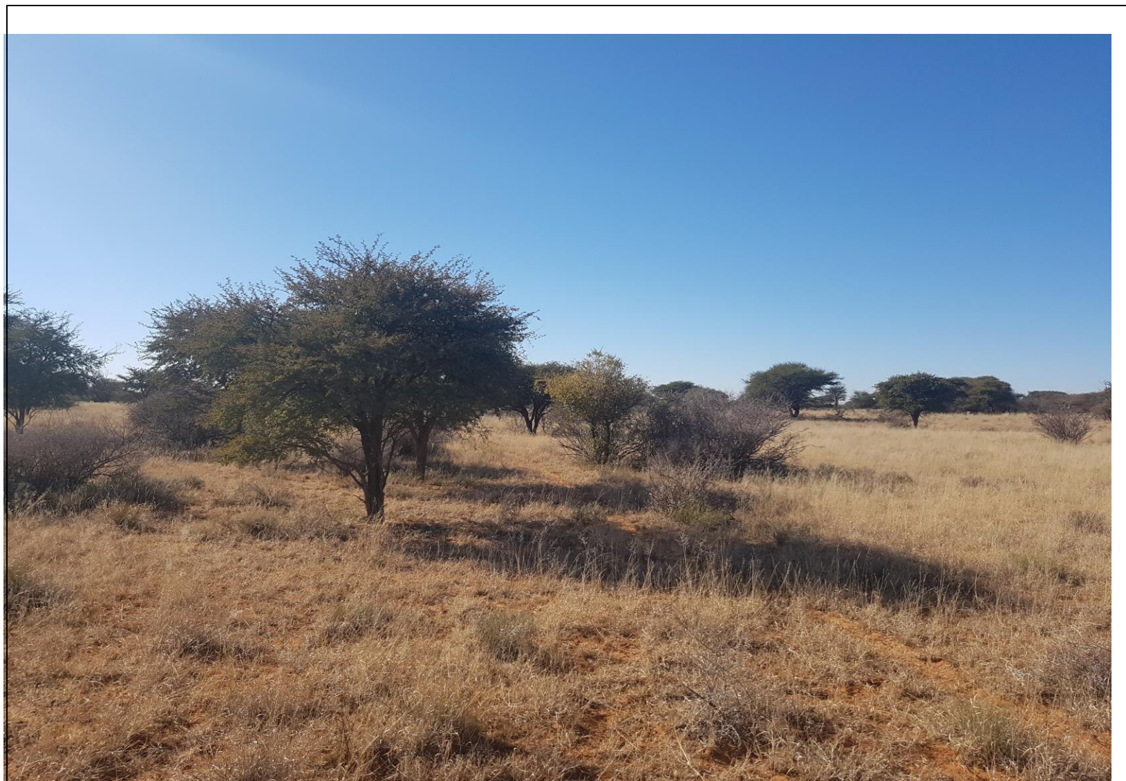
Figure 5: Southern View (28°58'20.37"S; 24° 5'34.24"E)