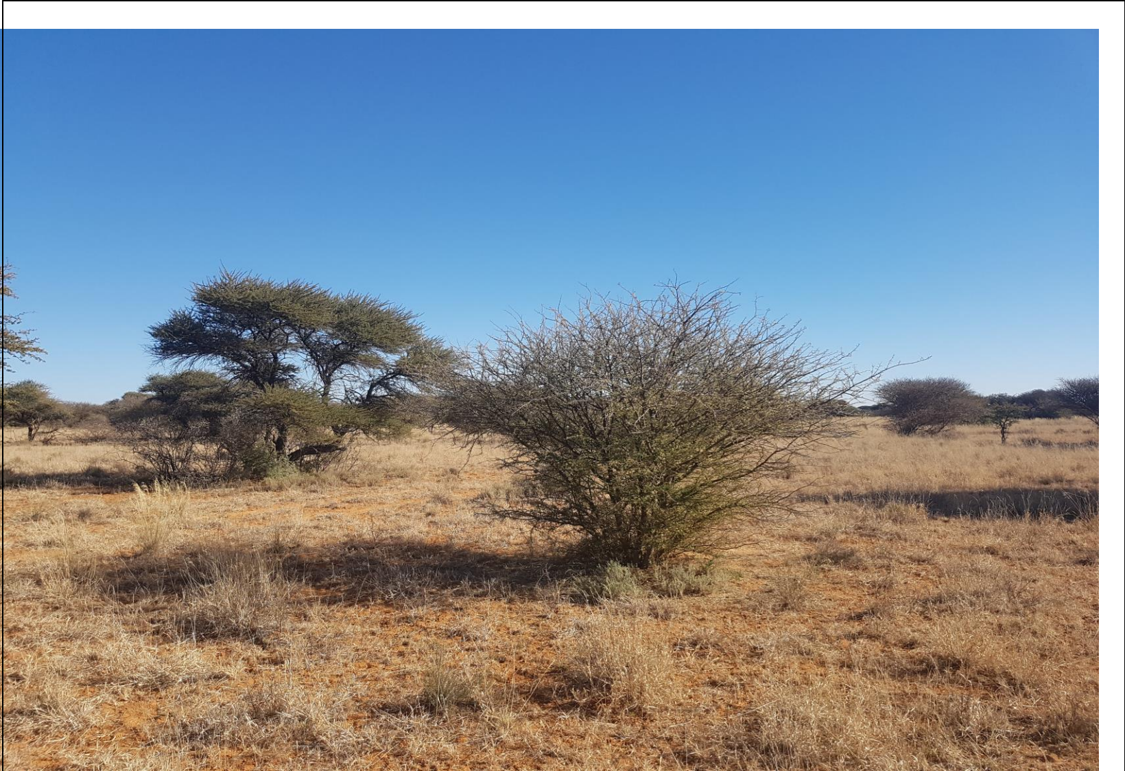
Figure 6: South Western View (28°58'20.37"S; 24° 5'34.24"E)