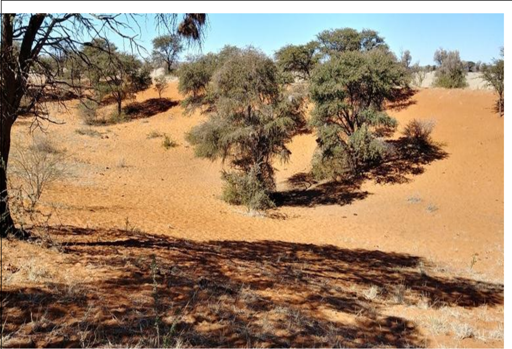
Figure 11: Bone Crusher (28°59'26.98"S; 24° 5'0.70"E)