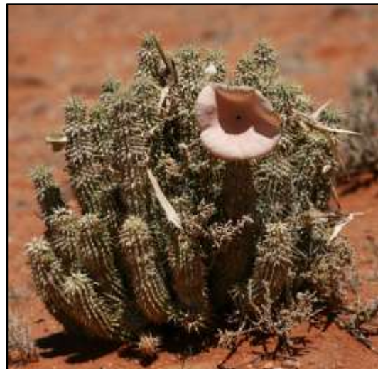
Figure 4: Hoodia gordonii