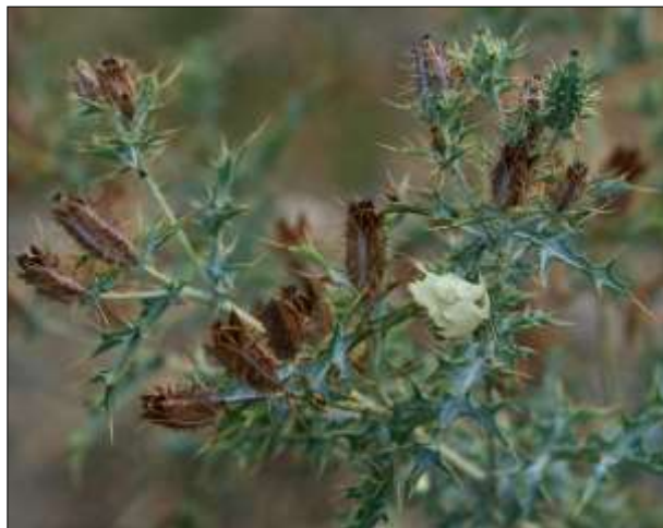
Figure 8: Argemone ochroleuca