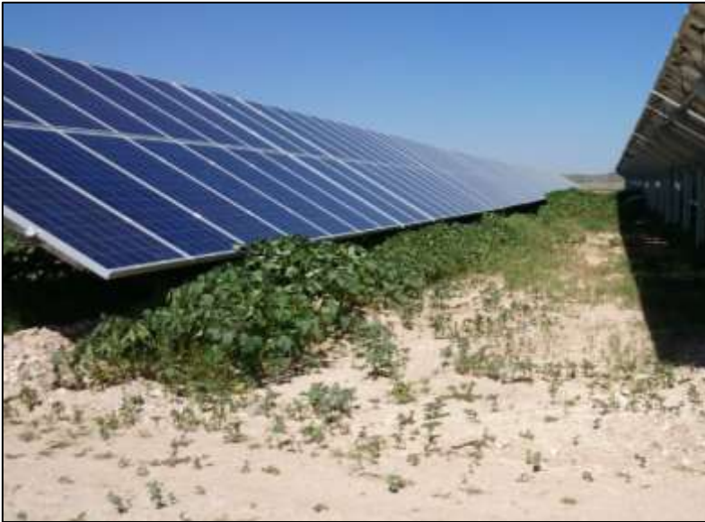
Table 5: A dense infestation of Stinkblaar ( Datura ferox ) growing at a South African solar PV plant shortly after construction. A large proportion of this invasion could have been avoided if the vegetation beneath the panels had not been cleared as this vegetation would have utilised the water running off the front of the panels and limited the invasion of the Datura .