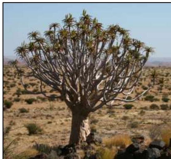
Figure 6: Aloe dichotoma