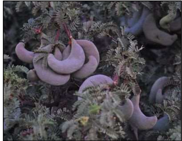
Figure 5: Acacia erioloba