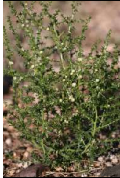
Figure 9: Salsola kali