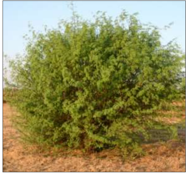
Figure 7: Prosopis glandulosa

When cut down the tree resprouts, so herbicides are usually needed in combination with cutting. The appropriate techniques and herbicides can be obtained from the DAFF website.