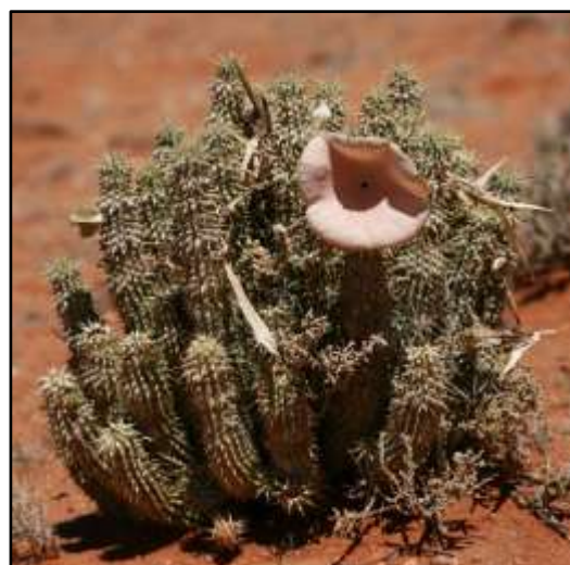
Figure 4: Hoodia gordonii