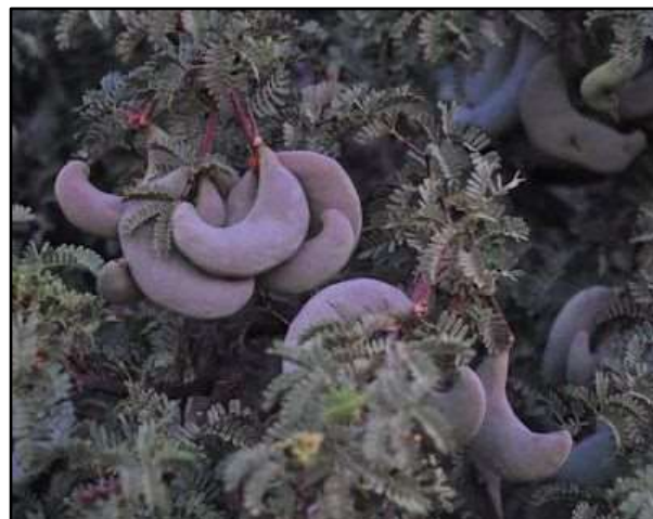
Figure 5: Acacia erioloba