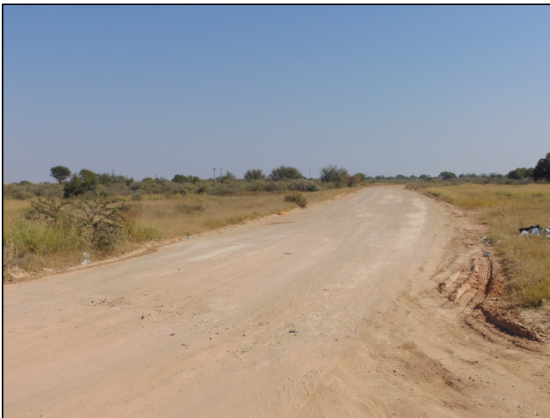
Photograph 1.4.7. Overview of the double lane gravel road towards the proposed Meerkat SPP taken from the N14.