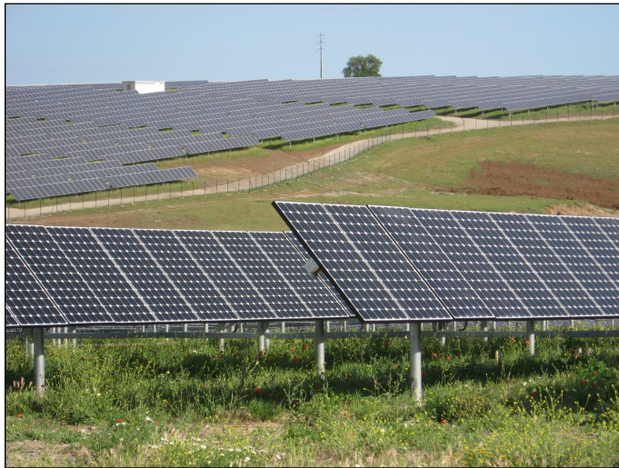
Figure 1.2. Photovoltaic (PV) energy facility.

Photovoltaic (PV) energy facilities make use of the sun's energy in order to generate electricity. This process is also better known as the "Photovoltaic Effect". The Photovoltaic Effect refers to the photon collision with electrons, placing the electrons into a higher state of energy in order to create electricity. A photovoltaic panel consists of the following components: The photovoltaic cells, the inverter, transformers and support structures (Figure 1.2 and 1.3). The components of the PV energy facility will be discussed below.