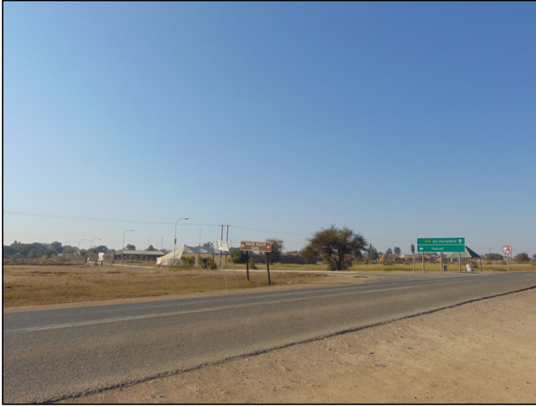
Photograph 1.4.2. The township Huhudi just south of the town of Vryburg.

This section includes the photographs taken during the site visits by the consultant, of the proposed site of the Meerkat SPP and its surroundings. The proposed Meerkat SPP is located in a rural area bordered by other farms. The proposed site is currently used for the grazing for cattle, owned by the Goedgenoeg Family Trust. The proposed site for the Meerkat SPP has small bushes with scattered trees. The access road from the N14 is a double lane gravel road that is in fair condition, but as the road progress towards the site, the road becomes a single lane gravel road that is narrow, and the condition of the gravel road is in poor condition. The gravel road is currently being maintained by the Naledi Local Municipality.