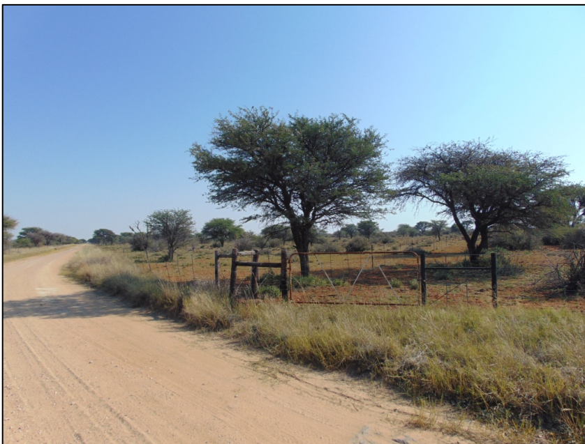
Photograph 1.4.5. Overview of the Meerkat SPP taken in a North Western direction.