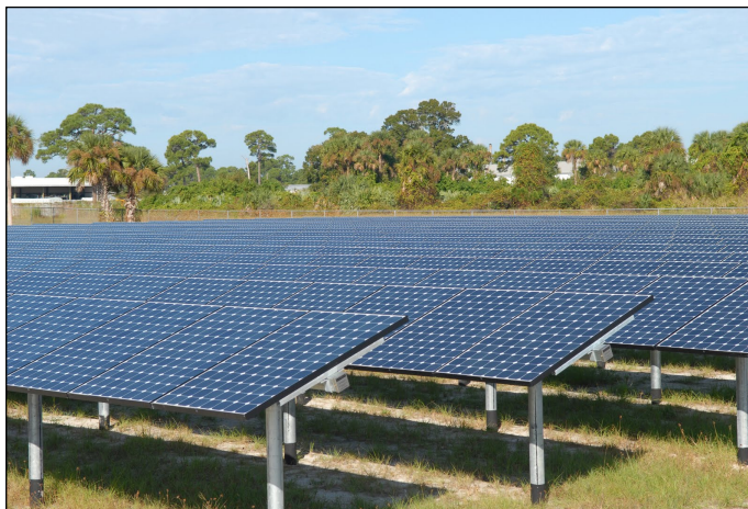
Figure 1.3. Stationary solar PV panels.