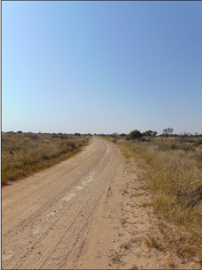
Photograph 1.4.6. Overview of the single lane gravel road towards the proposed Meerkat SPP.