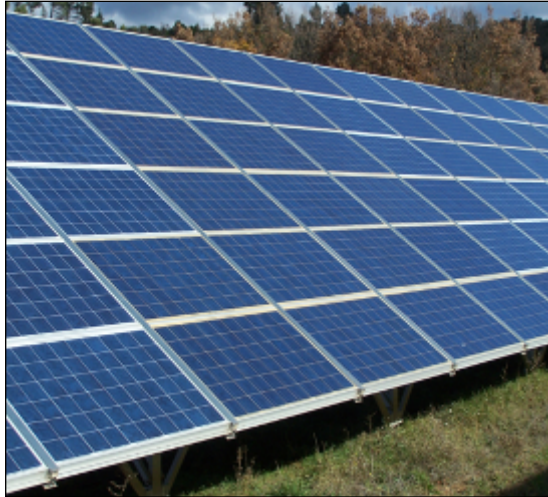
Figure 1.4. Photovoltaic Cells and Panels.

PV cells consist of silicon. This is referred to as the semiconductor, which when it is charged on either side (positively- and negatively charged) with electrical conductors, also attached on either side, forms a circuit which captures the released electrons in the form of an electric current. In order to form a photovoltaic panel, the individual PV cells are being linked in a circuit and are placed behind a protective glass cover sheet (Figure 1.4).