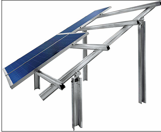
Figure 1.5. PV panels support structure.

The Meerkat SPP and its associated infrastructure is situated on Portion 3 of the farm Vyflings Pan 598, Registration Division IN, and comprises of an area of 250 ha, located within the Naledi Local Municipality. This Independent Power Producer (IPP) will feed the energy of the 115MW Meerkat SPP into the Eskom grid. The precise number of the photovoltaic panels and the placement thereof as well as its associated infrastructures, will be finalized and included in the final Environmental Impact Assessment (EIA).