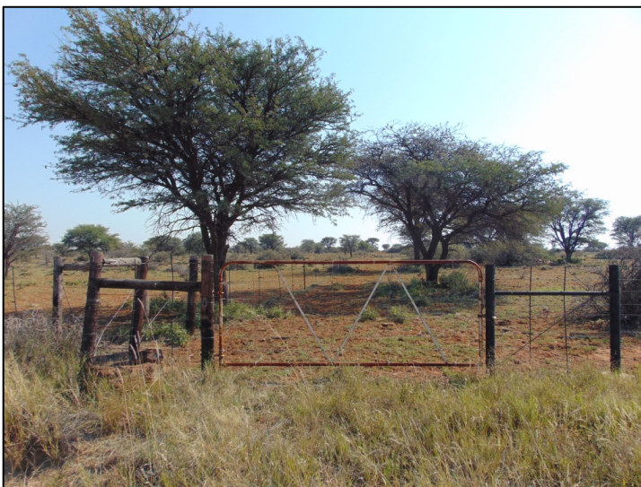
Photograph 1.4.3. Entrance gate to the proposed Meerkat SPP taken in a Northern direction.

This section includes the photographs taken during the site visits by the consultant, of the proposed site of the Meerkat SPP and its surroundings. The proposed Meerkat SPP is located in a rural area bordered by other farms. The proposed site is currently used for the grazing for cattle, owned by the Goedgenoeg Family Trust. The proposed site for the Meerkat SPP has small bushes with scattered trees. The access road from the N14 is a double lane gravel road that is in fair condition, but as the road progress towards the site, the road becomes a single lane gravel road that is narrow, and the condition of the gravel road is in poor condition. The gravel road is currently being maintained by the Naledi Local Municipality.