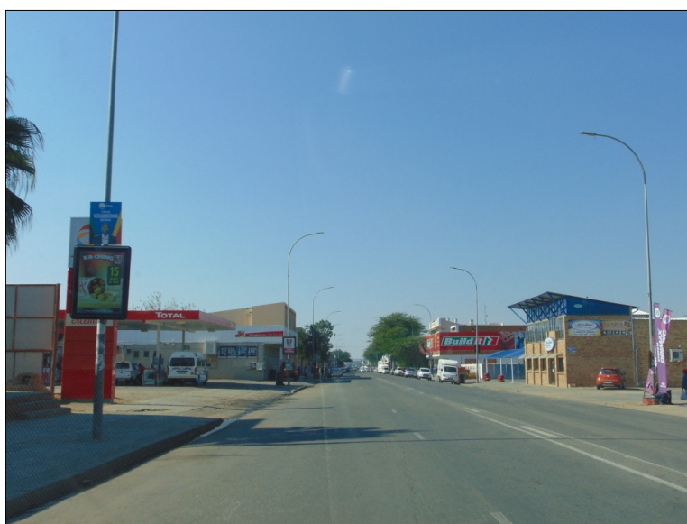
Photograph 1.4.1. Market street, the main road in Vryburg.

The Meerkat SPP is located on Portion 3 of the farm Vyflings Pan 598, and covers a proposed magnitude of 250ha. The Meerkat SPP is located in the North West Province of South Africa, situated approximately 23km North West of the town Vryburg. The town of Vryburg lies in a rich cattle-farming area and hosts one of the largest cattle sales in the Southern Hemisphere. The town of Vryburg is also known as the “Texas of South Africa” due the town being seen as a frontier town. Today, Vryburg mainly serves as the agricultural and industrial hub for the region and is located along the N14 and N18 national roads and situated on the main railway lines from Cape Town to Botswana and Zimbabwe. Situated just South of the town of Vryburg is the township Huhudi.