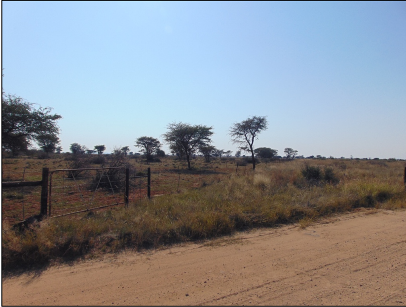
Photograph 1.4.4. Overview of proposed Meerkat SPP taken in a North Eastern direction.