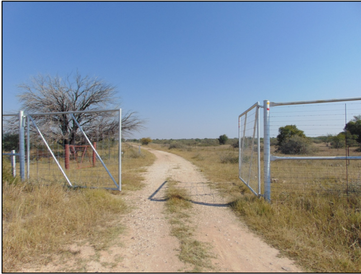
Photograph 1.4.4. Overview of the access road of the Sonbesie SPP taken in a North Western direction.