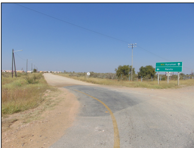
Photograph 1.4.3. Entrance from the N14 on the Reivilo gravel road towards the Sonbesie SPP.

This section includes the photographs taken during the site visits by the consultant, of the proposed site of the Sonbesie SPP and its surroundings. The proposed Sonbesie SPP is located in a rural area bordered by other farms. The proposed site is currently used for the grazing of cattle, owned by Charmakor Vryburg (Pty) Ltd. The proposed Sonbesie site has small bushes with scattered trees. The access road from the N14 is a double lane gravel road that is in fair condition, however, the gravel roads from the access point of the site is narrow gravel roads. The site gravel roads are currently maintained by the farmer, and the access road from the N14 to the entrance gate of the site is maintained by the local municipality. There is also a rural settlement in close proximity to the proposed site.