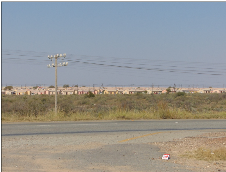
Photograph 1.4.6. Overview of a rural area in close proximity to the Sonbesie SPP.