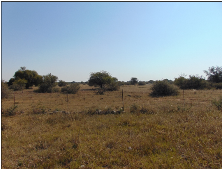
Photograph 1.4.5. Overview of the Sonbesie SPP taken in a Northern direction.