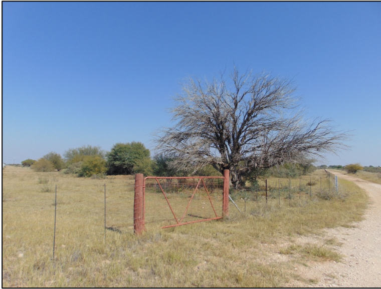
Photograph 1.4.6. Overview of the Sonbesie SPP taken in a South Western direction.