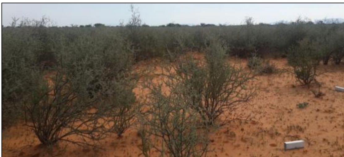
Figure 7: Homogeneous shrub patch at the northern tip of trap transect 3 (see Figure 3). Shrubs range in height between 1.5 and 2 m.