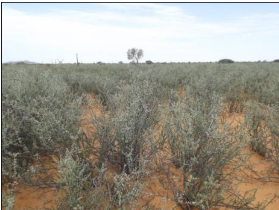
Figure 14: VU3 – a Rhigozum trichotomum bush encroached patch with very poor grass cover.