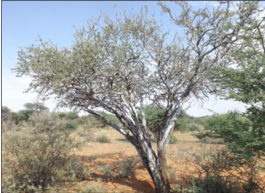
Figure 11: VU2 – portion of Acacia mellifera semi-closed woodland with some grass cover (background) and a specimen of the protected Boscia albitrunca (foreground).

Acacia mellifera subsp. detinens , were also observed in some areas of VU2 (Figure 12).