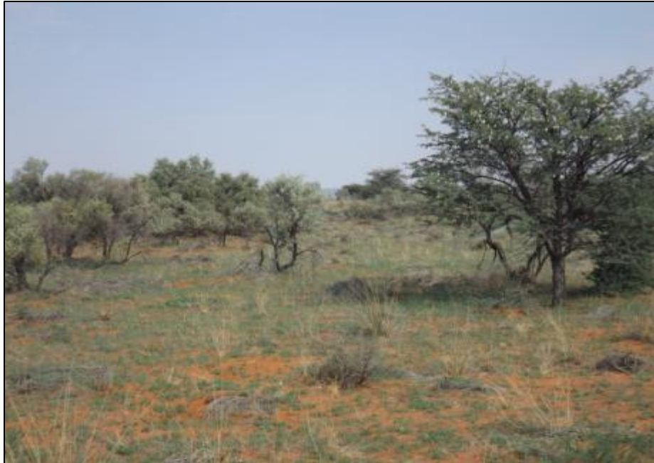
Figure 10: VU1 – portion of Acacia haematoxylon open woodland on the alternative site.

Grewia flava . Dominant graminoids* are Bulbostylis hispidula , Eragrostis pallens , Aristida stipitata , Schmidtia pappophoroides , S. kalahariensis , Stipagrostis uniplumis and Antheophora pubescens . Herbaceous forbs and shrubs that mostly occur in VU1 are Heliotropium ciliatum , Plinthus sericeus , Gisekia africana , Senna italica subsp. arachoides , Elephantorrhiza elephantina , Crotalaria orientalis , Merremia verecunda , Limeum viscosum , Requienia sphaerosperma Hermannia tomentosa and Tephrosia purpurea .