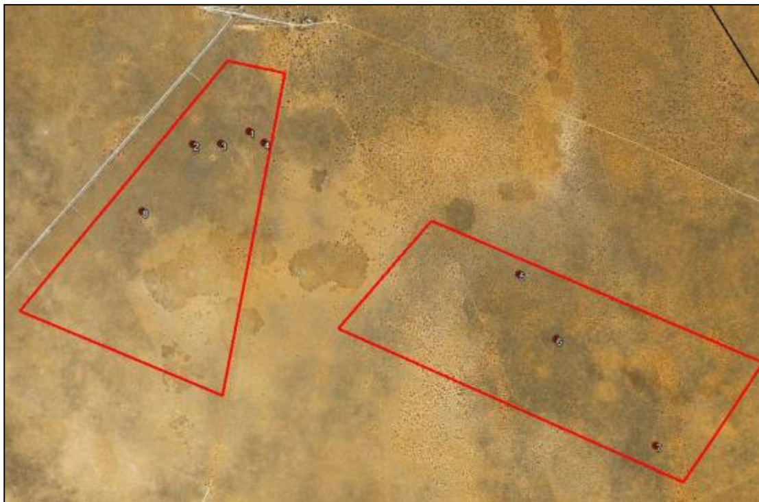
Figure 15: Recorded positions of protected plant species in the study area

Note: The numbered labels on Figure 15 correspond to the serial number (S/N) in the first column of Table 13-1 of Appendix C.