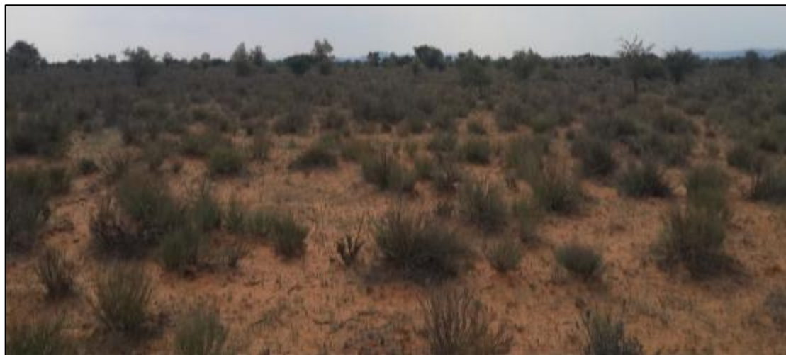
Figure 8: The direct surrounds of trap transect 4.