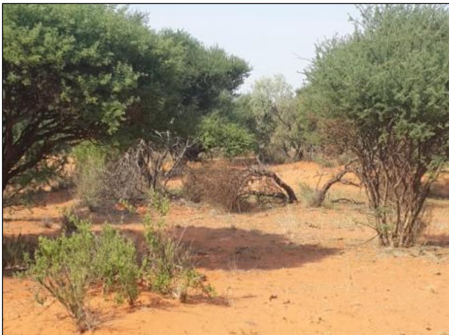
Figure 12: VU2 – portion of Acacia mellifera semi-closed woodland with virtually no grass cover and high level of bush encroachment.