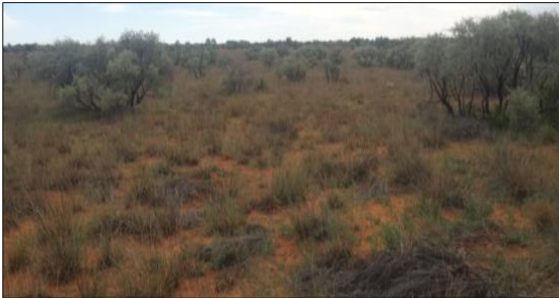
Figure 4: The direct surrounds of trap transect 1.

The study period lasted 3 days and nights with no less than 8 hours spent on the site per day. Four small mammal trap lines were placed in four distinct habitat types (Figures 4, 5, 6 and 8). Traps were removed following the third evening. In an effort to record landscape elements as well as faunal tracks and signs, extensive notes and photographs were taken throughout this period.