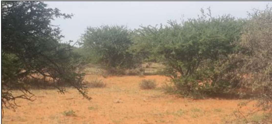
Figure 5: The direct surrounds of trap transect 2.