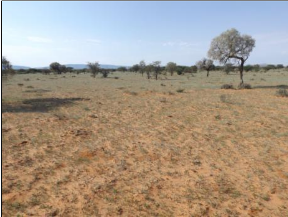
Figure 13: VU3 – Schmidtia pappophoroides open plains with fairly good grass and low tree cover.

in VU3 are to some extent utilized for some or other social activity or use (medicinal, nourishment/food, and/or cultural).