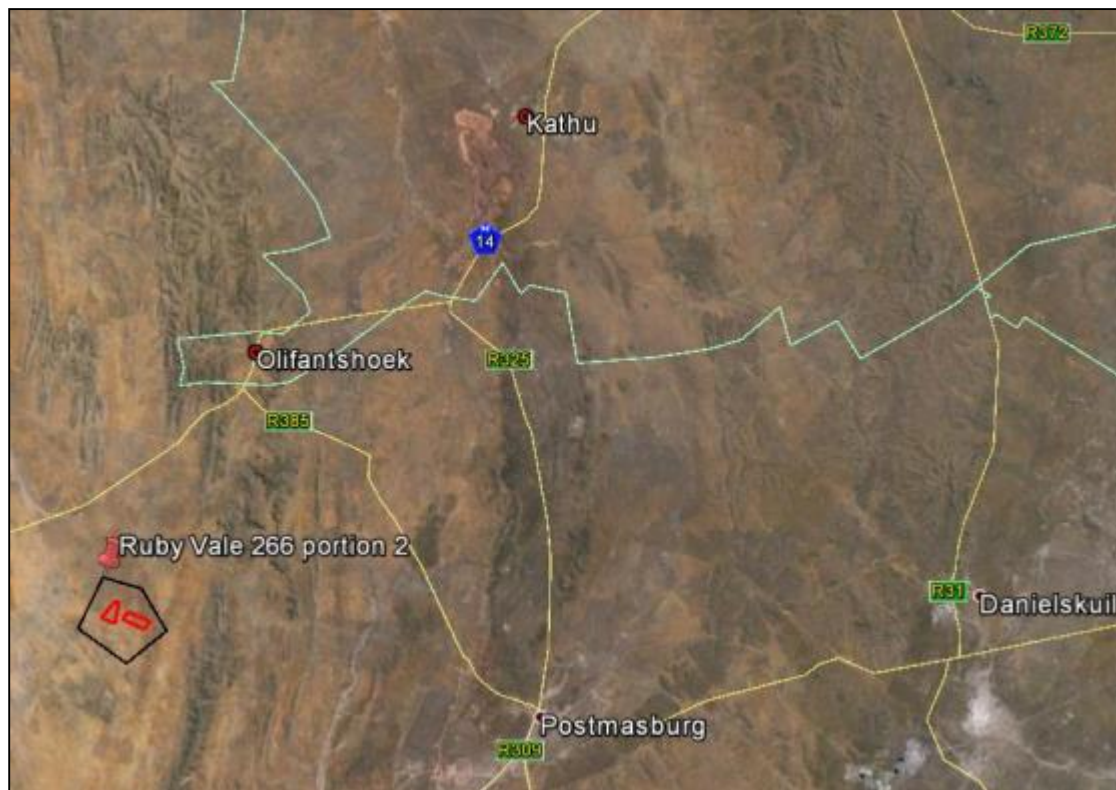
Figure 1: Google earth image indicating the regional setting of the study area

Environment Research Consulting (ERC) was contracted to conduct a biodiversity (faunal & floral) and general habitat assessment of portions of the Remaining portion of Portion 2 of the farm Ruby Vale near Olifantshoek in the Northern Cape Province. This report presents the findings of a once off, summer assessment that was conducted over a three day period from 03 to 05 March 2016.