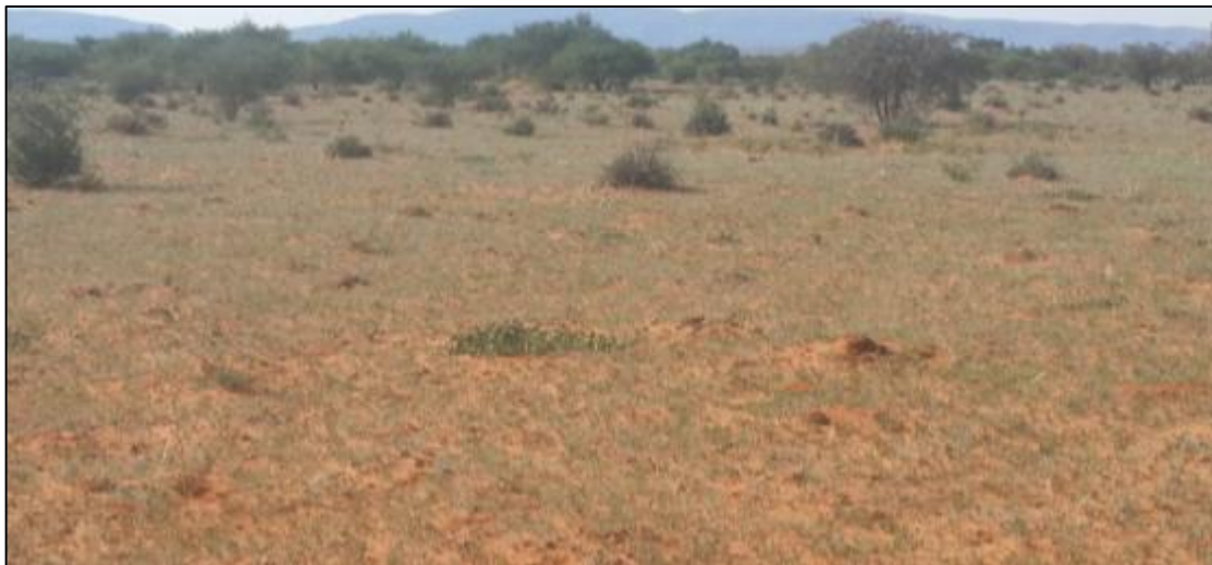
Figure 6: The direct surrounds of trap transect 3.