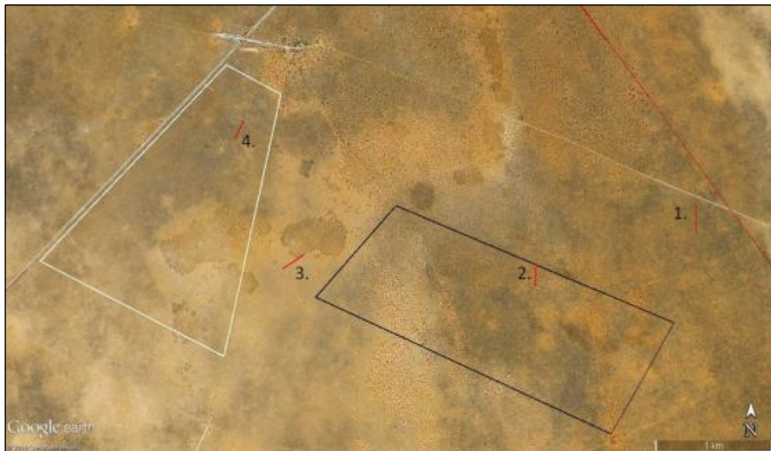
Figure 3: A local scale map. The white and black borders delineate the preferred and alternative sites, respectively. The numbered red lines represent small mammal trap transects. Distinctive black speckles are trees.

Non-invasive walk transects were performed daily, documenting all animal sightings (including spoor and / or scat) in writing or by photograph. Non-invasive walk transects were done along the small mammal trap transects (Figure 3). The area ahead of the observer was observed attentively, specifically for animals flushed from shelter, and stretched a minimum of 250 m. After each trap check a minimum of 20 minutes was designated to examining the environment around each transect, during which I would frequently investigate the area surrounding me with binoculars.