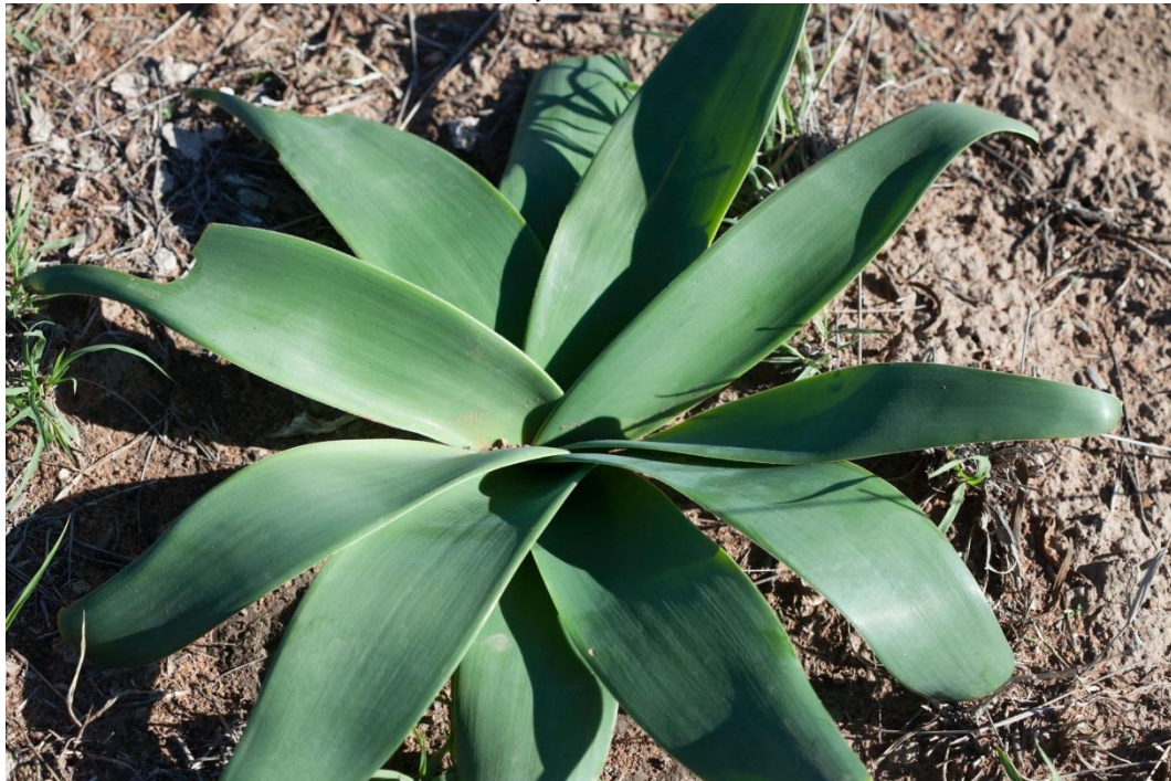
Photo 4 Ammocharis coranica , a widespread geophyte that is not exclusive to wetlands but favours slight depressions or flooded areas in landscape where water gathers after rainfall. Photo: January 2016, R.F. Terblanche.