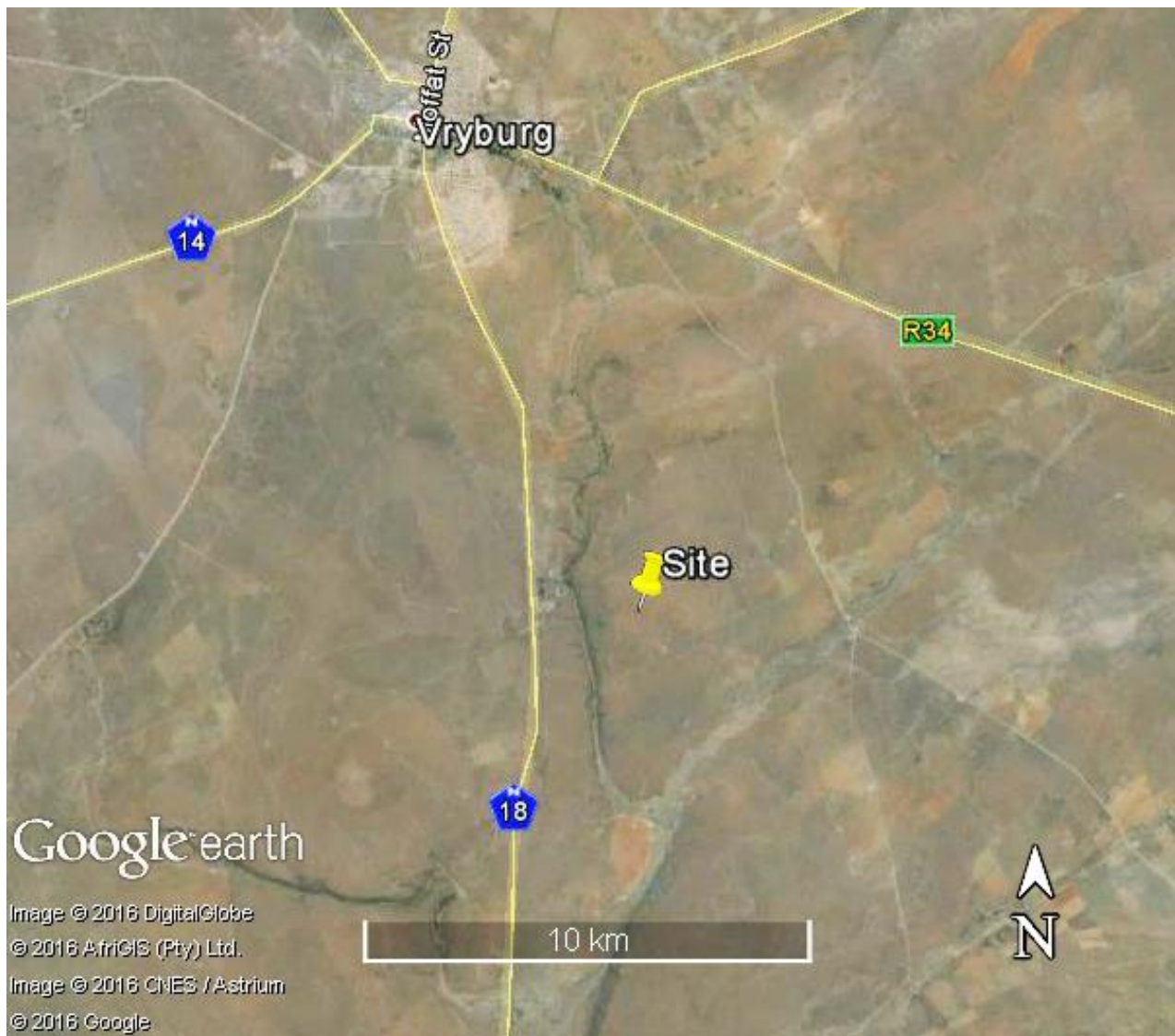
Figure 1 Location of the site in larger area.

The study area is at at Portion 5 (Shadow Eve) (Portion of Portion 4) of the Farm Champions Kloof 731, HN Registration Division, Province of the North-West, measuring 397.3009 (three hundred and ninety seven comma three zero zero nine) hectares, Title Deed No.: 1648/2012, 12 km south-southeast of Vryburg in the North West Province.