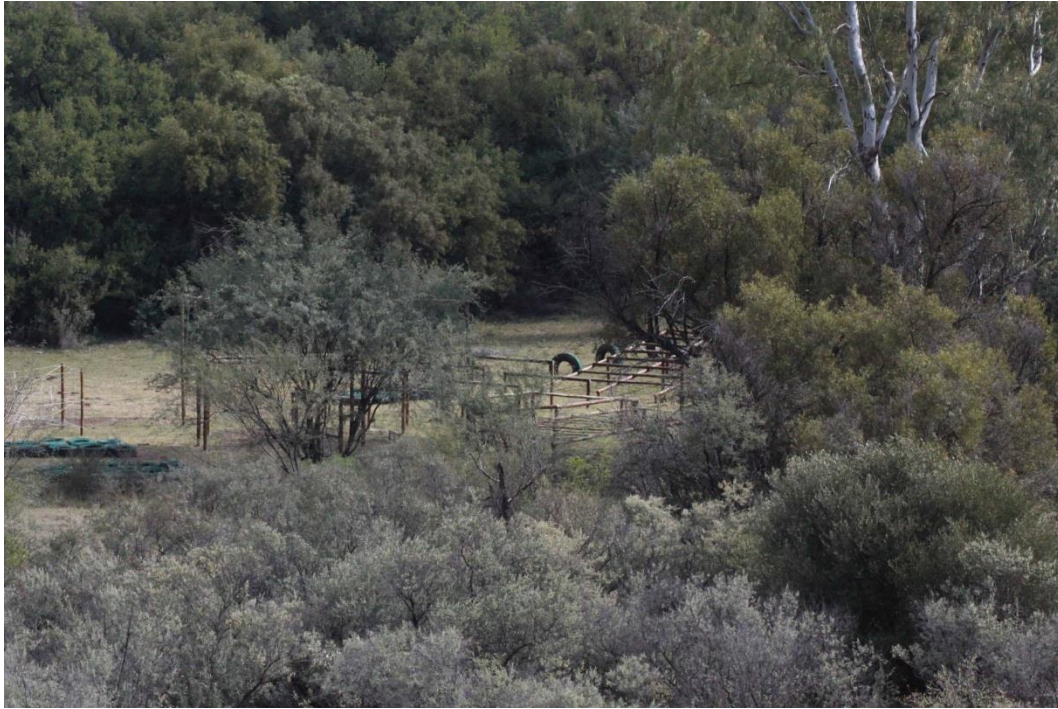
Photo 5 Ecologically disturbed riparian area where the proposed powerline crosses the Leeuspruit. Photo: May 2016, R.F. Terblanche.