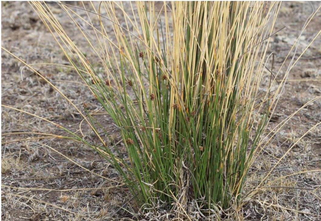
Photo 2 The sedge species, Scirpoides dioecus , at the shallow depression outside the proposed footprint in the study area. Photo: November 2015, R.F. Terblanche.