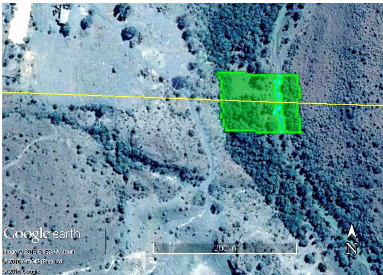
Figure 3 Indications of a non-perennial active channel and riparian zone where a proposed powerline crosses the Leeuspruit.

An active channel with a riparian zone is present where a proposed powerline crosses the Leeuspruit. There is a non-perennial active channel (streambed). Riparian of Leeuspruit in the area where the crossing of a powerline is proposed is highly disturbed with a visible high frequency of the alien invasive Prosopis glandulosa (Mesquite) at the banks of the active channel. Exotic Eucalyptus camaldulensis (Red River Gum) is also present at the riparian zone. Indigenous trees near and at the riparian zone include Vachellia karroo (Sweet Thorn) and Searsia lancea (Karee). Cynodon dactylon (Couch Grass) and the alien invasive Paspalum notatum (Bahia Grass) form mats at certain areas of the riparian zones in the area where the proposed powerline crosses. Large scale clearings and ecologically disturbed areas are present near and at the proposed powerline crossing near and at the Leeuspruit.