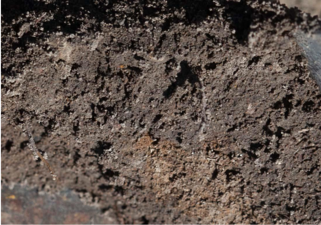
Photo 3 Soil sample at the pan depression. Slight mottling of the soil is visible. Photo: January 2016, R.F. Terblanche.