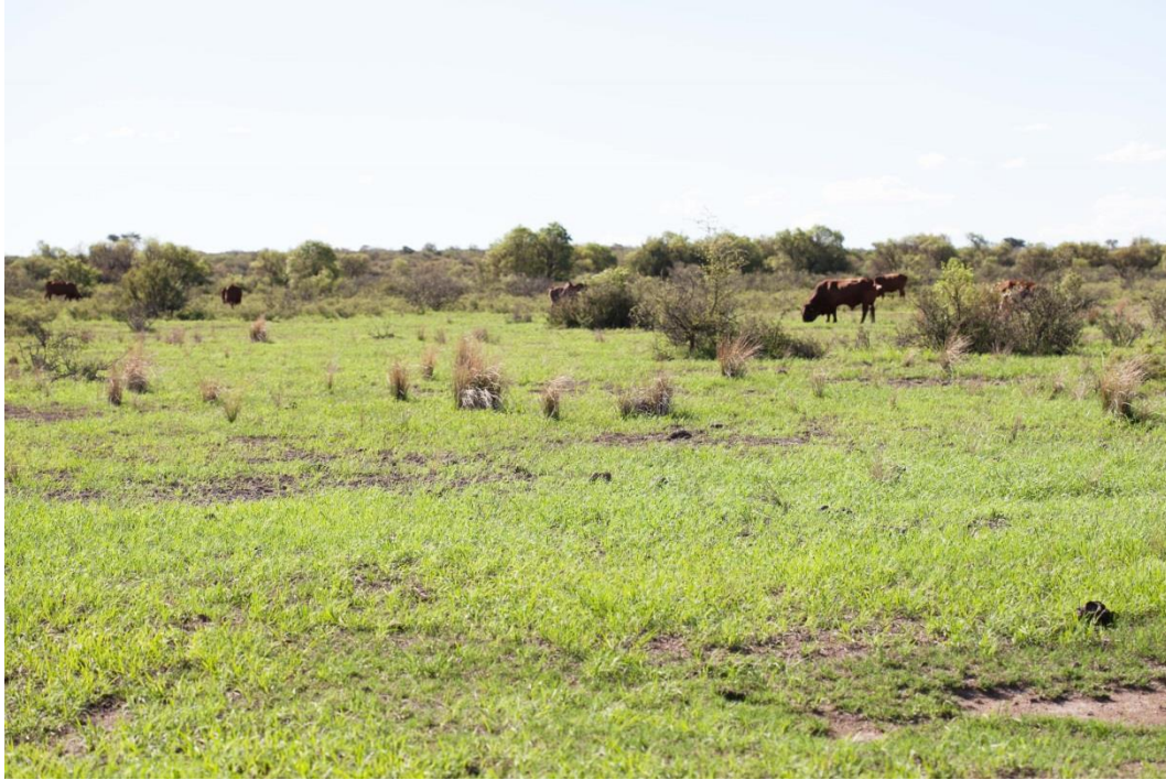
Photo 1 View towards the north of the small pan depression following substantial rainfall and sudden cover by grasses. Dispersed tufts in the image are those of the sedge Scirpoides dioecus . Photo: January 2016, R.F. Terblanche.