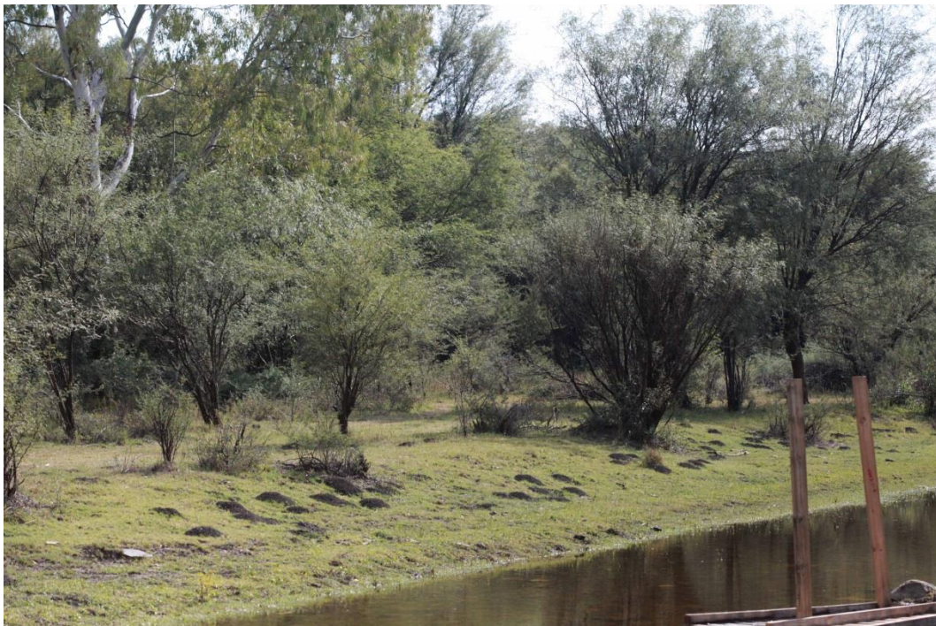
Photo 6 Ecologically disturbed vegetation at the banks of the Leeuspruit in the area where the proposed powerline will cross. Severe infestation of the alien invasive tree Prosopis glandulosa (Mesquite) occurs at this part of the site. Photo: May 2016, R.F. Terblanche.