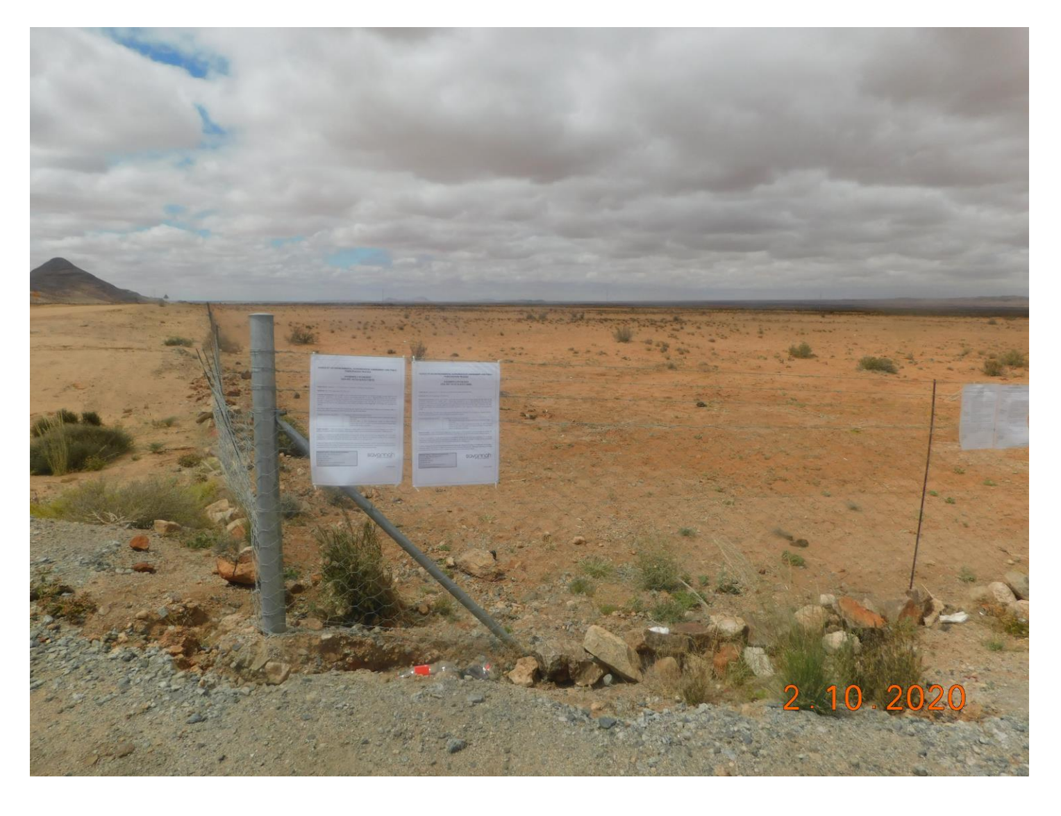
Figure 2: Site notice 1 placed at the entrance to the Farm Remaining Extent of Bloemhoek 61, Northern Cape (29° 7'31.81"S; 19°23'52.79"E)