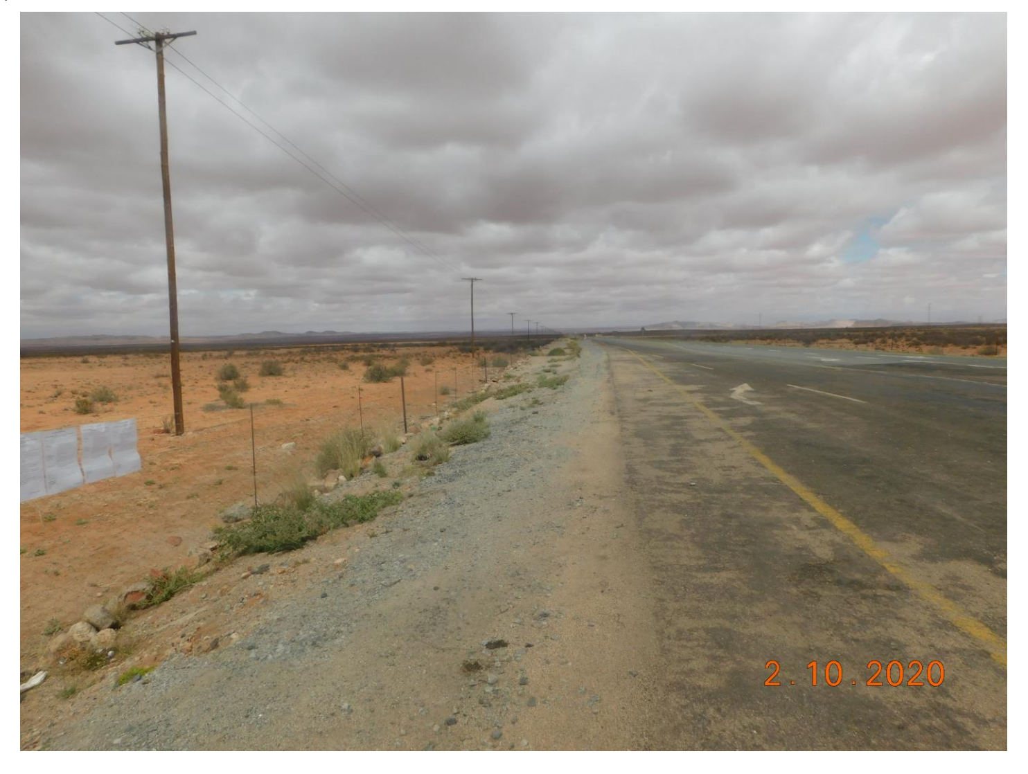
Figure 3: Site notice 2 placed along the N14 on the fence of the Farm Remaining Extent of Bloemhoek 61, Northern Cape (27°41'58.29"S; 23° 3'2.36"E)