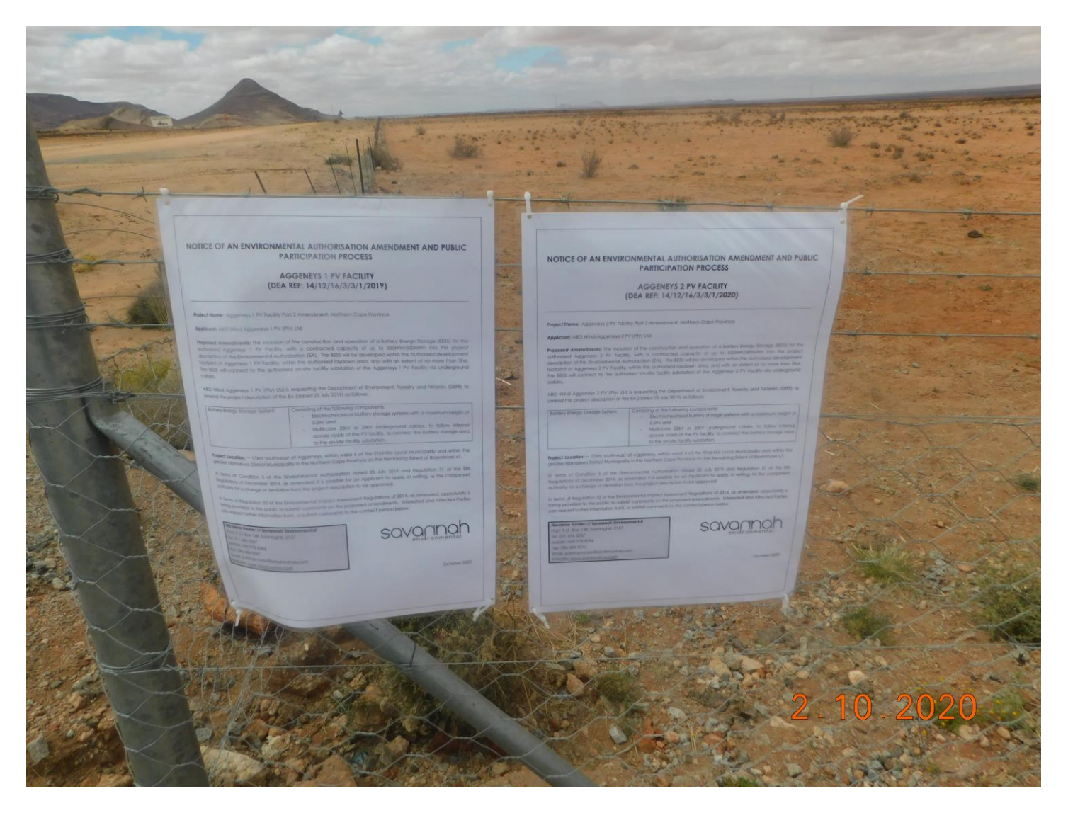
Figure 1: Site notice 1 placed at the entrance to the Farm Remaining Extent of Bloemhoek 61, Northern Cape (29° 7'31.81"S; 19°23'52.79"E)