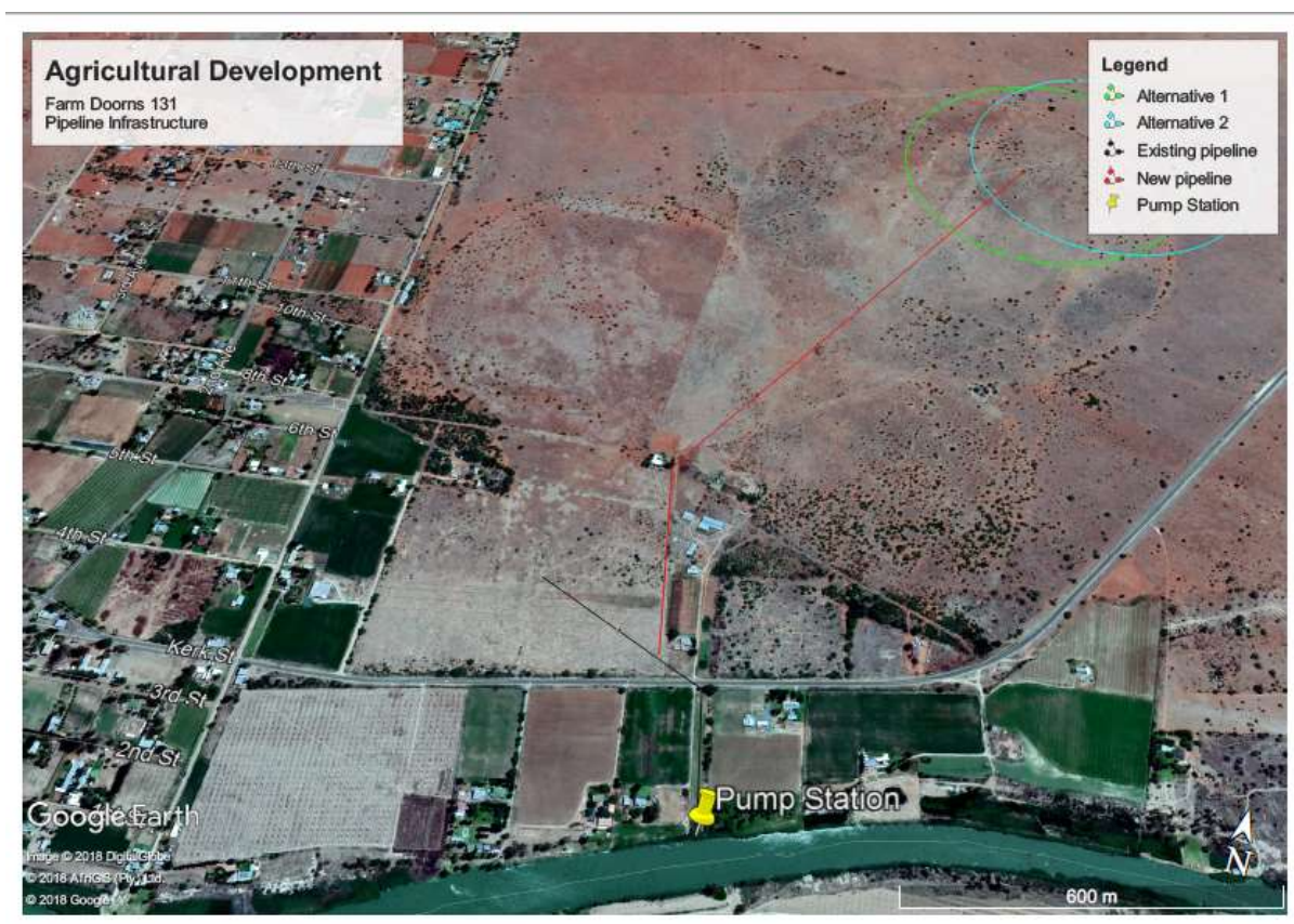
Figure 3: Existing and Newly Proposed Pipeline and Pump station Layout