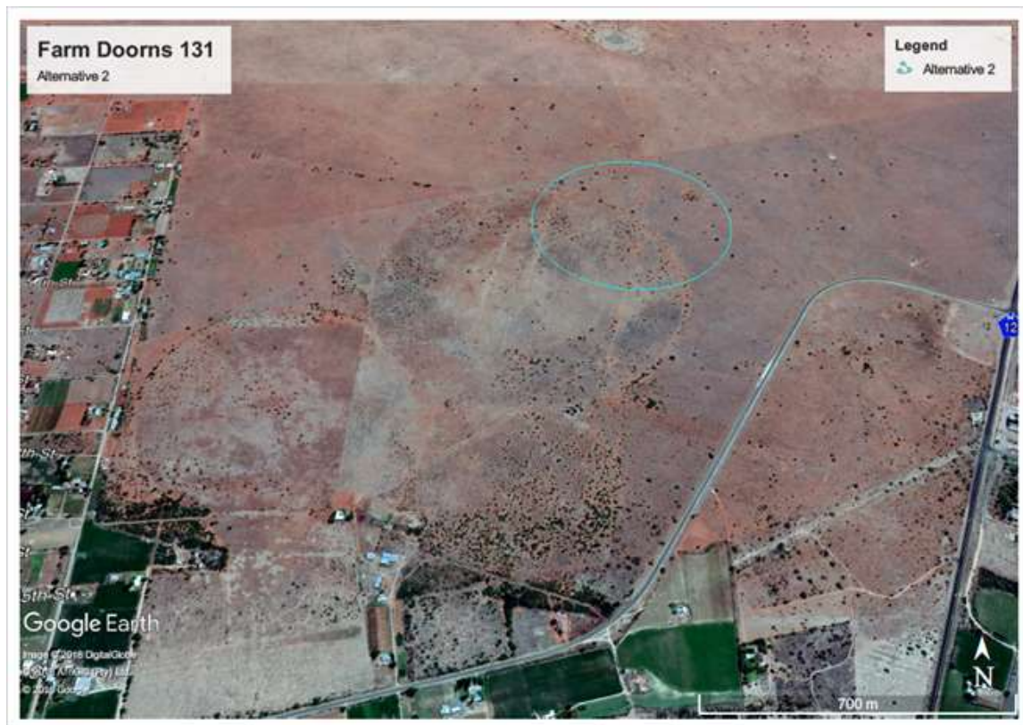
Figure 2: Doorns Alternative 2

Already established two track farm roads are already in place. In some cases, where tracks do not exist, some new two track farm road might be established.