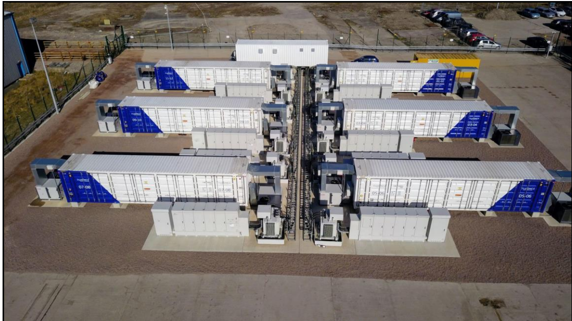
Figure 4: Aerial view of a BESS facility.