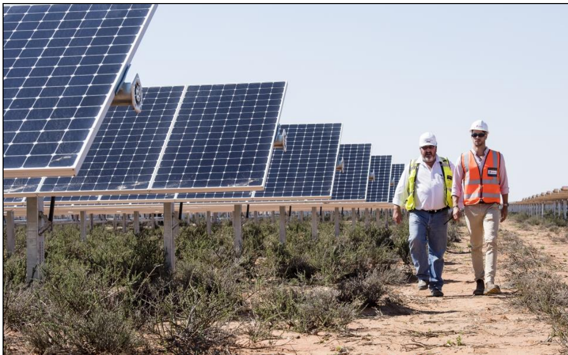
Figure 2: Photovoltaic (PV) solar panels. (Photo: SunPower Solar Power Plant – Prieska).

The proposed properties identified for the PV facility and associated infrastructure are indicated on the maps within this report. Sample images of similar PV technology and Battery Energy Storage System (BESS) facilities are provided below.