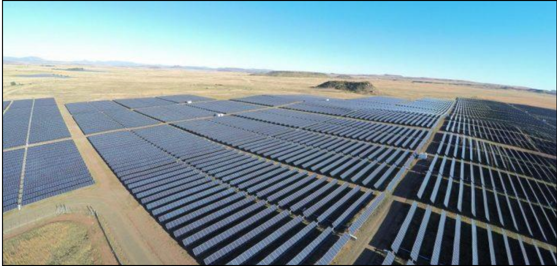
Figure 3: Aerial view of PV arrays. (Photo: Scatec Solar South Africa).