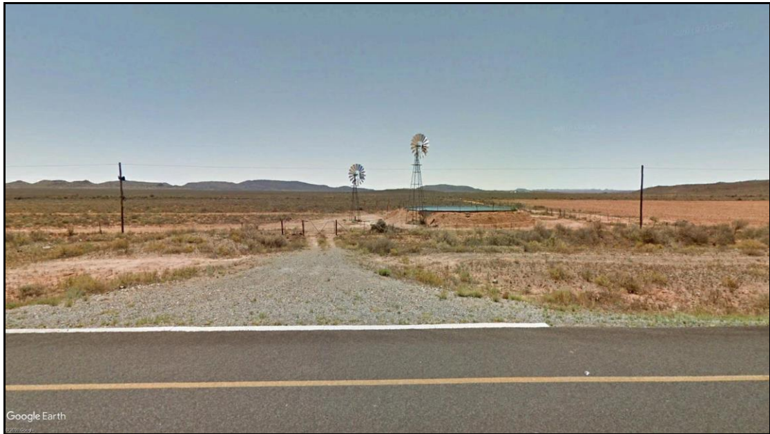
Figure 10: Typical Karoo scene.