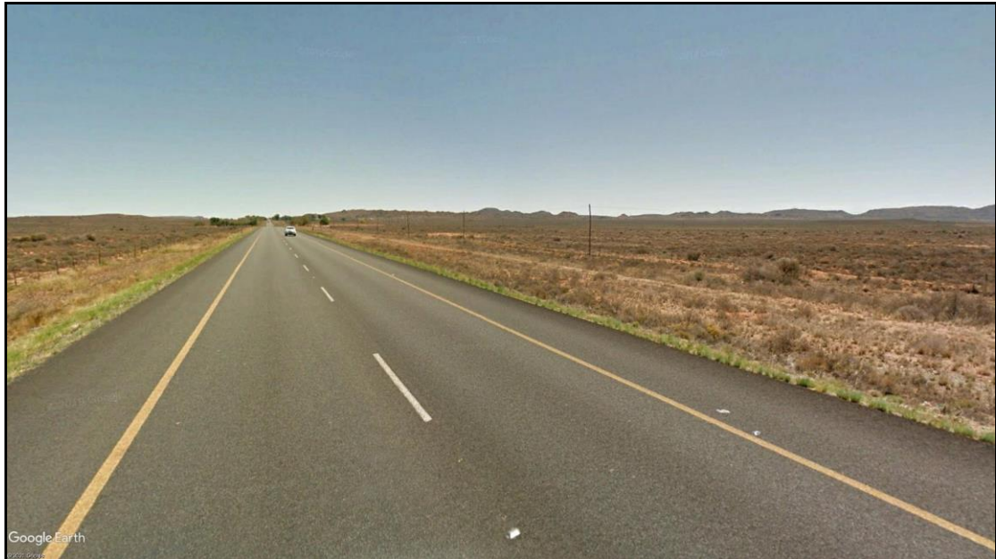
Figure 7: The N1 national road traversing the study area.

The photographs below aid in describing the general environment within the study area and surrounding the proposed project infrastructure.