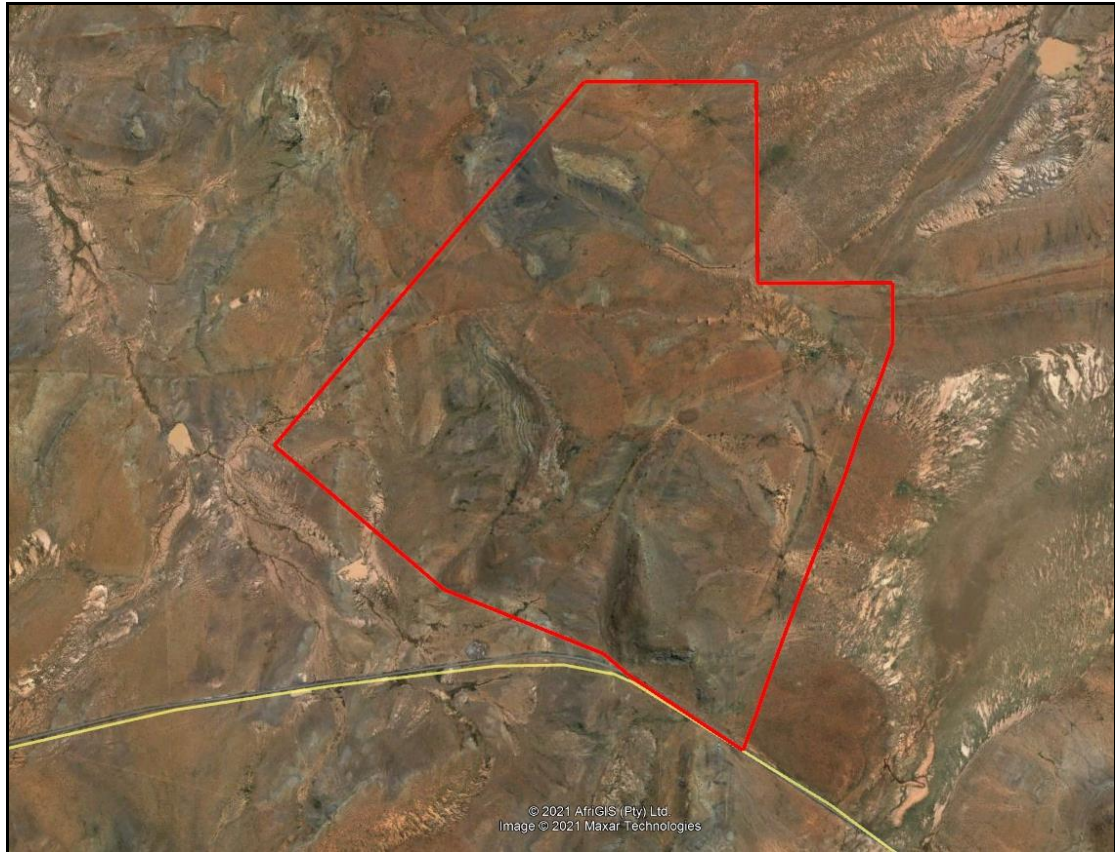
Figure 6: Aerial view of the proposed project site.