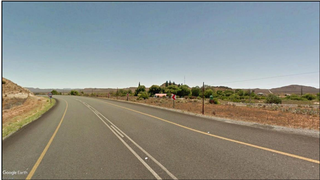
Figure 9: Typical Karoo homestead.