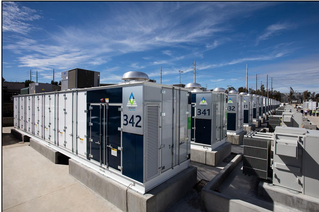
Figure 5: Close up view of a BESS facility.