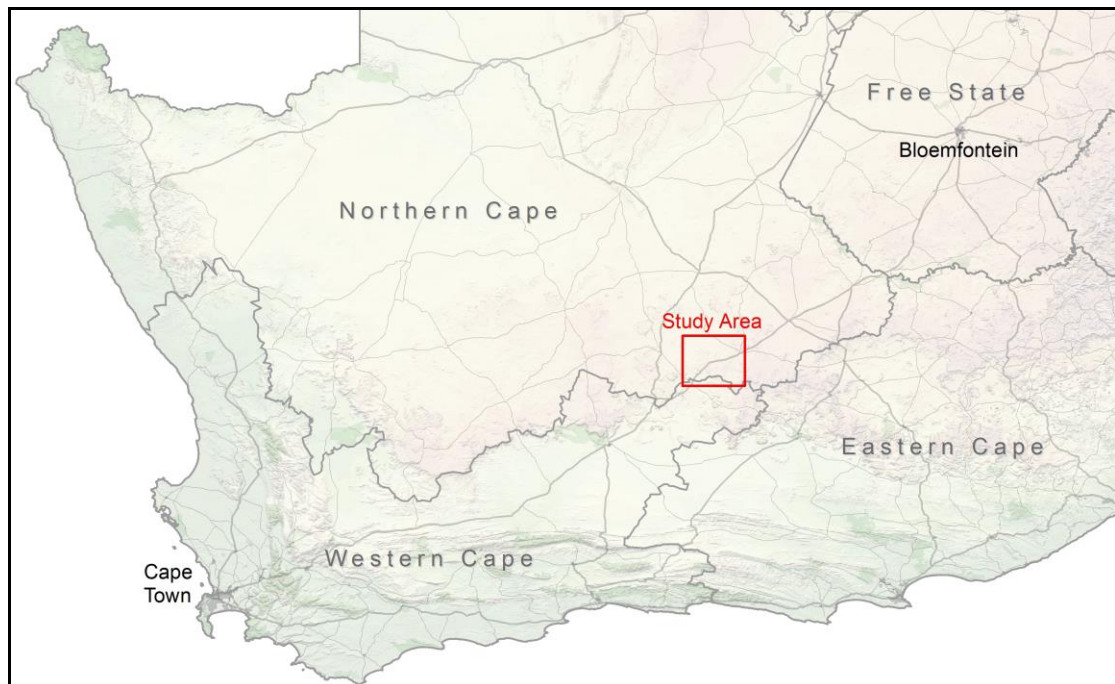
Figure 1: Regional locality of the study area.