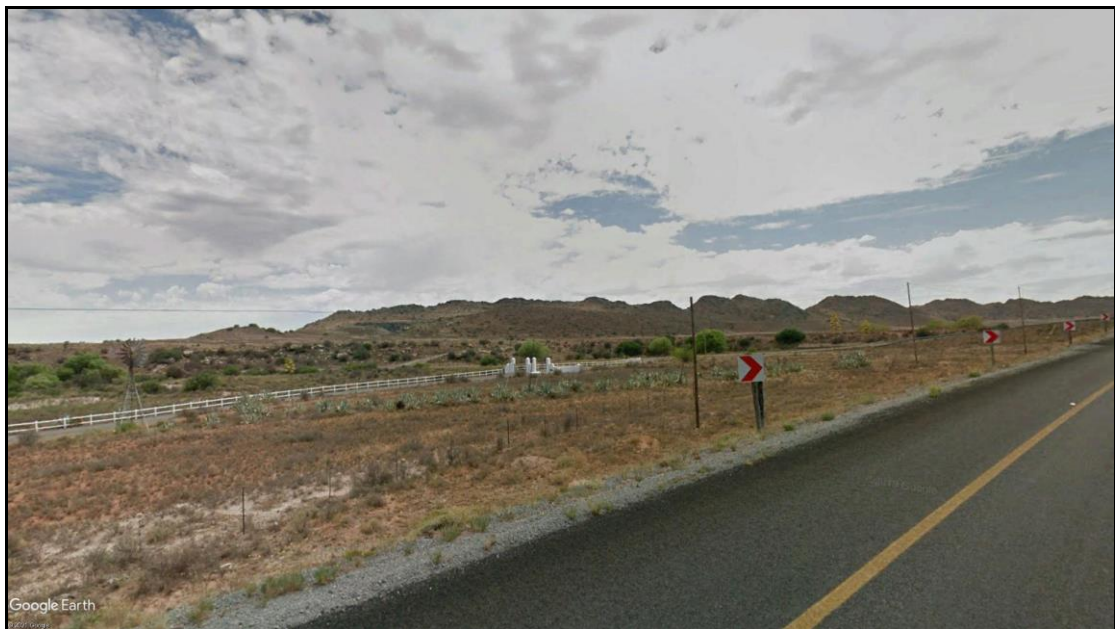
Figure 8: Ridges near the proposed development area.