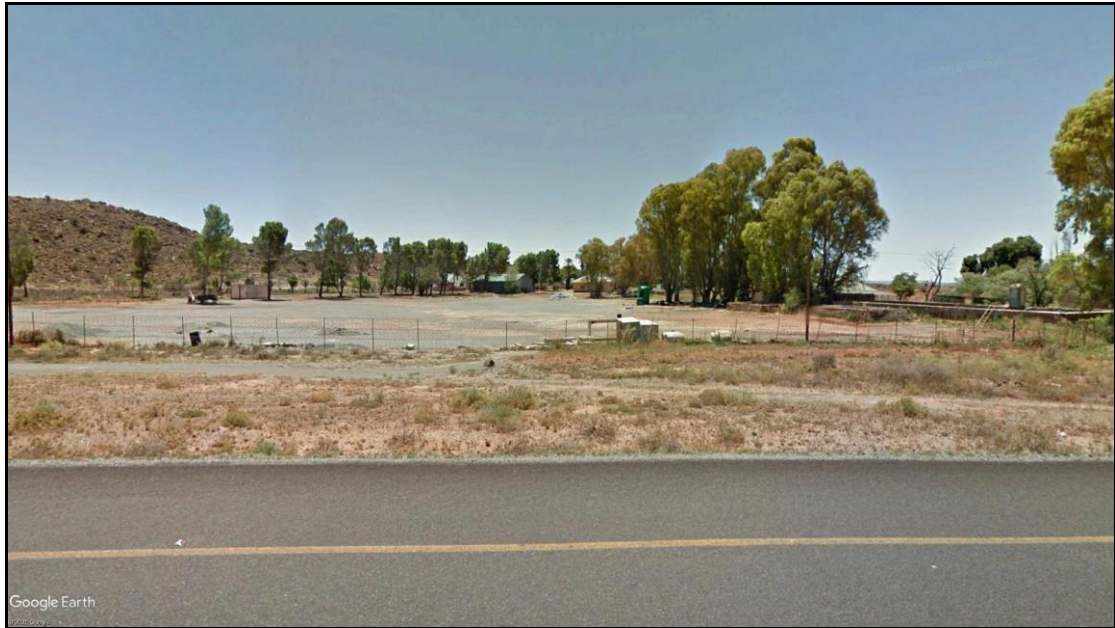
Figure 11: Planted vegetation at a homestead.