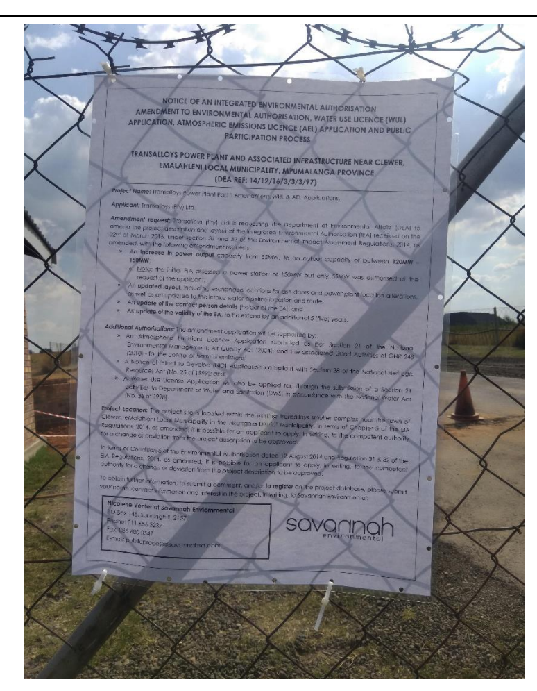
Figure 1: Site Notice placed at entrance gate to Transalloy

Co-ordinates: 25°53'26.94"S / 29° 7'39.85"E