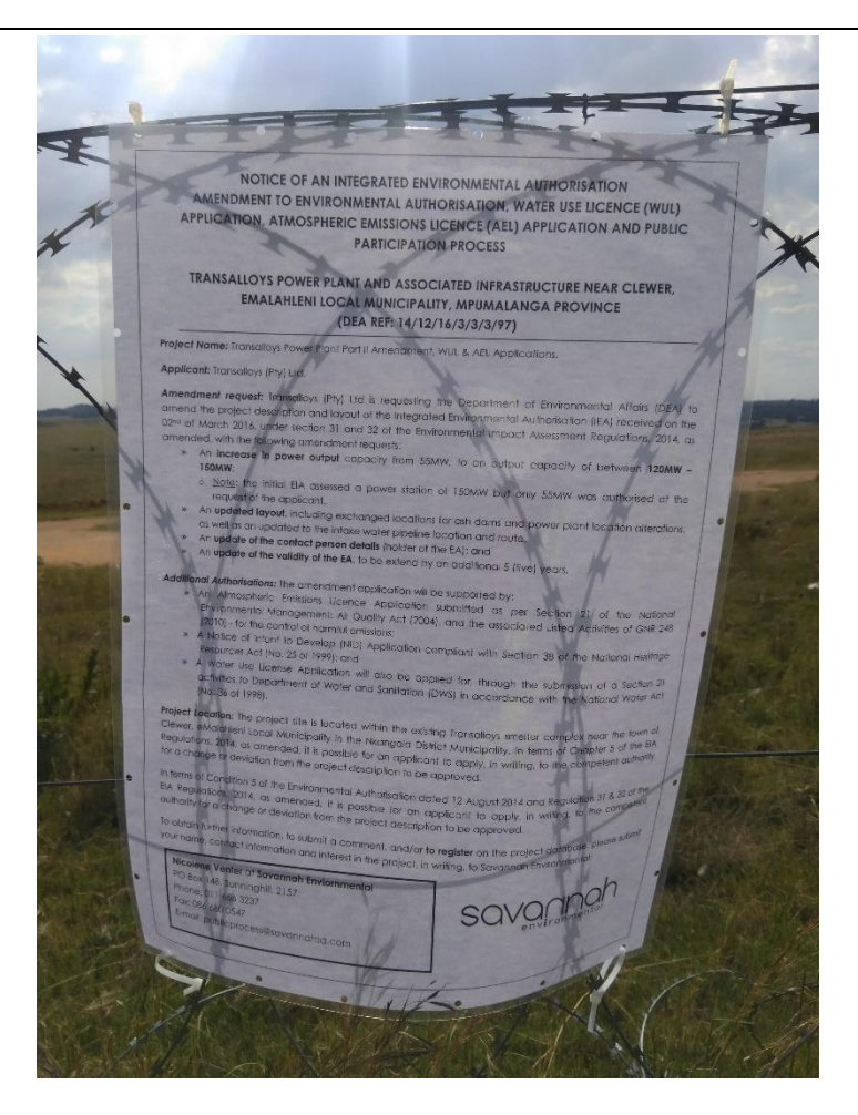
Figure 2: Site Notice placed along the R547 at turn-off to Transalloy - Co-ordinates: 25°53'22.68"S / 29° 8'6.05"E

Co-ordinates: 25°53'26.94"S / 29° 7'39.85"E