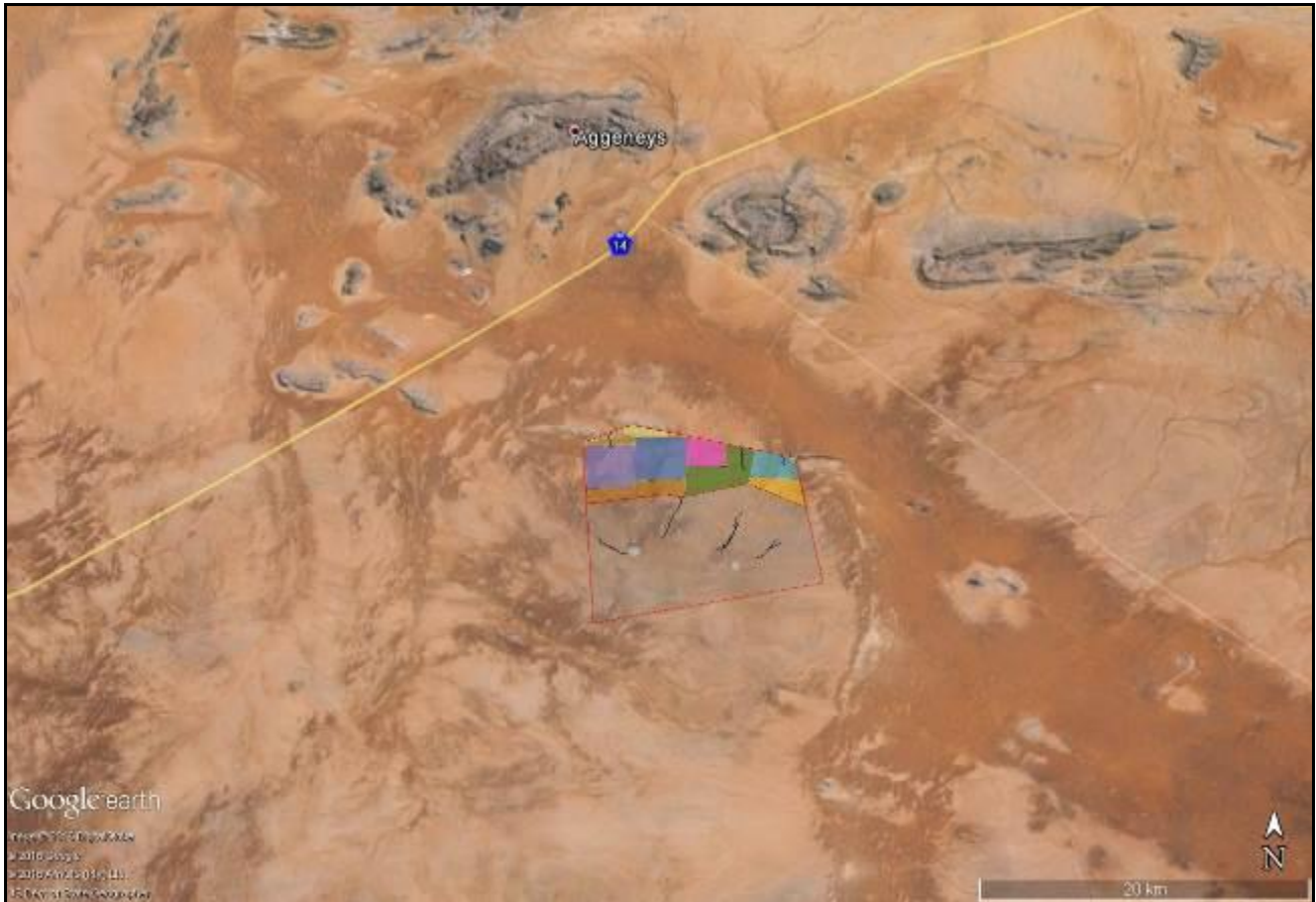
Figure 1: The location of the Solar CSP and PV facilities on the remainder of the farm Hartebeest Vlei 86, some 14 km south of the town of Aggeneys, on the N14 in the Northern Cape Province.

ACO Associates cc was appointed by WSP on behalf of BioTherm Energy (Pty) Ltd to undertake a Scoping assessment for the construction of two CSP (150MW each) solar power stations (Letsoai CSP project) and five PV (75MW each) solar facilities (Enamandla PV Project) and associated infrastructure on the Remainder of the Farm Hartebeest Vlei 86, some 14km south of the town of Aggeneys in the Khai-Ma Municipality, Northern Cape Province (Figure 1). This report only focuses on the Enamandla PV Site 5 (hereafter referred to as “Enamandla PV 5”).