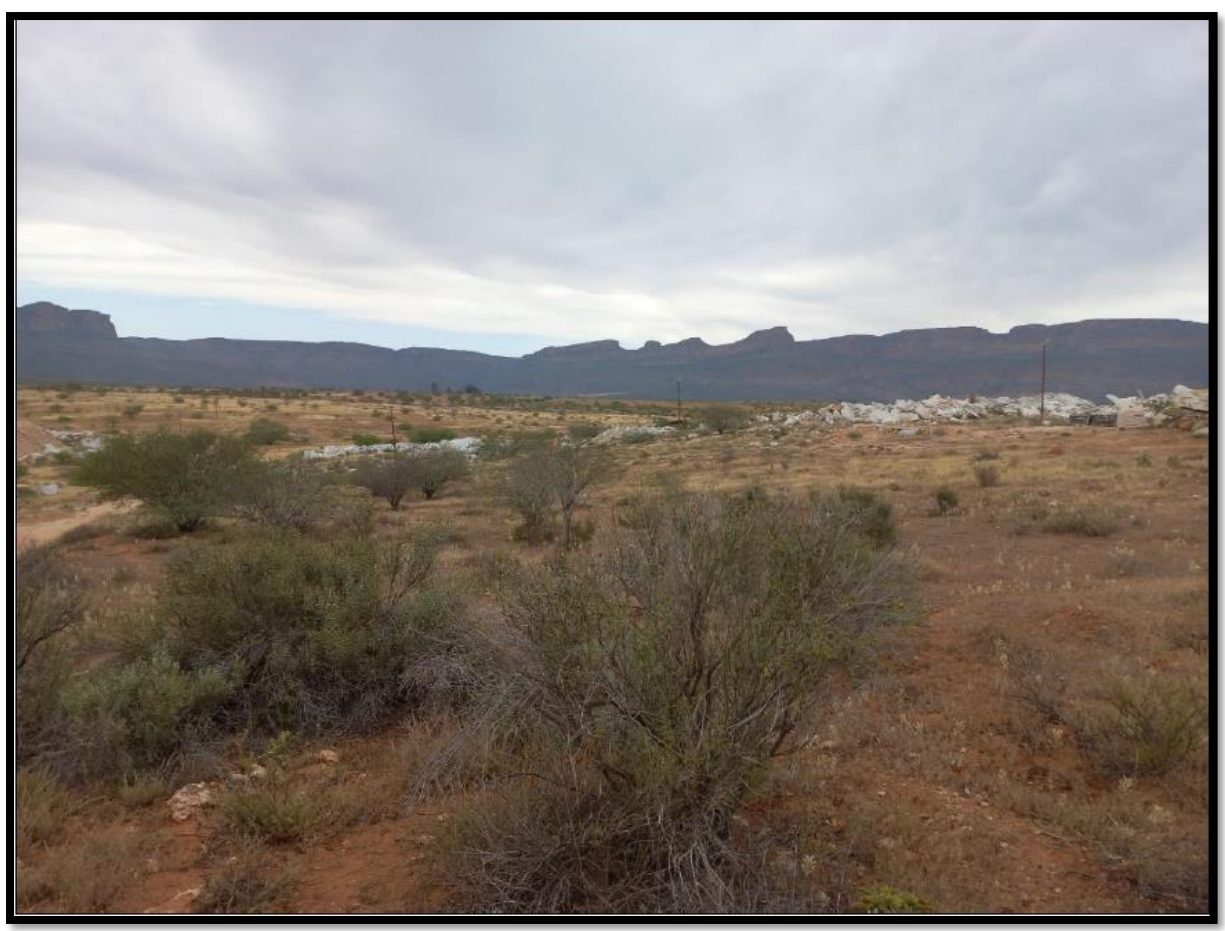
Figure 1: Visual representation of the vegetation inhabiting the Ecological Support Area in Alternative one) Information obtained from (Plant Species and Terrestrial Biodiversity Theme Compliance Statement dated October 2021 compiled by Enviroworks - Figure 9)