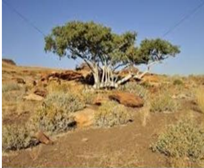
Figure 4: Boscia albitrunca

Vachellia erioloba (Camel thorn tree): This tree, also protected, is found in both the Olifantshoek Plains Thornveld and Postmasburg Thornveld but may also occur in sandy patches in the Kuruman Mountain Bushveld. It will also be impossible to relocate this species in the CSP plant area due to its extensive taproot system. The management of this species is the same for the general construction area and power line areas.