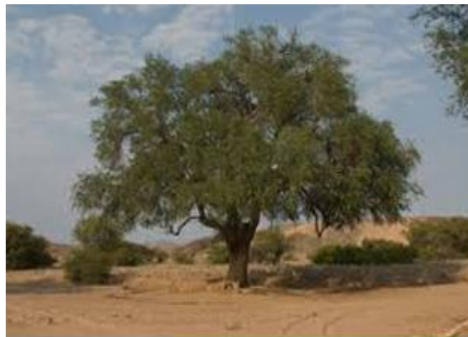
Figure 5: Vachellia erioloba

Vachellia erioloba (Camel thorn tree): This tree, also protected, is found in both the Olifantshoek Plains Thornveld and Postmasburg Thornveld but may also occur in sandy patches in the Kuruman Mountain Bushveld. It will also be impossible to relocate this species in the CSP plant area due to its extensive taproot system. The management of this species is the same for the general construction area and power line areas.