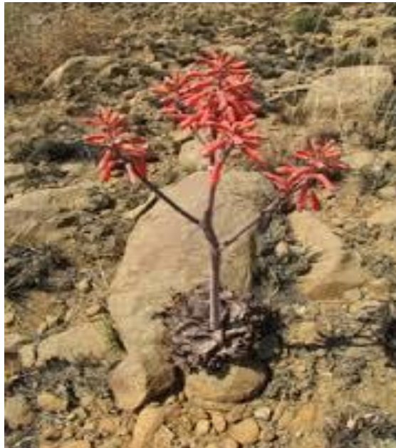
Figure 7: Aloe grandidentata

Aloe grandidentata : This succulent plant occurs widespread in the Northern Cape Province and while it is of least concern (Red Data List), it should be identified and relocated ahead of construction.