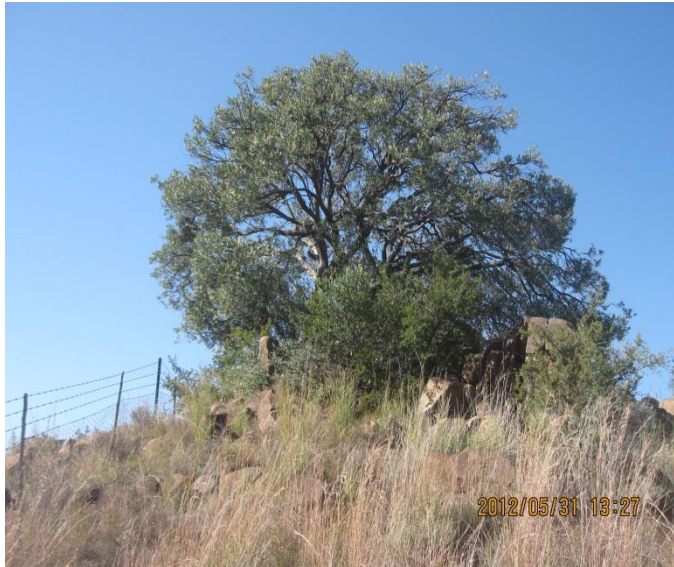
Figure 6: Olea europaea

Aloe grandidentata : This succulent plant occurs widespread in the Northern Cape Province and while it is of least concern (Red Data List), it should be identified and relocated ahead of construction.