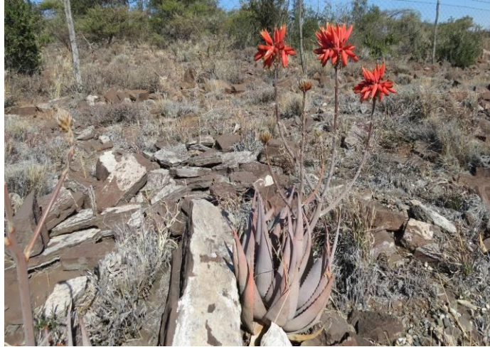
Figure 8: Aloe hereroensis