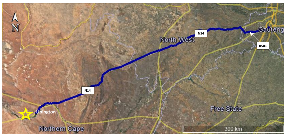
Figure 3-3: Haulage Route from Johannesburg Area to Site for Normal Loads

With the haulage distance being the minimal haulage distance to site, it is assumed that the inverter and support structure will be manufactured in the Johannesburg area and transported to site via road. The general route distance is around 820km and no road limitations are expected on this route for normal loads vehicles as it will mainly follow national and provincial roads. The haulage route is shown in the Figure 3-3 below.