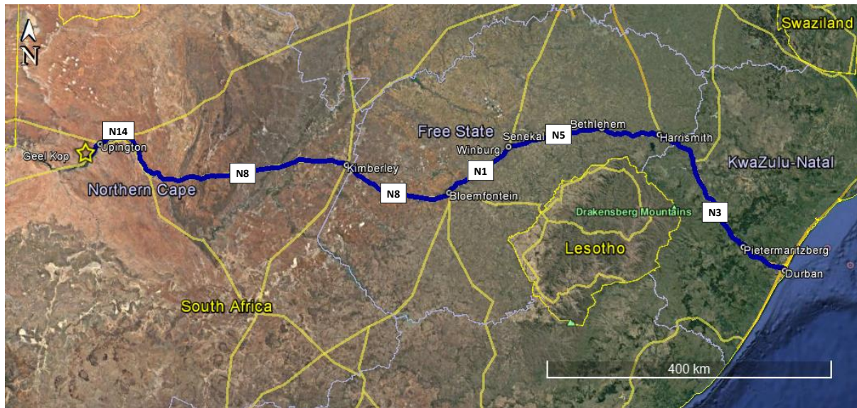
Figure 3-4: Haulage Route from Pinetown Area to Site

vehicles will mainly travel on national and provincial roads and the total distance is approximately 1 200km. This distance is however approximately 380km longer than the Johannesburg haulage route.