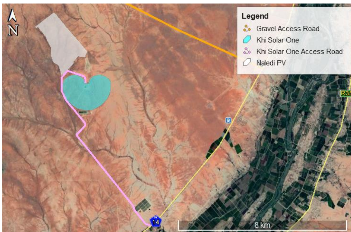
Figure 3-1: Aerial View of Proposed Naledi PV Development

A development area (located within the study area) with an extent of ~330ha has been identified by Naledi PV (Pty) Ltd as a technically suitable site for the development of a solar PV facility with a contracted capacity of up to 100MW. The development area for the Naledi solar PV facility is located within Portion 3 of the Farm McTaggarts Camp 453 and Portion 12 a portion of Portion 3 of the farm Klip Punt 452. The study area and the development area are located within Focus Area 7 of the Renewable Energy Development Zones (REDZ), which is known as the Upington REDZ, therefore, a Basic Assessment (BA) process will be undertaken and a BA Report compiled for the project in accordance with the EIA Regulations, 2014 (as amended), as well as GNR 114 as formally gazetted on 16 February 2018.