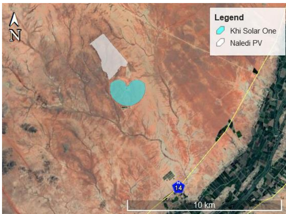
Figure 1-1: Naledi PV Development site

A separate BA process will be undertaken for the grid connection infrastructure required to connect Naledi PV to the existing Upington Main Transmission Substation (MTS).