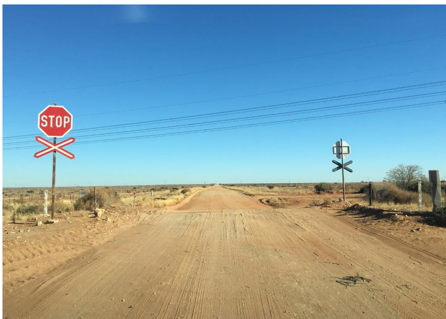
Figure 3-8: Railway crossing

The exact location and design of the internal access road needs to be established at detailed design stage. Existing structures and services such as drainage structures and pipelines will need to be evaluated if impacting on the access road.