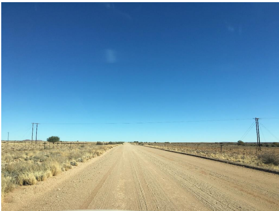
Figure 3-7: Existing Gravel Road (D3276)

The image below shows the existing gravel farm road, D3276 at the access point proposed for Naledi PV, which will need to be upgraded to cater for the construction vehicles navigating the road to the laydown areas on site. Generally, the road width at the access point needs to be a minimum of 6m and the access roads on site a minimum of 5m. The radius at the access point from D3276 and the N14 needs to be large enough to allow for all construction vehicles to turn safely. It is recommended that the access point shall be surfaced and the internal access roads on site can remain gravel.