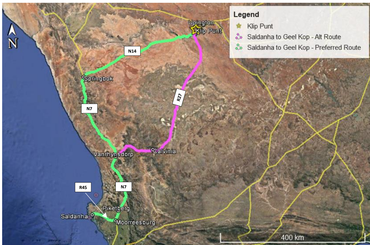
Figure 2-1: Haulage Routes (Port of Entry - Saldanha)

The Port of Saldanha is the largest and deepest natural port in the Southern Hemisphere able to accommodate vessels with a draft of up to 21.5m. The port covers a land and sea surface area of just over 19,300 hectares within a circumference of 91km with maximum water depths of 23.7m. Unique to the port is a purpose-built rail link directly connected to a jetty bulk loading facility for the shipment of iron ore. The Port is operated by Transnet National Ports Authority.