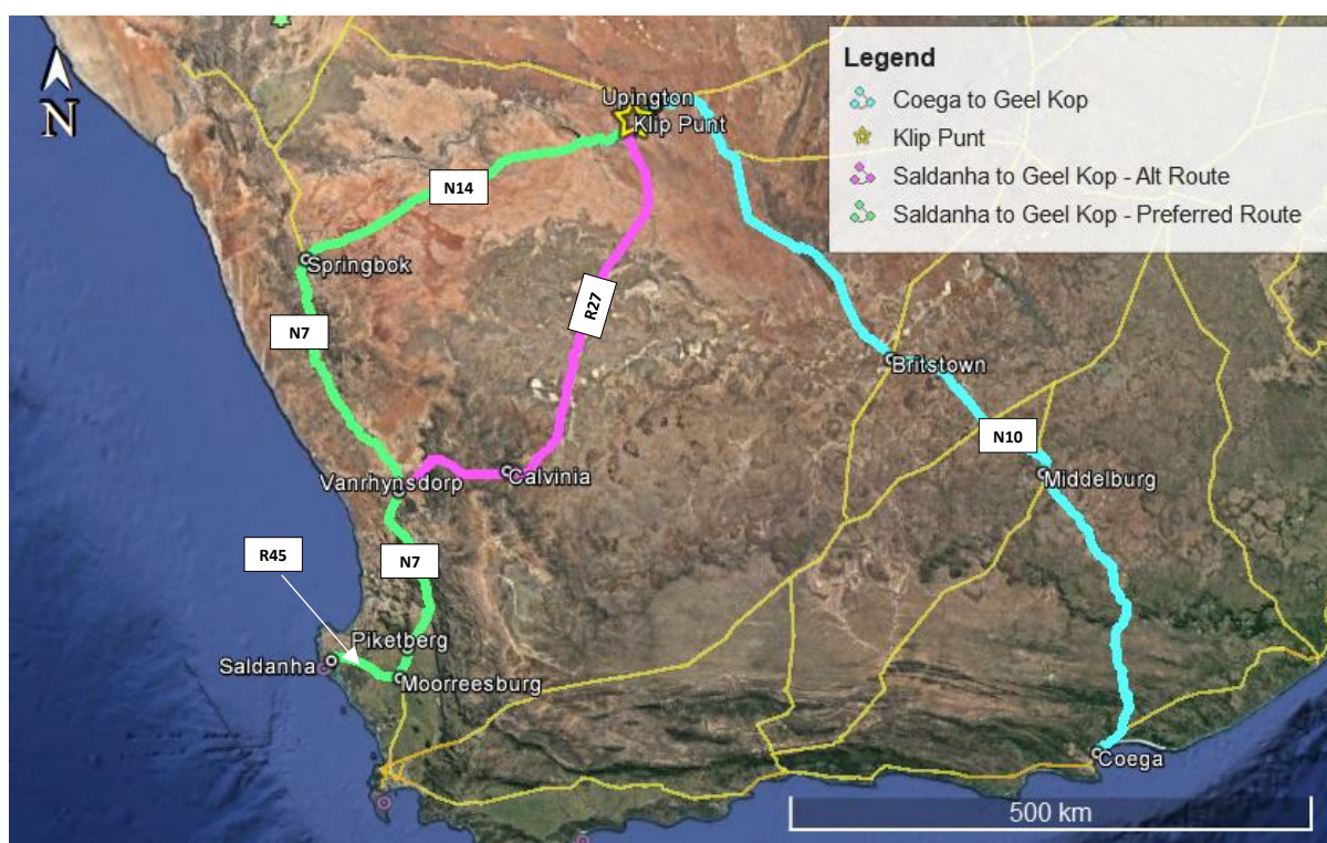
Figure 3-2: Haulage Routes

An alternative route from the Port of Ngqura, shown in blue in the Figure below, is approximately 930km in length and follows the N10 in a northwest direction en route towards Upington. The route passes Upington onto the N14 and heads west along the N14 to the proposed site.