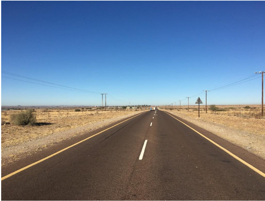
Figure 3-6: N14

The image below shows the existing gravel farm road, D3276 at the access point proposed for Naledi PV, which will need to be upgraded to cater for the construction vehicles navigating the road to the laydown areas on site. Generally, the road width at the access point needs to be a minimum of 6m and the access roads on site a minimum of 5m. The radius at the access point from D3276 and the N14 needs to be large enough to allow for all construction vehicles to turn safely. It is recommended that the access point shall be surfaced and the internal access roads on site can remain gravel.