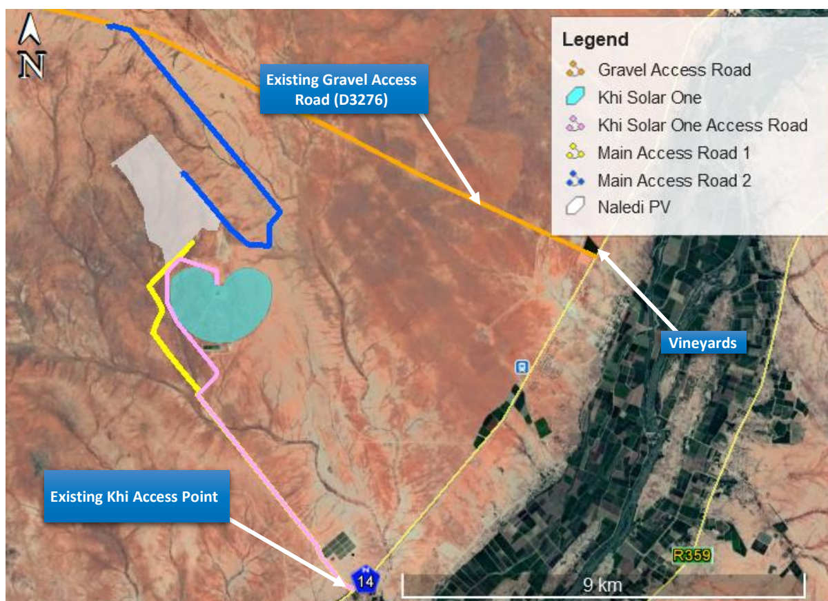
Figure 3-5: Proposed Access Road Alternatives

The Khi access road, however, is not considered to be a viable option due to its close proximity to the operational Khi Solar One solar power plant.