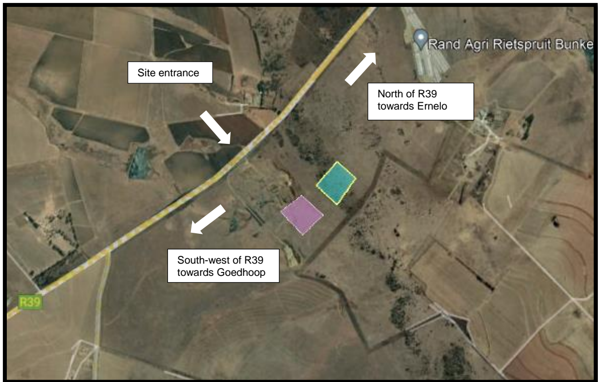
Figure 1: Satellite view showing the access road entrance (white arrow) to the proposed mining area site alternative 1 (blue polygon) as well as site alternative 2 (pink polygon).