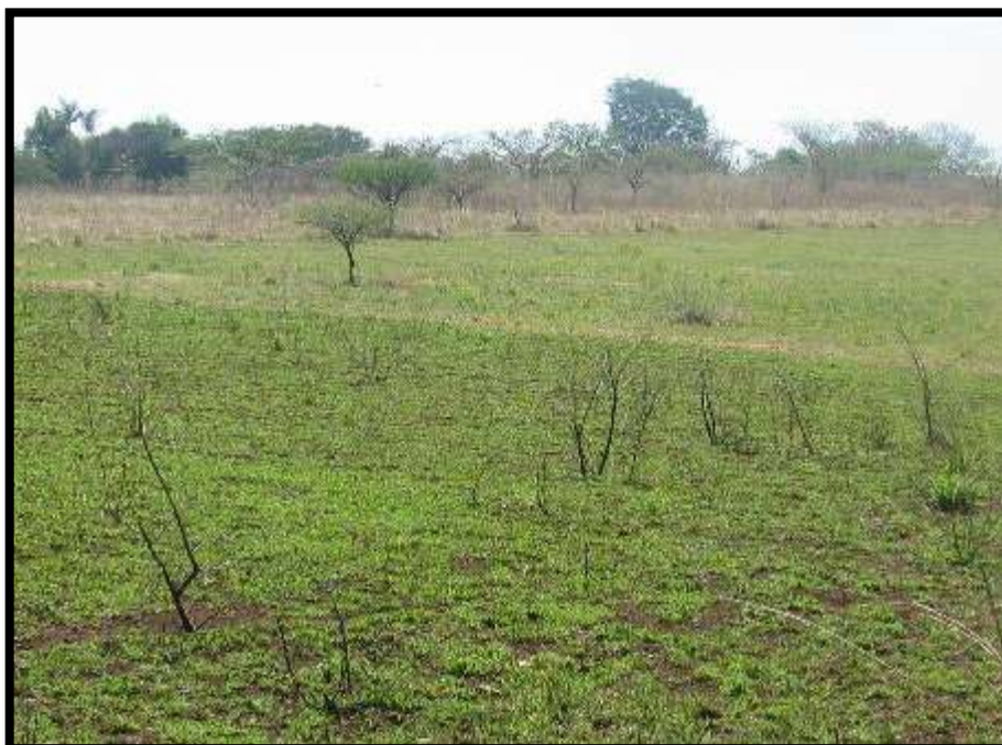
Figure 5. Southern section of the proposed road extension.