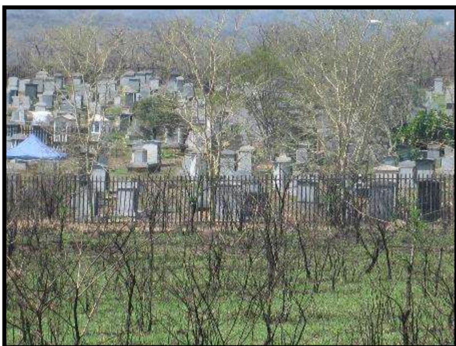
Figure 6. The Ethembeni Cemetery is situated approximately 150m from the proposed road extension at S 29° 37' 28.41" E 30° 26' 50.75".