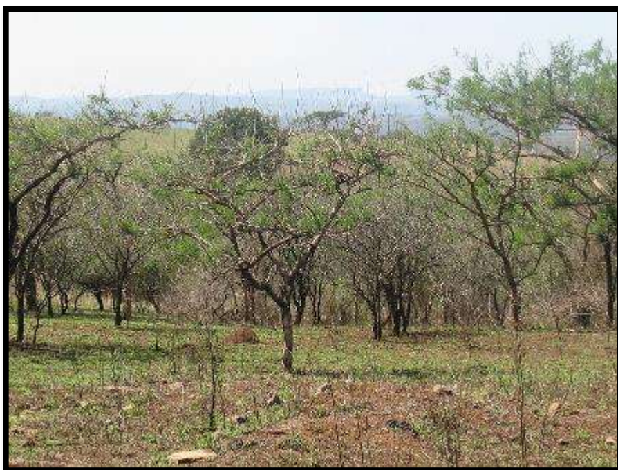
Figure 4. Central section of the proposed road extension.