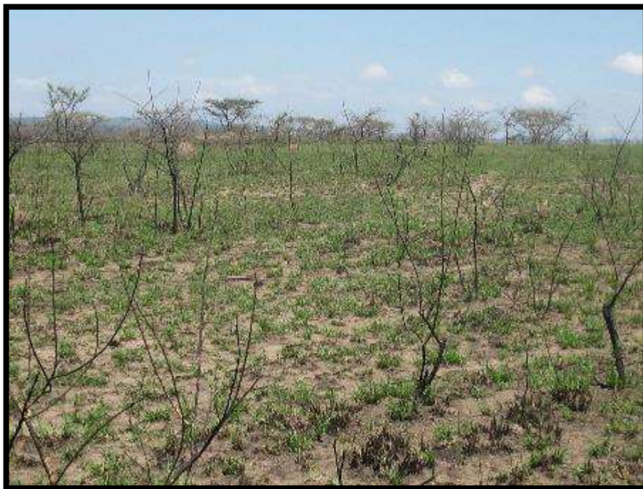
Figure 3. Northern section of the proposed road extension.