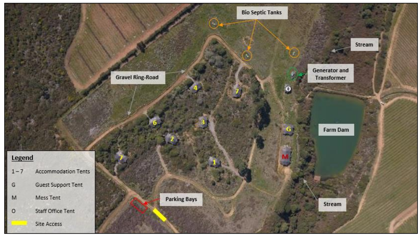
Figure 2: Aerial View of Site