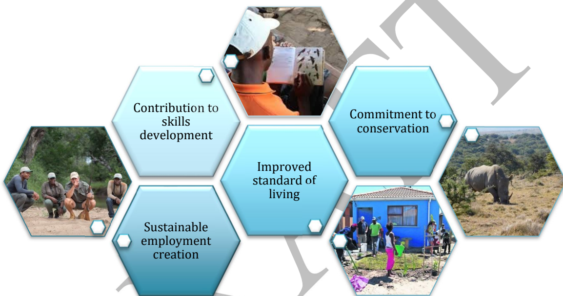
Figure 1: Commitment to Community Enrichment Principles

Wind Energy Facilities, like any development, provide for an opportunity to enrich the communities in which the WEF are to be located. This section of the report considers selected socio-economic and conservation-related enrichment principles that guide the conceptualisation of the proposed conservation framework. The principles are diagrammatically presented in Figure 1.