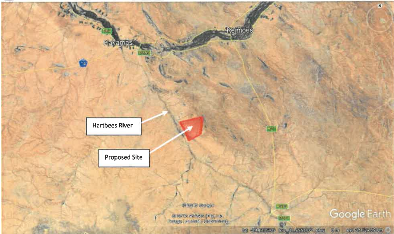
Figure 2: Proposed area/farm for the proposed development site applications on Portion 5 of Rozyne Bosch Farm No. 104, Kakamas, showing the Hartbees river to the west of the proposed development site, as well as immediate land uses (mainly agricultural)