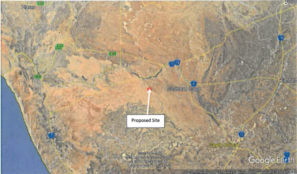
Figure 1: Proposed farm area/site for the proposed development applications on Portion 5 of Rozyne Bosch Farm No. 104, Kakamas, approximately 40,66km south-east of Kakamas town.