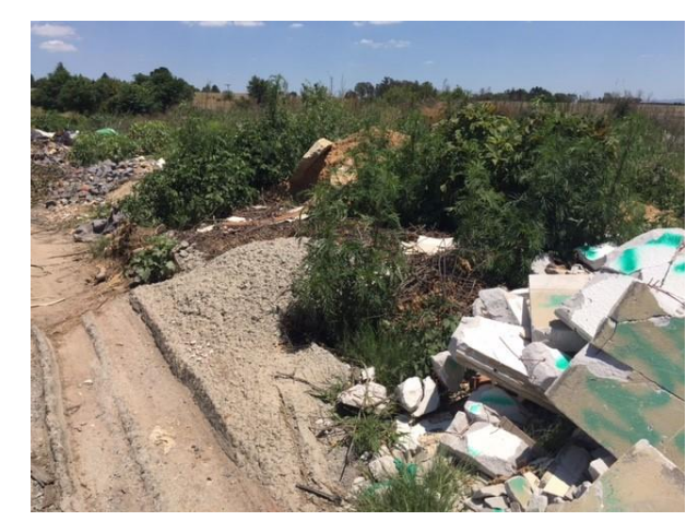
the upper reaches of the wetland