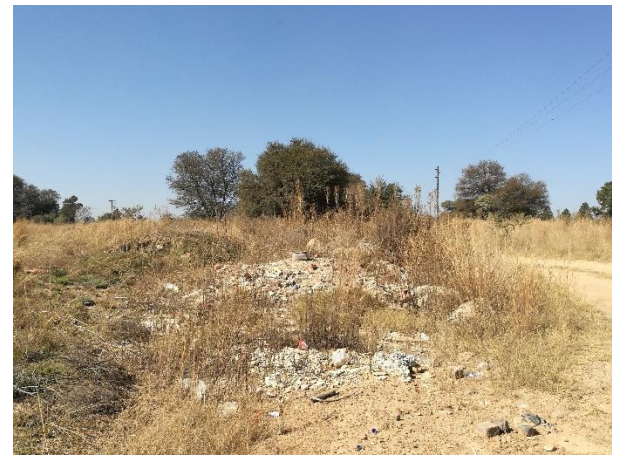
Illegal dumping occurring at the middle of the site, on the opposite side of Mnandi Road (water tower side).