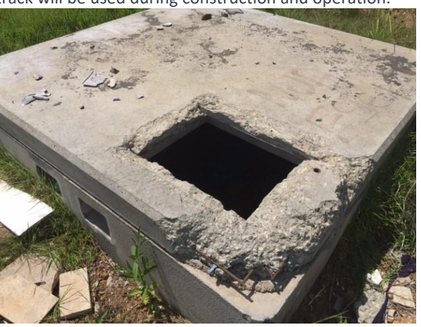
Illegal dumping occurring at the middle of the site, at A man-hole occurring at the upper reaches of the A man-hole occurring at the upper reaches of the wetland