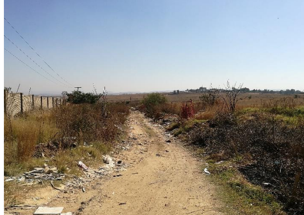
A rural road running parallel to the R562 (summit Road) which crosses the upper reaches of the wetland. The pipeline will run parallel with this road, and this existing track will be used during construction and operation.