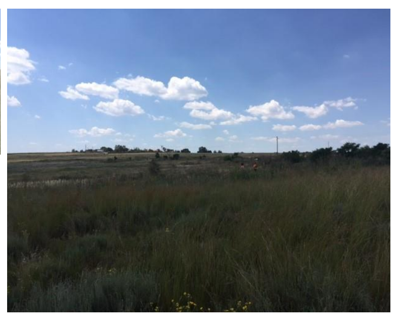
The lower reaches of the wetland, evidence of clean-up activities can be seen