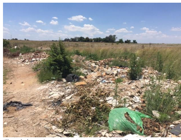
Illegal dumping occurring at the middle of the site, at the upper reaches of the wetland