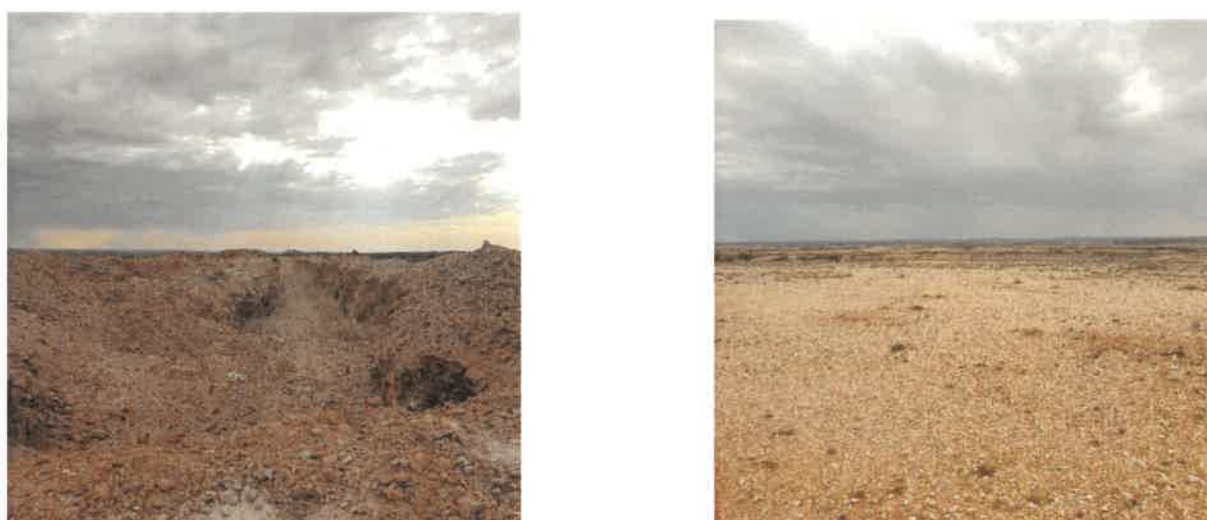
Figure 3: (Left) Mining site 1a partially excavated and requiring rehabilitation and (Right) mining site 1b Picture taken looking towards the north west.

The total development footprint comprises two actual mining sites viz. Site 1a covering an area of 3.43ha which already has a partial excavation in need of rehabilitation, and Site 1b covering an area of 1.19ha ( as per Figure 3 below), as well as a small processing plant to be established adjacent to existing ablution buildings and an existing shed (as per Figure 4 below). The processing plant, to be established adjacent to existing structures, covers an area of 0.1ha (as per Appendix B and C attached). The total footprint of the proposed development is, therefore, less than 5ha (i.e. 4.72ha).