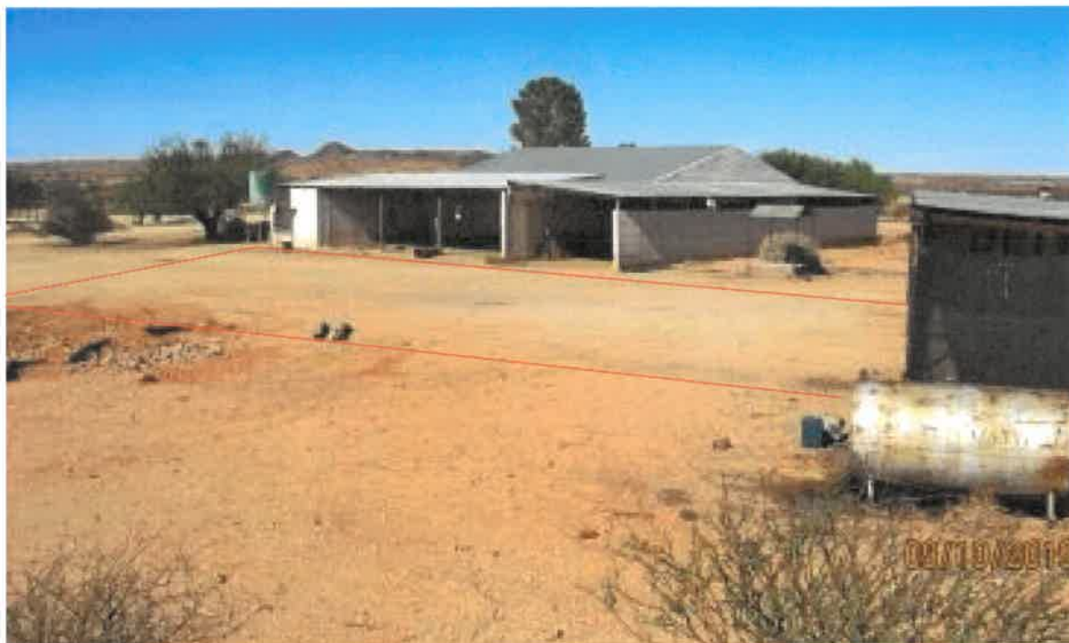
Figure 4: Looking from north-north-east, to south-south-east over the disturbed/brownfields site where the processing plant will be located (processing plant footprint outlined in red).

The processing plant for crushing and screening of excavated material will be established close to the existing main access road to Portion 5 of Rozynen Bosch Farm No. 104, on disturbed land and adjacent to existing buildings and ablutions. It is planned that the crusher plant will be relocated to this brownfields area and will be positioned between existing buildings and storage structures as per Figure 4 below.