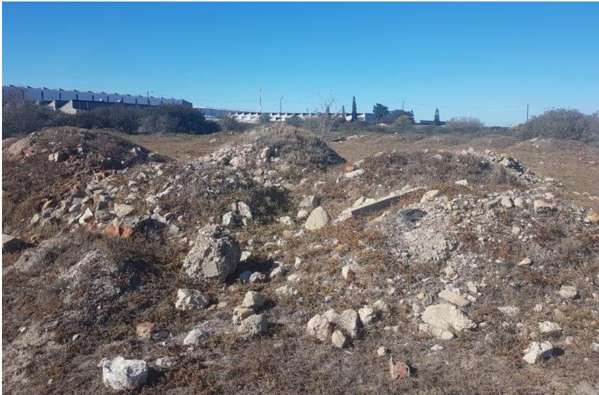
Photograph 25: Rubble and building waste observed on the vacant undeveloped land situated south of the fence which runs from east to west.