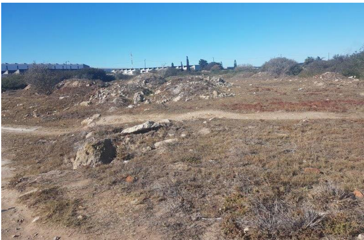
Photograph 26: Illegal dumping, human and livestock disturbance have degraded the natural vegetation likely to occur in this area.