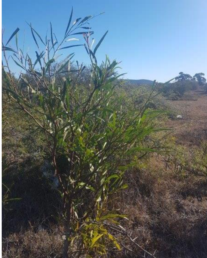
Photograph 28: During the site inspection some alien species were noted such as Port Jackson.