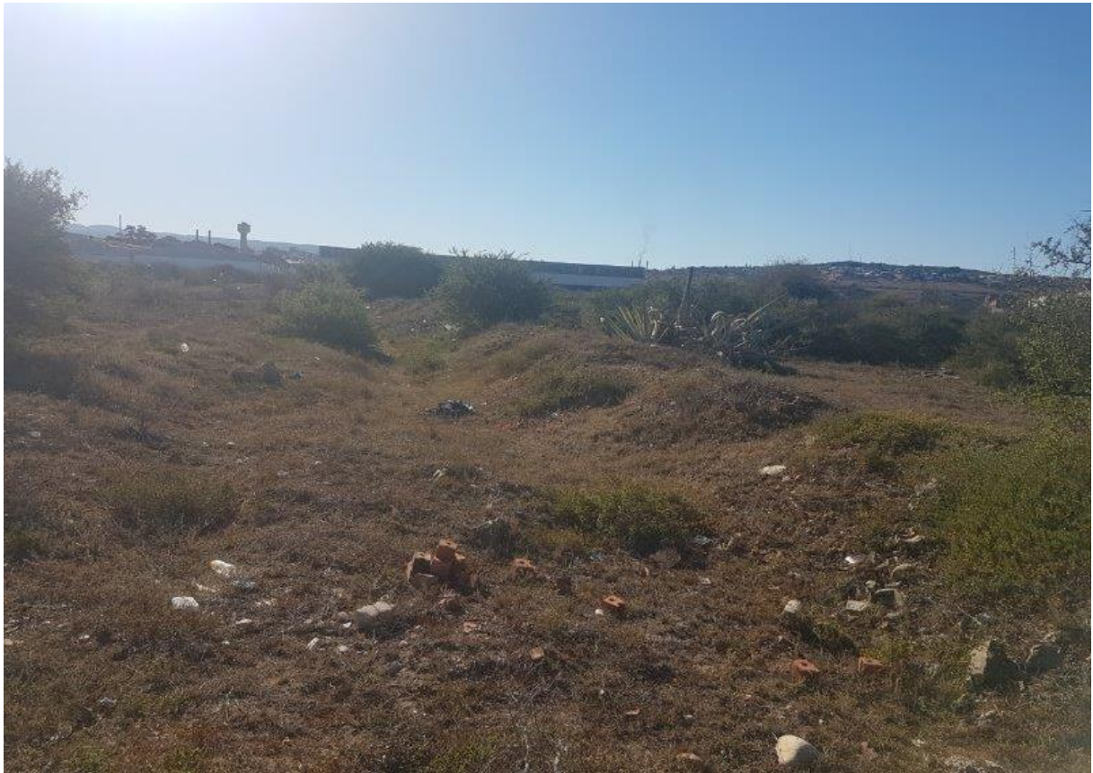
Photograph 29: A trench which runs from the fence line all the way to Kelvin Street, is evident on the western boundary of the undeveloped vacant property.