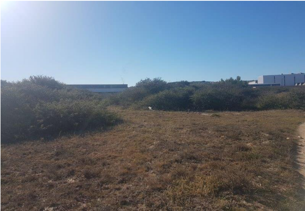
Photograph 27: The property lies in the general area that supports Albany Alluvial Vegetation which is classified as endangered according to the new vegetation map of South Africa (Mucina & Rutherford 2006).