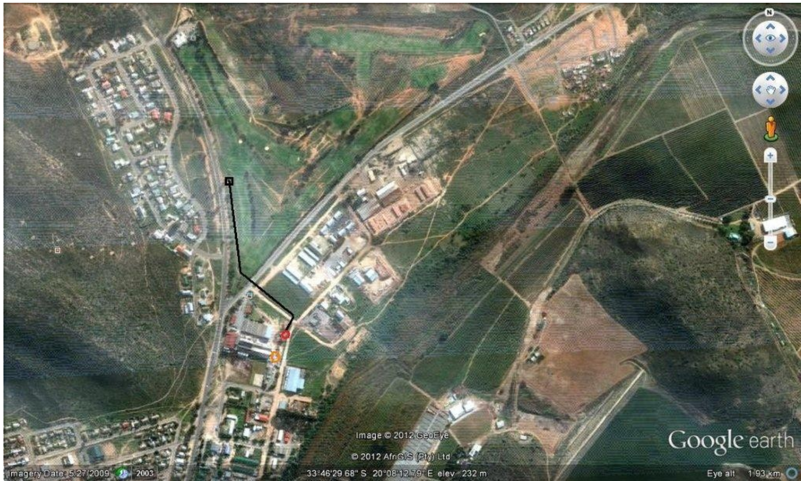
— Proposed pipeline from Montagu Cellar WWTW to Golf Course (to connect to current water supply system from Cogmanskloof Irrigation Board).