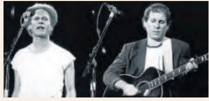
LEAVE YOUR TROUBLES BEHIND: Simon and Garfunkel is a popular choice for patients

A PHARMACY in the UK is advising customers seeking pain relief to listen to music after a study found it can ease their symptoms.