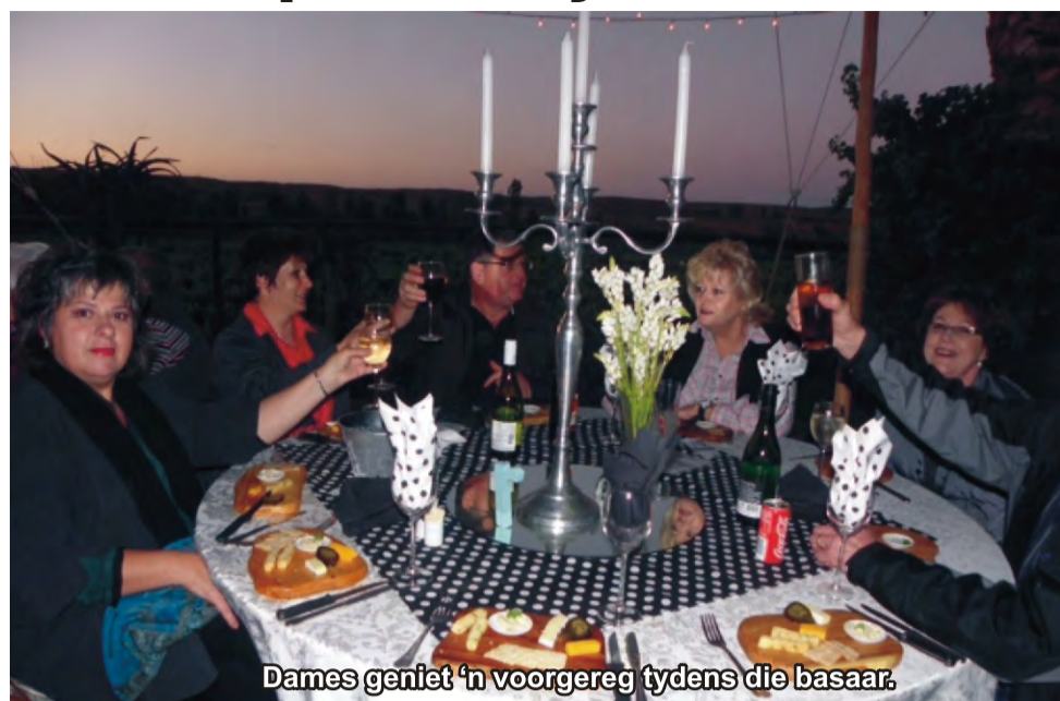
Dames geniet 'n voorgereg tydens die basaar.