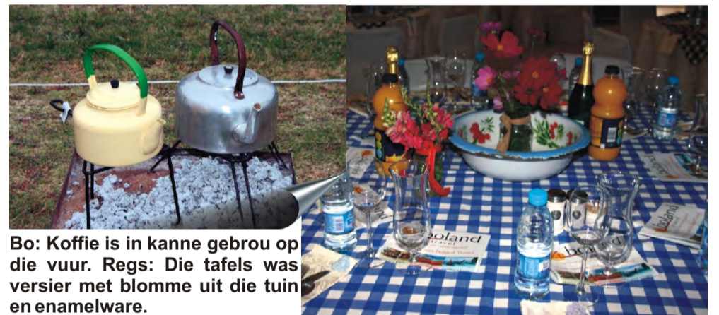
Bo: Koffie is in kanne gebrou op die vuur. Regs: Die tafels was versier met blomme uit die tuin en enamelware.