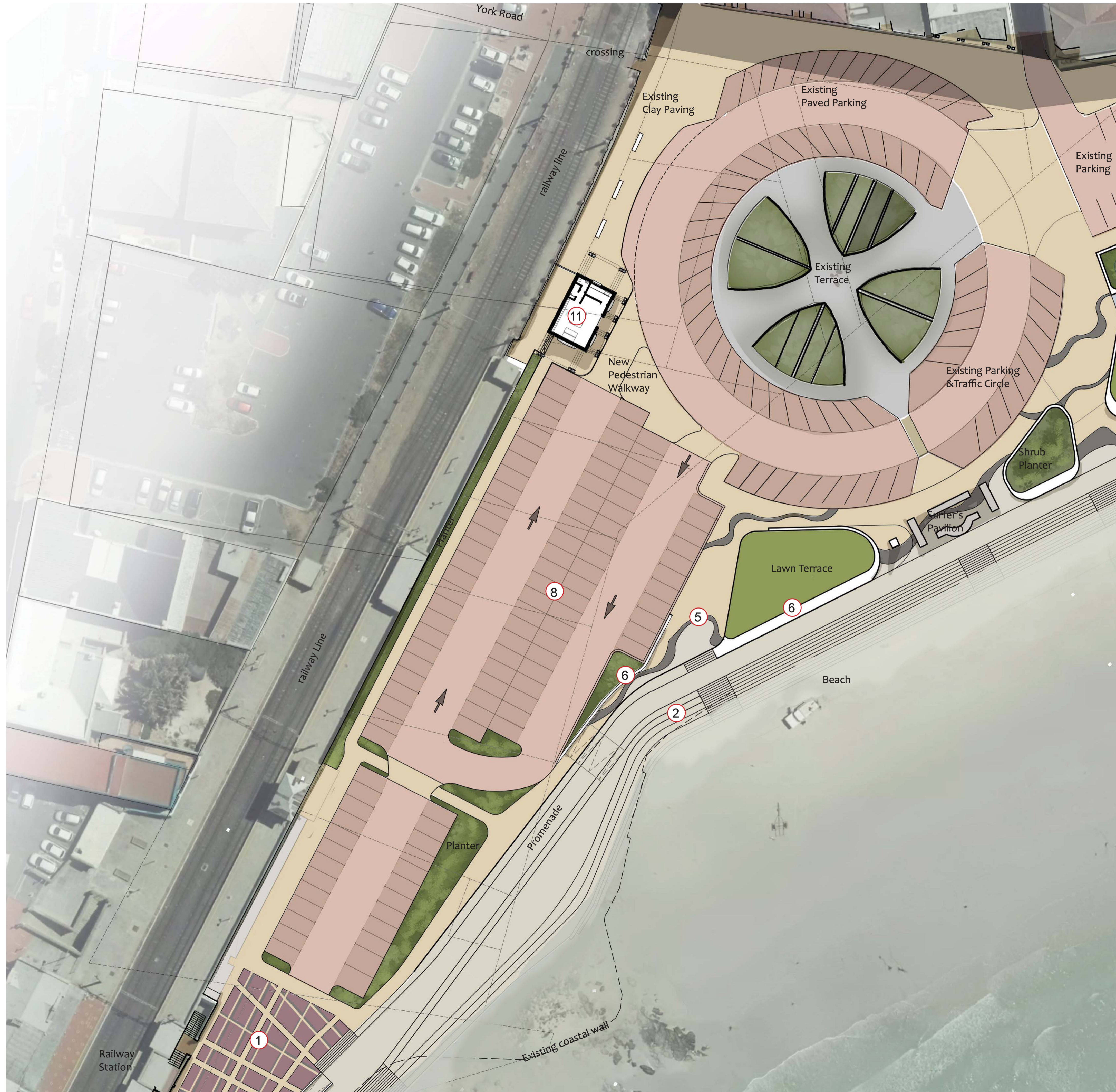
Landscape Concept Plan - West Parking scale 1:300@A1