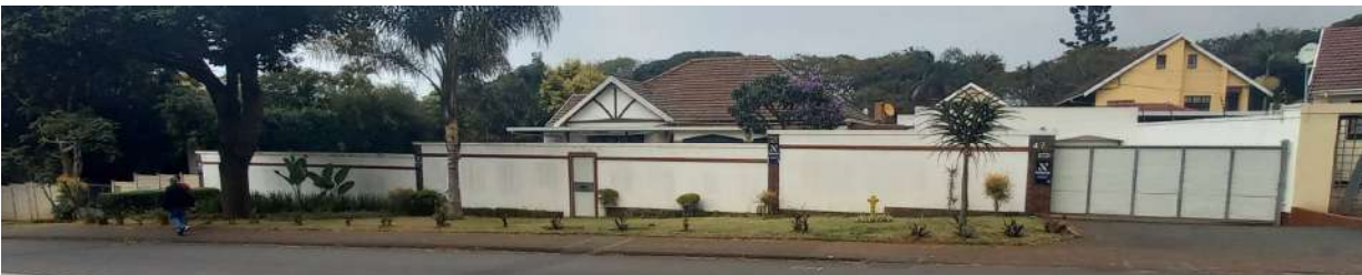
(Authors Picture) (NEIGHBOURS PICTURE) 47 ROMSEY GR.