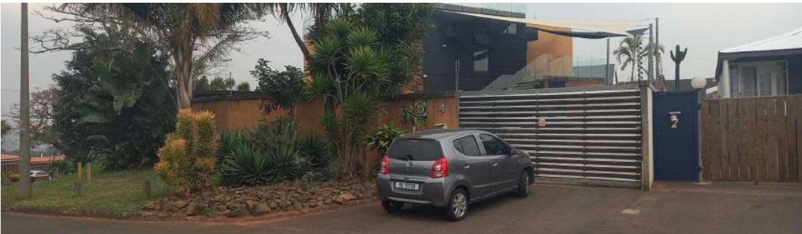
(Authors Picture) (NEIGHBOURS PICTURE) 4 COLLARD RD.