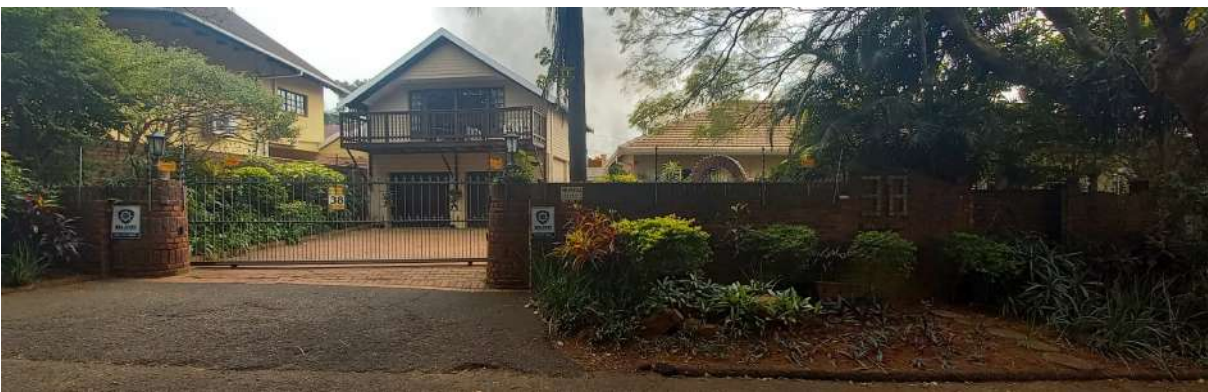
(Authors Picture) (NEIGHBOURS PICTURE) 38 ST KILDA AVE.