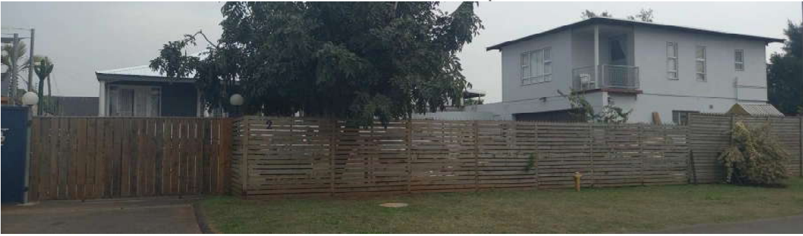
(Authors Picture) (NEIGHBOURS PICTURE) 2 COLLARD RD.