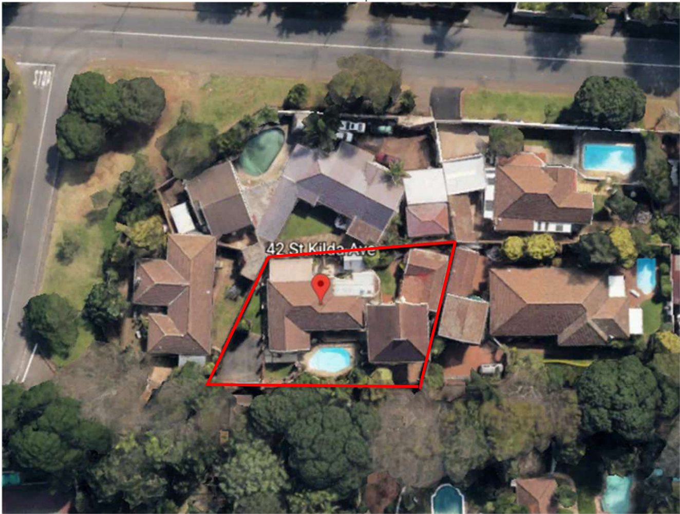
(GOOGLE EARTH) ARIEL SITE: 1: 50 000