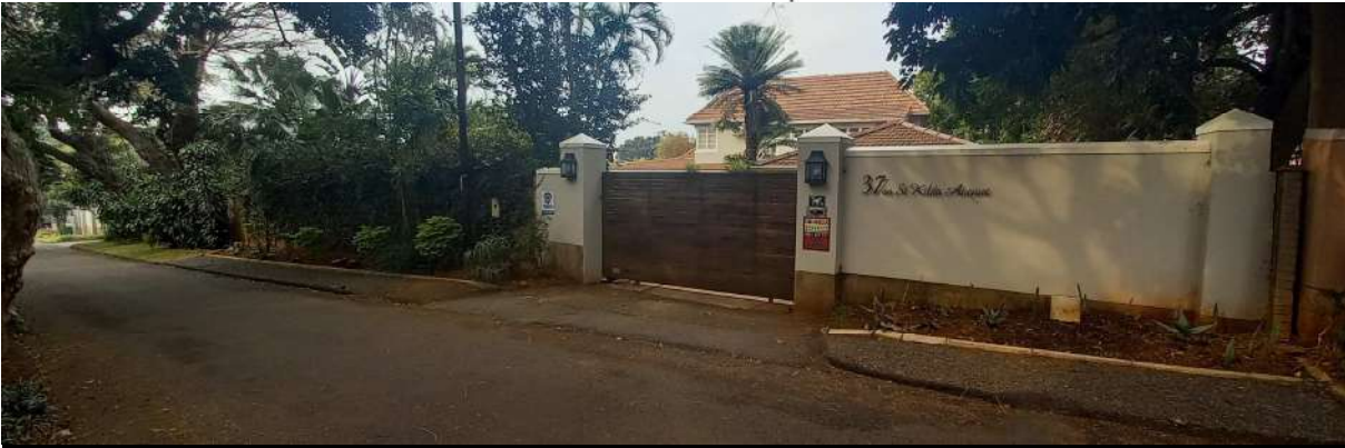
(Authors Picture) (NEIGHBOURS PICTURE) 37 ST KILDA AVE.