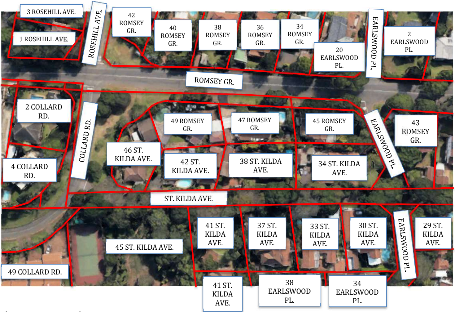
(GOOGLE EARTH) ARIEL SITE