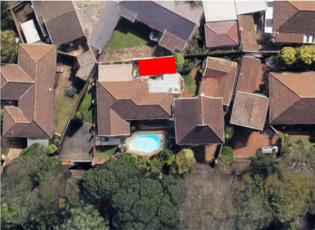
(GOOGLE EARTH) SITE