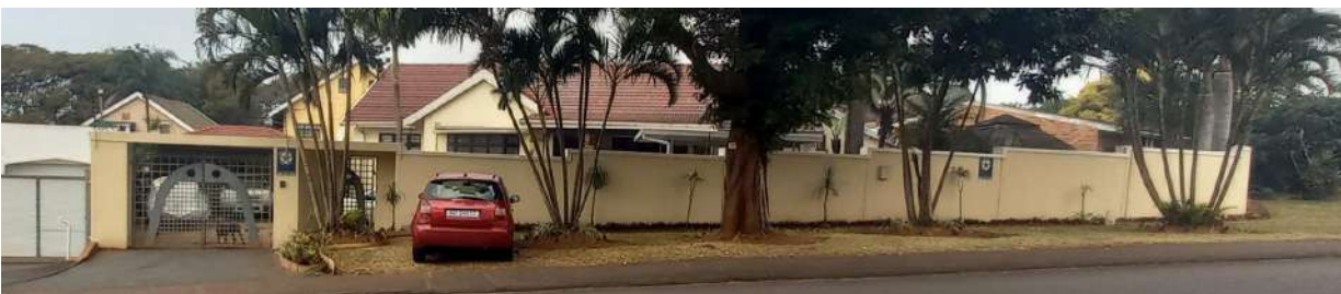
(Authors Picture) (NEIGHBOURS PICTURE) 49 ROMSEY GR.