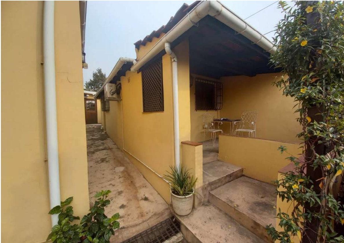
FRONT VIEW OF BUILDING