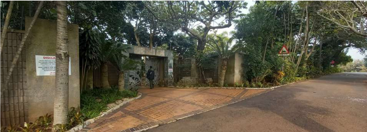
(Authors Picture) (NEIGHBOURS PICTURE) 45 ST KILDA AVE.