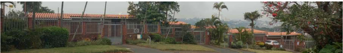
(Authors Picture) (NEIGHBOURS PICTURE) 49 COLLARD RD.