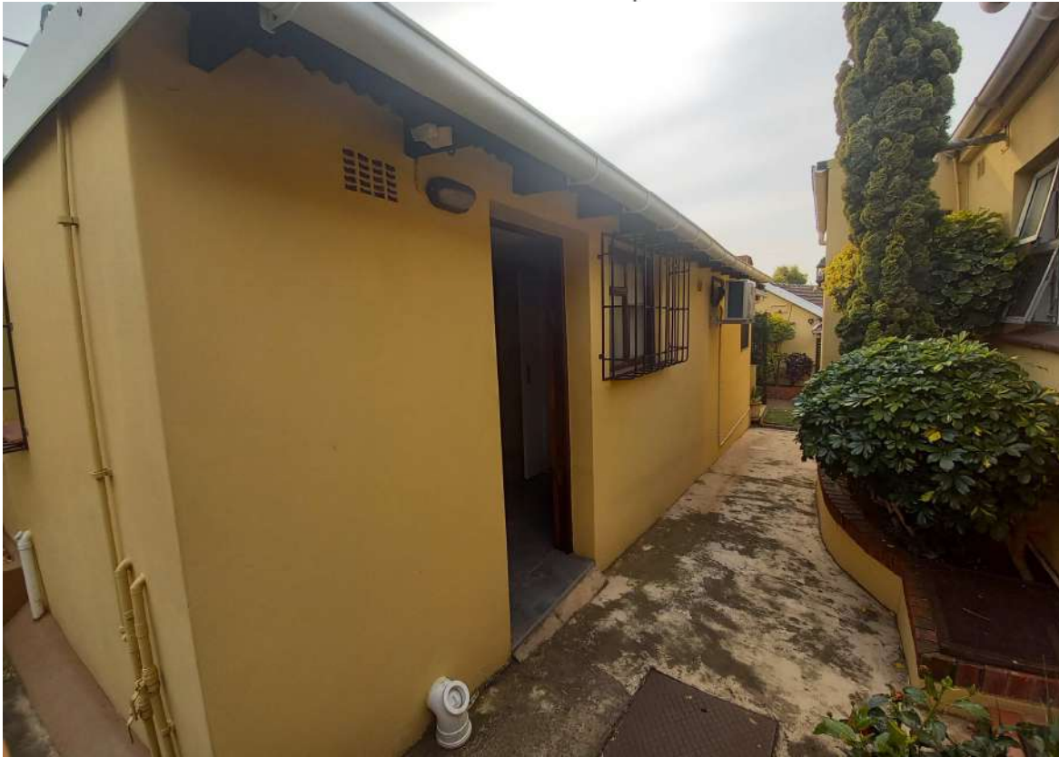
RIGHT VIEW OF BUILDING