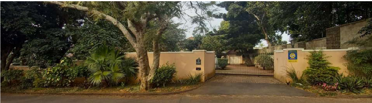
(Authors Picture) (NEIGHBOURS PICTURE) 41 ST KILDA AVE.