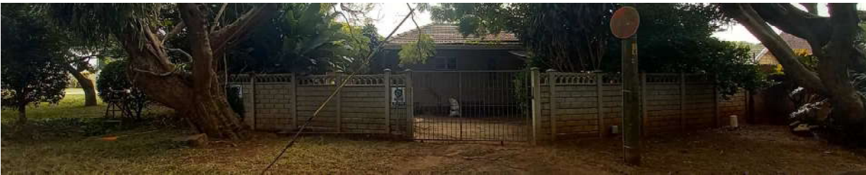
(Authors Picture) (NEIGHBOURS PICTURE) 46 ST KILDA AVE.