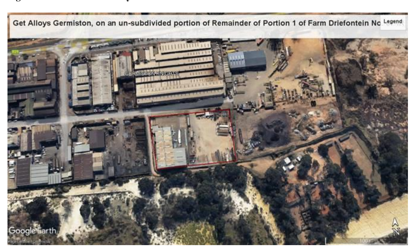
Figure 1 Site Locality

The Environmental Practice has been appointed by the applicant, Get Alloys (Pty) Ltd, to make application for authorisation of a proposed new scrap aluminium and copper recycling and recovery foundry. The foundry is to be situated on an un-subdivided portion of Remainder of Portion 1 of Farm Driefontein No. 87-IR, situated in Shaft Road, Germiston Knights.