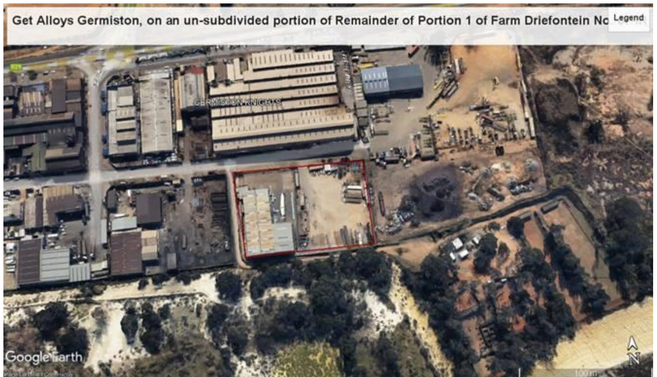
Figure 1 Site Locality

The Environmental Practice has been appointed by the applicant, Get Alloys (Pty) Ltd, to make application for authorisation of a proposed new scrap aluminium and copper recycling and recovery foundry. The foundry is to be situated on an un-subdivided portion of Remainder of Portion 1 of Farm Driefontein No. 87-IR, situated in Shaft Road, Germiston Knights.