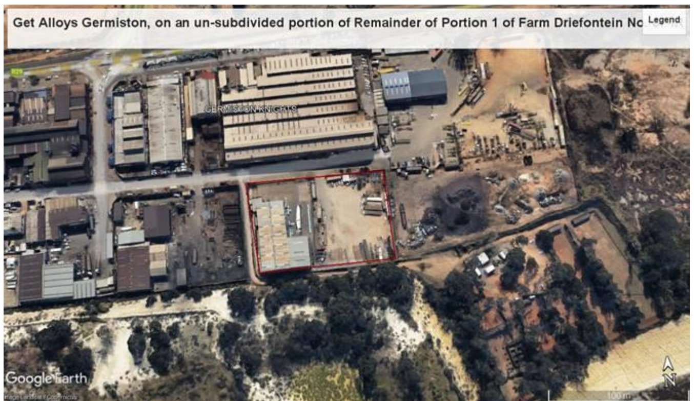
Figure 1 Site Locality

The Environmental Practice has been appointed by the applicant, Get Alloys (Pty) Ltd, to make application for authorisation of a proposed new scrap aluminium and copper recycling and recovery foundry. The foundry is to be situated on an un-subdivided portion of Remainder of Portion 1 of Farm Driefontein No. 87-IR, situated in Shaft Road, Germiston Knights.