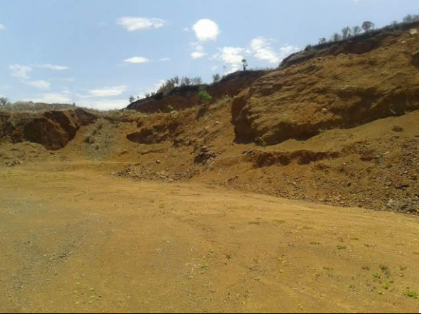
PHOTOGRAPHS OF THE SUGAR CANE FIELDS AND SOUTH-WESTERN SIDE OF THE EXISTING QUARRY PIT