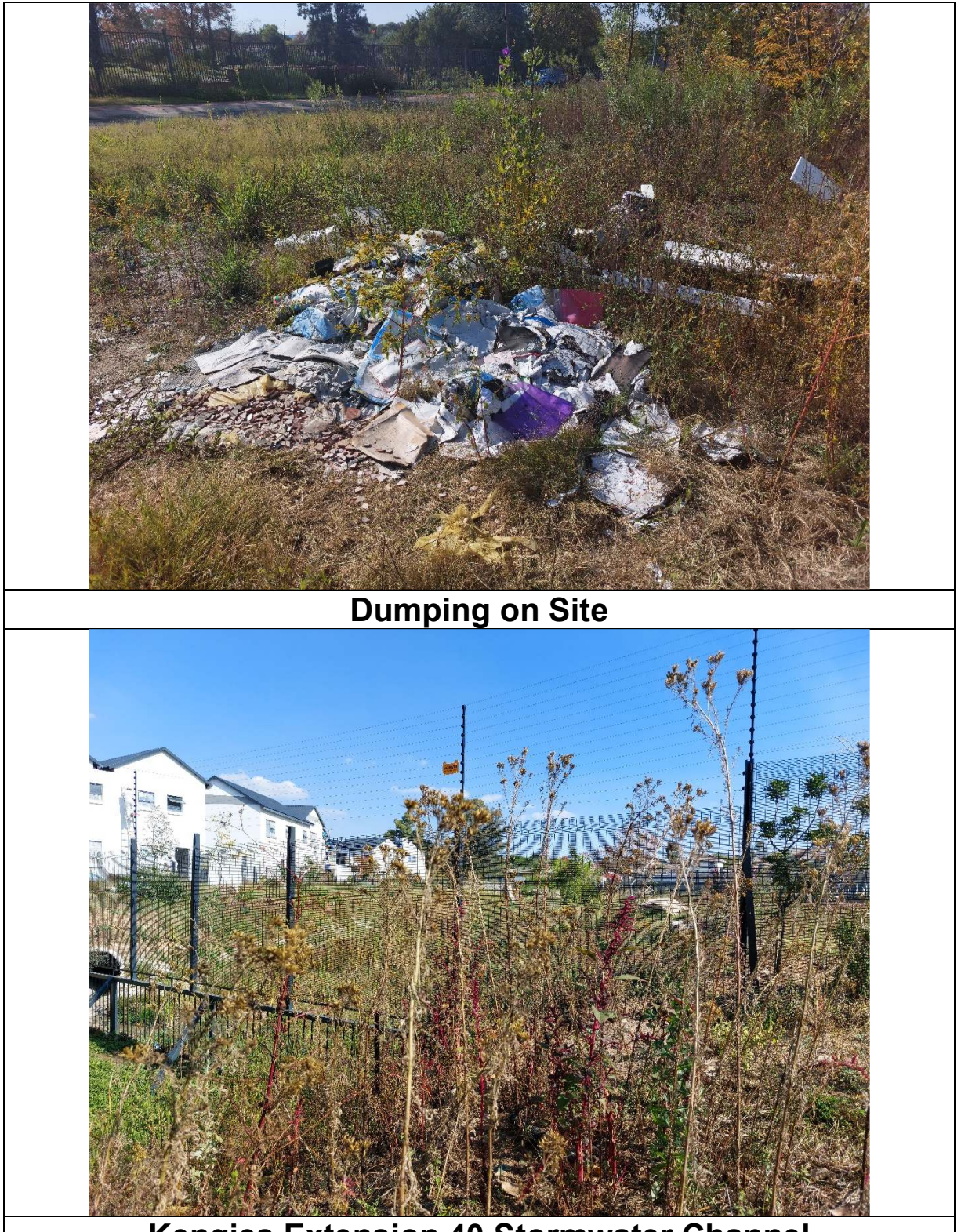
Kengies Extension 40 Stormwater Channel