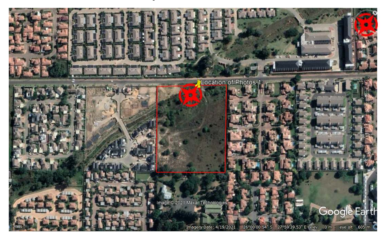
Figure 1: Location of Compass Photos