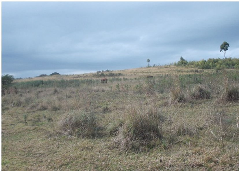
Fig 1. General view of proposed development area

General GPS co-ordinate: S30^{\circ} 24' 21.6'' E30^{\circ} 03' 47.2''