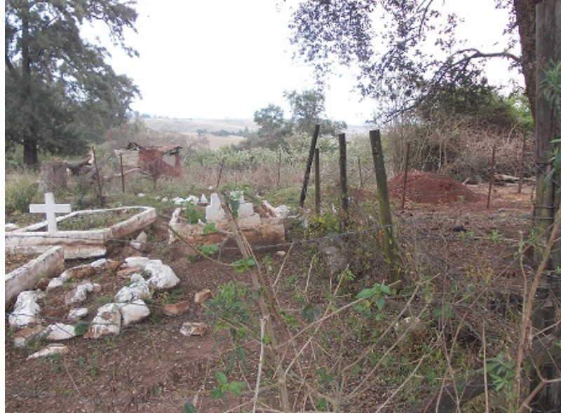
Fig 2. View of family cemetery.