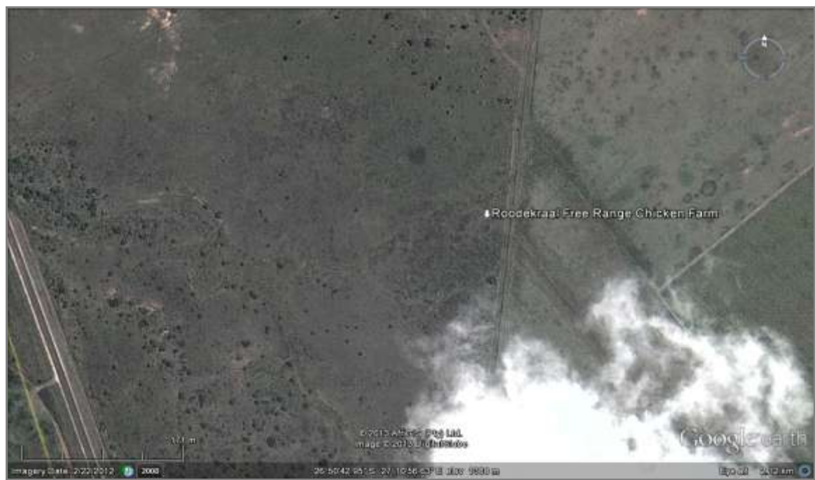
Figure 1: Google earth image of site

Portion 2 of the farm Roodekraal 454 IQ. The project site is located approximately 16.6km to the south-east of Potchefstroom. The GPS coordinates for the site are: 26°50'42.01"S; 27°10'59.52"E. The site falls under the jurisdiction of the Tlokwe City Council and Dr. Kenneth Kaunda District Municipality, Northwest Province.