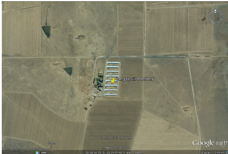
Figure 1: Google earth image of site

Portion 48 of the farm Diepspruit 414 IS. The site is approximately 16.8km east of Standerton. The GPS coordinates for the site are: 26°56'54.36"S; 29°25'1.53"E. The site is situated within the Lekwa Local Municipality of the Gert Sibande District Municipality, Mpumalanga Province.