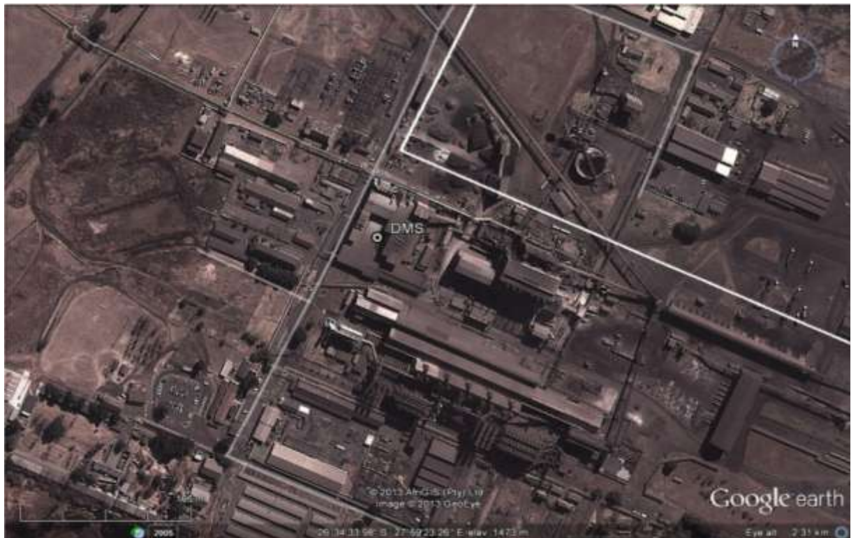
Figure 1: Google earth image of site

The project site is located on Portion 4 of the farm Kookfontein 545 IQ in Meyerton, which is approximately 8.7km's to the north of Vereeniging. GPS coordinates for the site are: -26.579006°S; 27.987272°E. The site is situated within the Midvaal Local Municipality of the Sedibeng District Municipality, Gauteng Province.