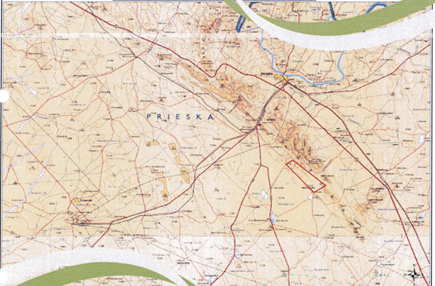
LOCALITY OF THE APPLICATION AREA IN RELATION TO THE TOWN OF PRIESKA