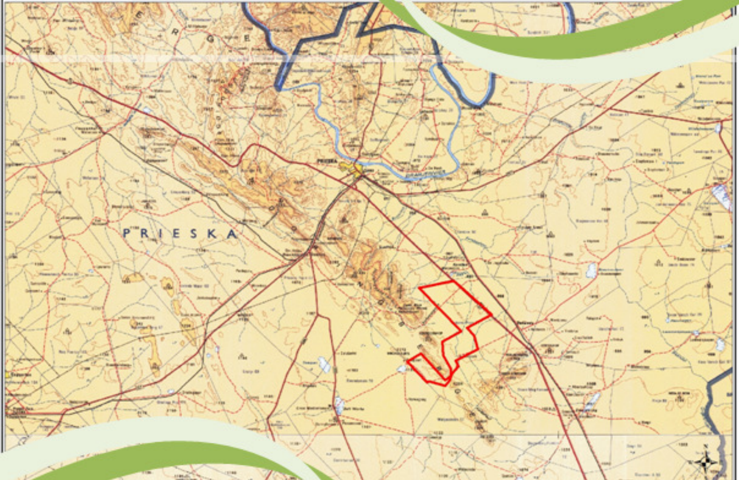
LOCALITY OF THE APPLICATION AREA IN RELATION TO THE TOWN OF PRIESKA, NORTHERN CAPE PROVINCE