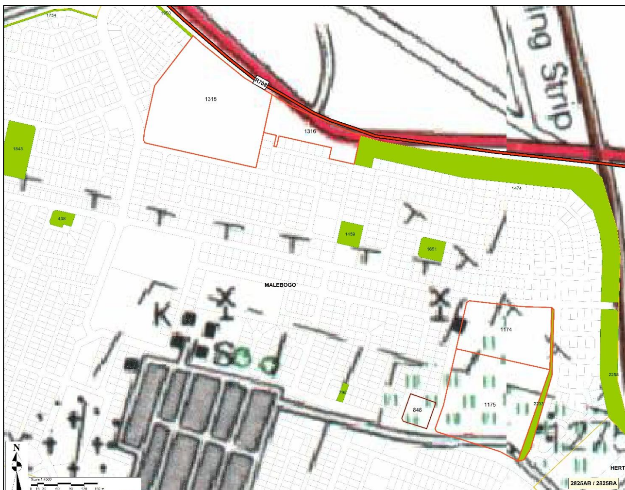
Figure 2: Malebogo Erven 1315 & 1316; and Malebogo Erven 1174, 1175, 848 and 2233 in relation to surrounding erven and services.