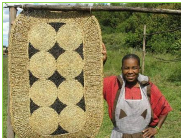
Plate B: Commercial products made by locals from reeds harvested from wetlands.