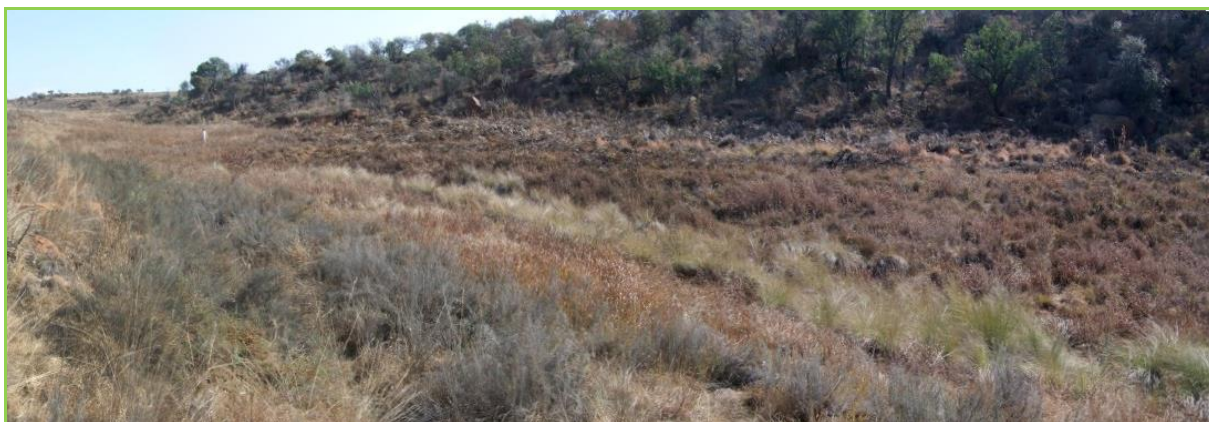
Plate A: A large, seasonal wetland identifiable by the characteristic flora. This wetland contained no surface water at the time of the photograph.

variety of locations across the landscape (Plate A), and may even occur at the top of a hill, nowhere near a river. A pan, for example, is a wetland which forms in a depression. Wetlands also come in many sizes; they can be as small as a few square metres (e.g. at a low point along the side of a road) or cover a significant portion of a country (e.g. the Okavango Delta).