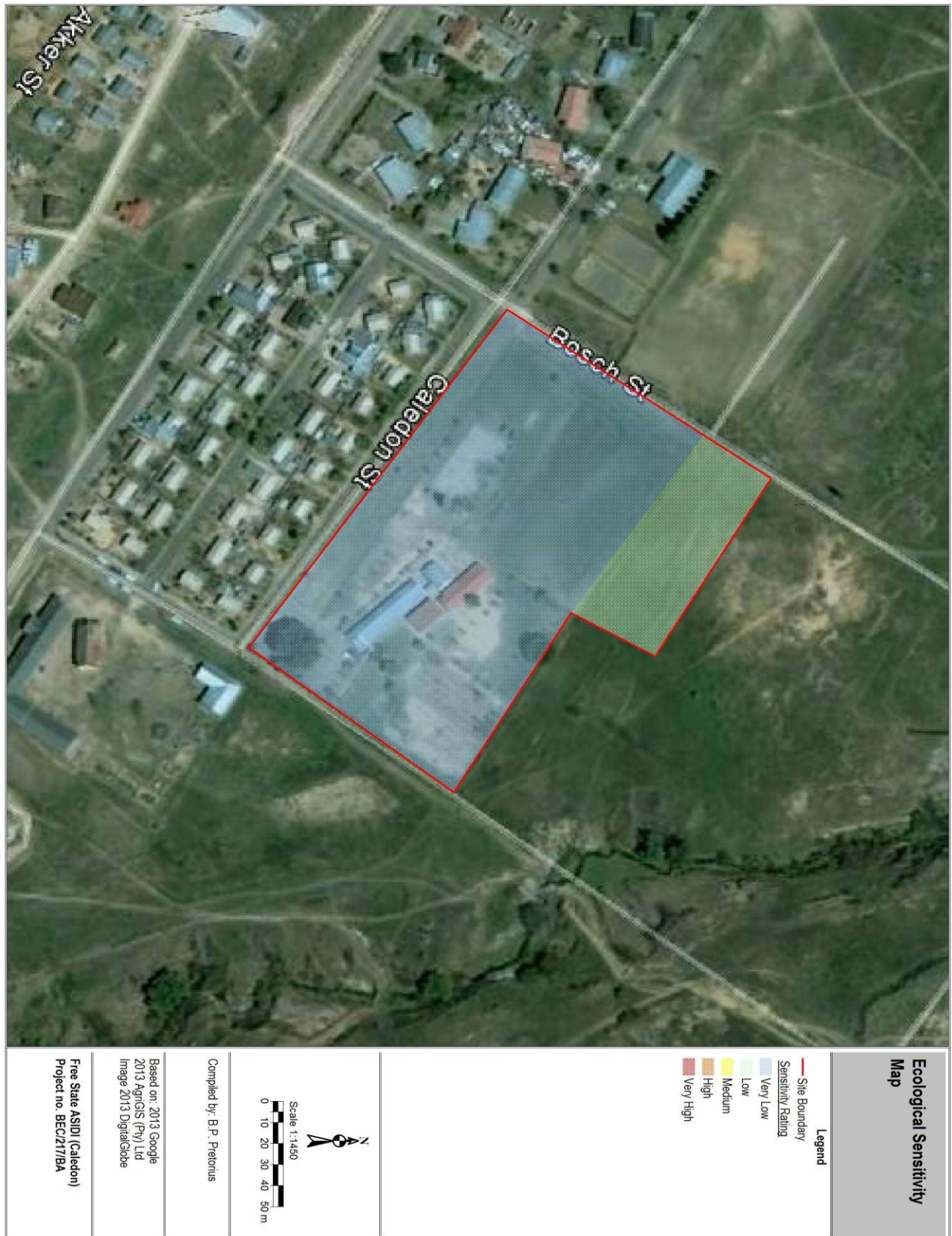
Figure 2: Sensitivity Map