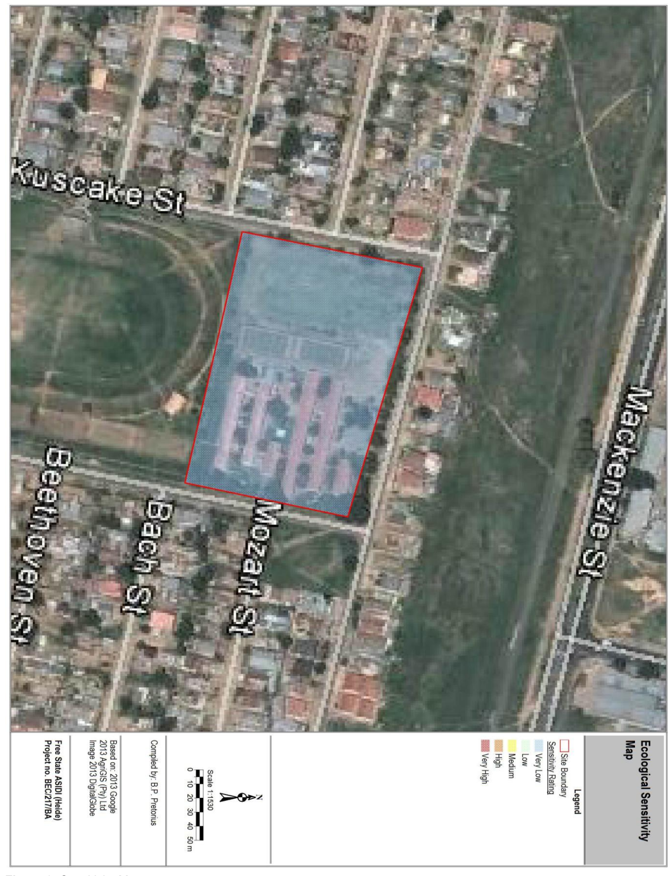
Figure 2: Sensitivity Map